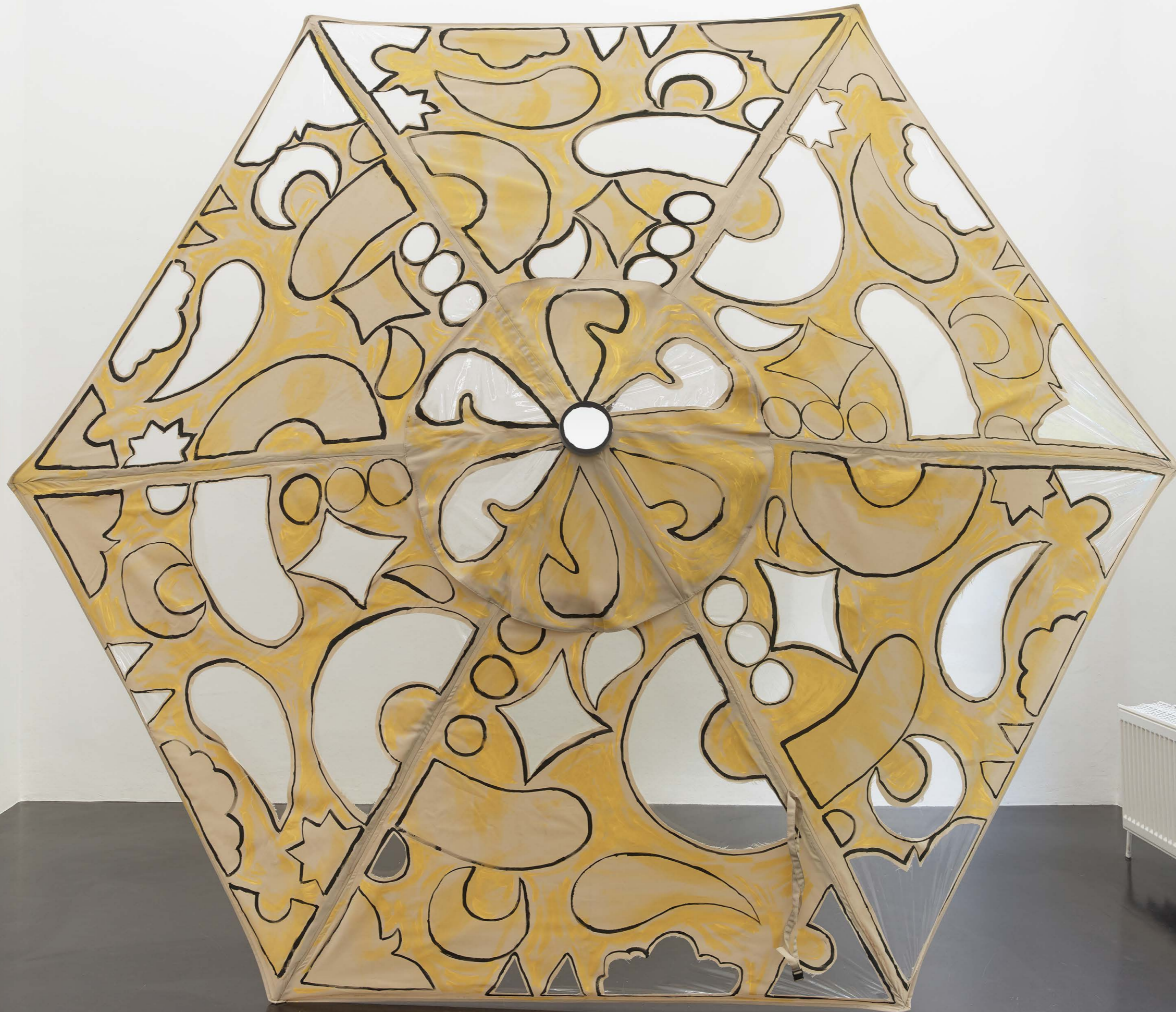
›Literal Umbrella‹ patio umbrella, vinyl, paint 250 x 270 x 230 cm 2022