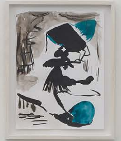
›Untitled (prompt based)‹ ink on Fabriano paper, framed 35,5 x 28,3 cm 2022