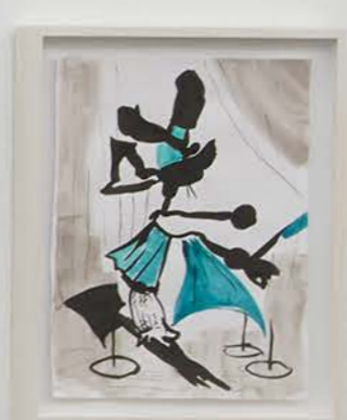
›Untitled (prompt based)‹ ink on Fabriano paper, framed 35,5 x 28,3 cm 2022