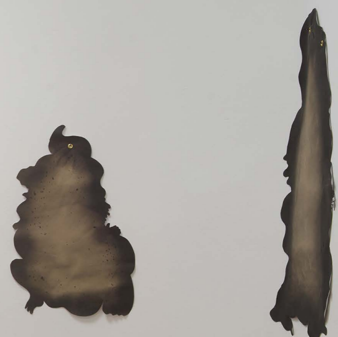
›untitled (umbrellas)‹ 65 x 45 cm 2022