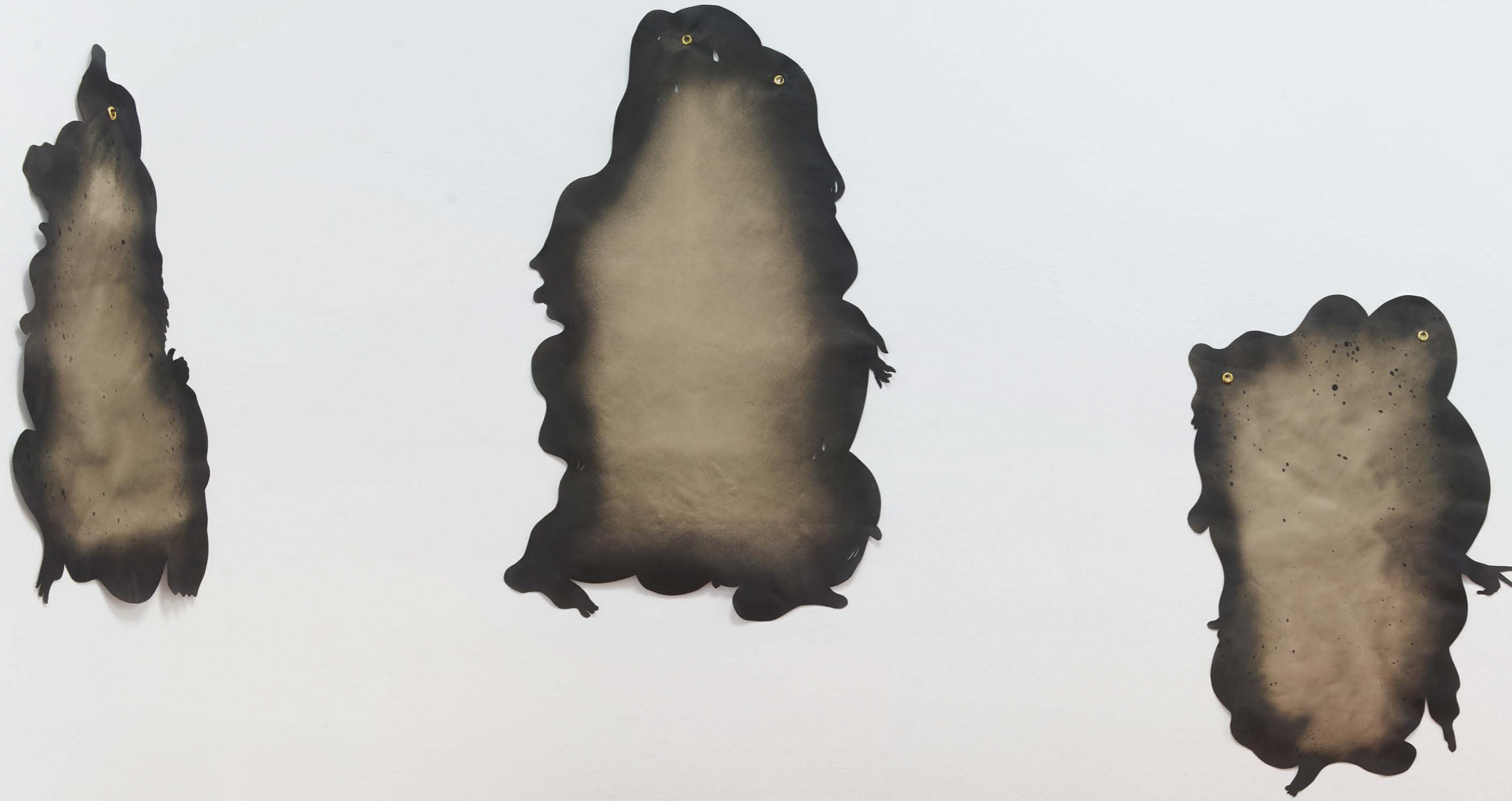
›Potatoes‹ synthetics 80 x 50 cm; 65 x 45 cm; 55 x 35 cm 2022