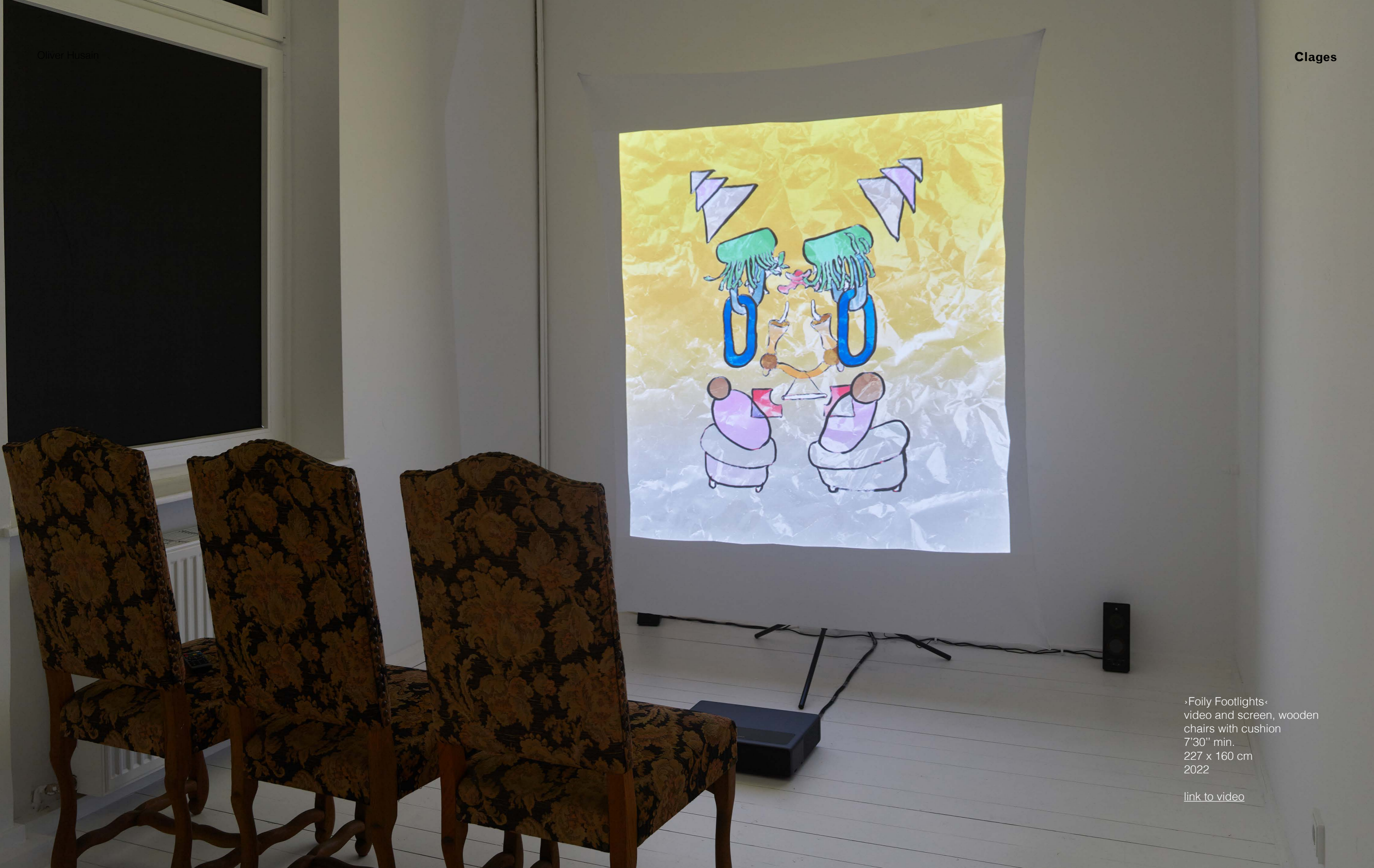
›Foily Footlights‹ video and screen, wooden chairs with cushion 7'30" min. 227 x 160 cm 2022