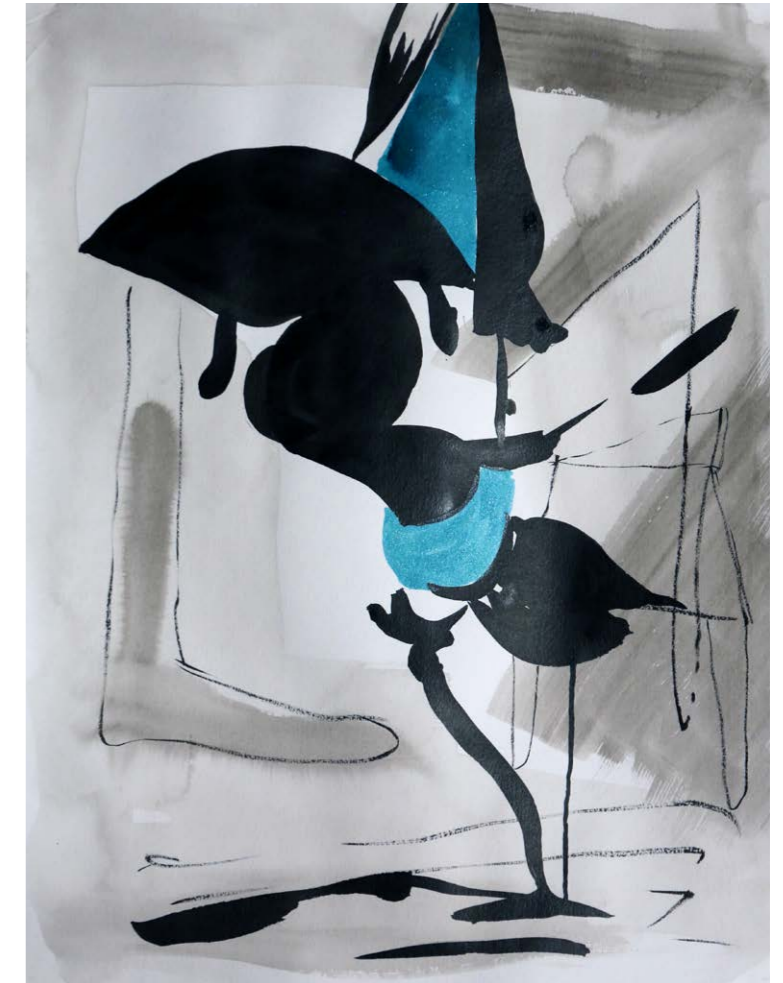
›Untitled (prompt based)‹ ink on Fabriano paper, framed 35,5 x 28,3 cm 2022