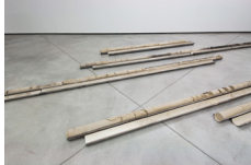
Giorgio Andreotta Calò Carotaggio (Venezia) , 2014 Caranto clay, steel, PVC drilling tubes Installation of eight unique elements; variable dimensions