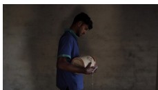
Basir Mahmood Ahmedpur East , 2022 Single Channel Video Projektion Dauer 9'34'' Ed. 5+1 AP