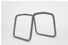
Gordon Hall Companion Stool (2), 2022 Steel, modeling compound, pigment 19 1/2 x 19 x 15 1/2 in. 49.5 x 48.3 x 39.4 cm.