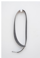
Gordon Hall Belt, 2022 Colored pencil on paper, painted wood peg 20 x 7 x 3 in. 50.8 x 17.8 x 7.6 cm.