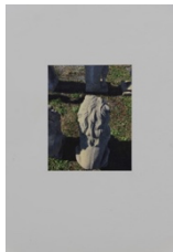
Gordon Hall TURN BACK (Rubbing), 2022 Rub-on photo transfer 6 x 4 3/4 in. 15.2 x 12.1 cm.