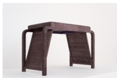
Gordon Hall Shoe Stool, 2022 Poplar, ballpoint pen 18 1/2 x 28 x 14 1/2 in. 47 x 71.1 x 36.8 cm.