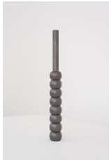
Gordon Hall Turned Leg, 2022 Graphite on poplar, gouache painting on paper for textile design for satin upholstery, circa 1900, France 20 1/2 x 2 1/4 x 2 1/4 in. 52.1 x 5.7 x 5.7 cm.