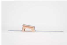
Gordon Hall Judy's Footstool, 2022 Oak, modeling compound, paper, enamel 16 x 58 x 7 in. 40.6 x 147.3 x 17.8 cm.

Gordon Hall TURN BACK September 17 – October 29, 2022