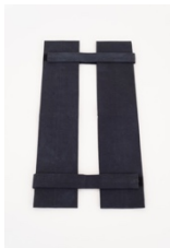
Gordon Hall Two-part Fold, 2022 Hand-dyed cotton, hook and loop tape 19 3/4 x 10 x 3/32 in. 50.2 x 25.4 x 0.3 cm.