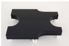
Gordon Hall Horizontal Panel (Tank Top), 2022 Oil-based enamel on poplar, cast concrete 3 x 18 1/2 x 14 1/4 in. 7.6 x 47 x 36.2 cm.