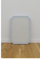
Gordon Hall Mirror Panel, 2022 Cast concrete, gouache 28 1/4 x 20 x 2 in. 71.8 x 50.8 x 5.1 cm.