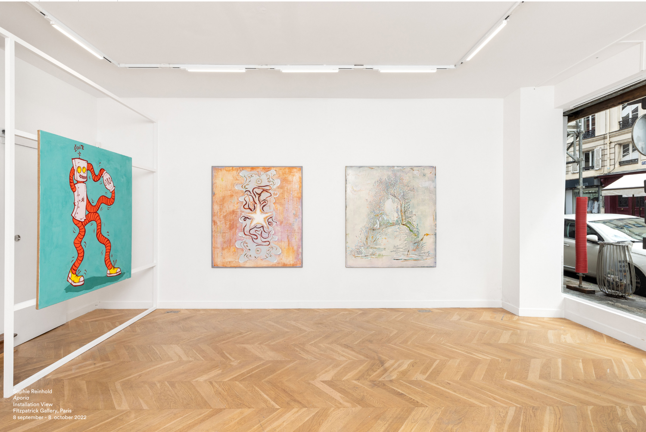
Sophie Reinhold Aporia Installation View Fitzpatrick Gallery, Paris 8 september - 8 october 2022