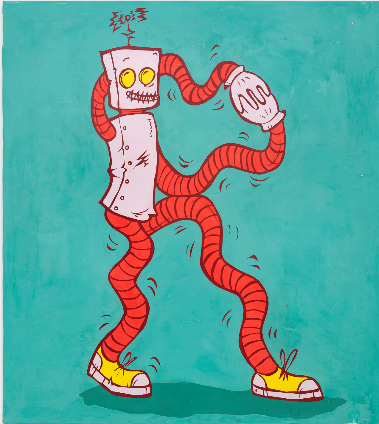
Sophie Reinhold APORIA (R) , 2022

Pigmented marble powder on jute 140 x 125 cm 55 1/8 x 49 1/4 in