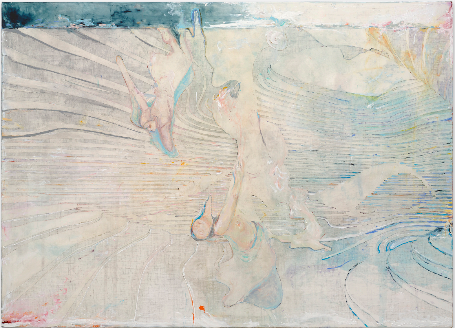
Sophie Reinhold The Escapology of the Game of Life , 2022

Oil on marble powder on jute 180 x 250 cm 98 3/8 x 70 7/8 in