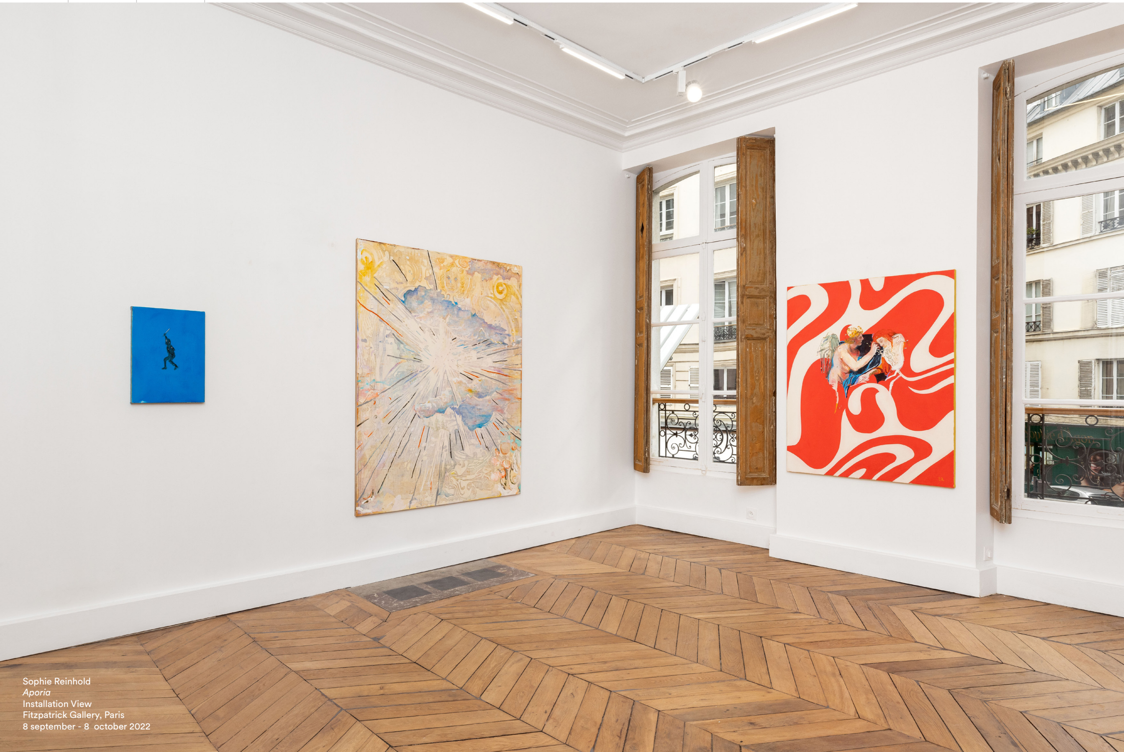
Sophie Reinhold Aporia Installation View Fitzpatrick Gallery, Paris 8 september - 8 october 2022