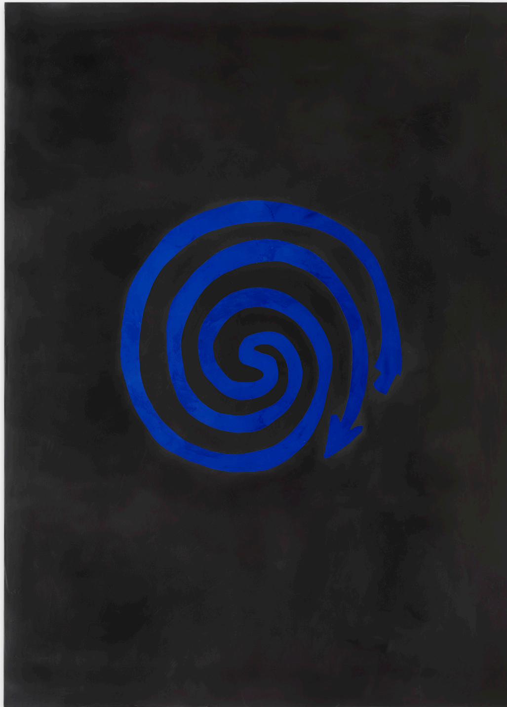
Sophie Reinhold Untitled (Spiral of Pursuit), 2022

Pigmented marble powder on graphite on jute 250 x 180 cm 98 3/8 x 70 7/8 in