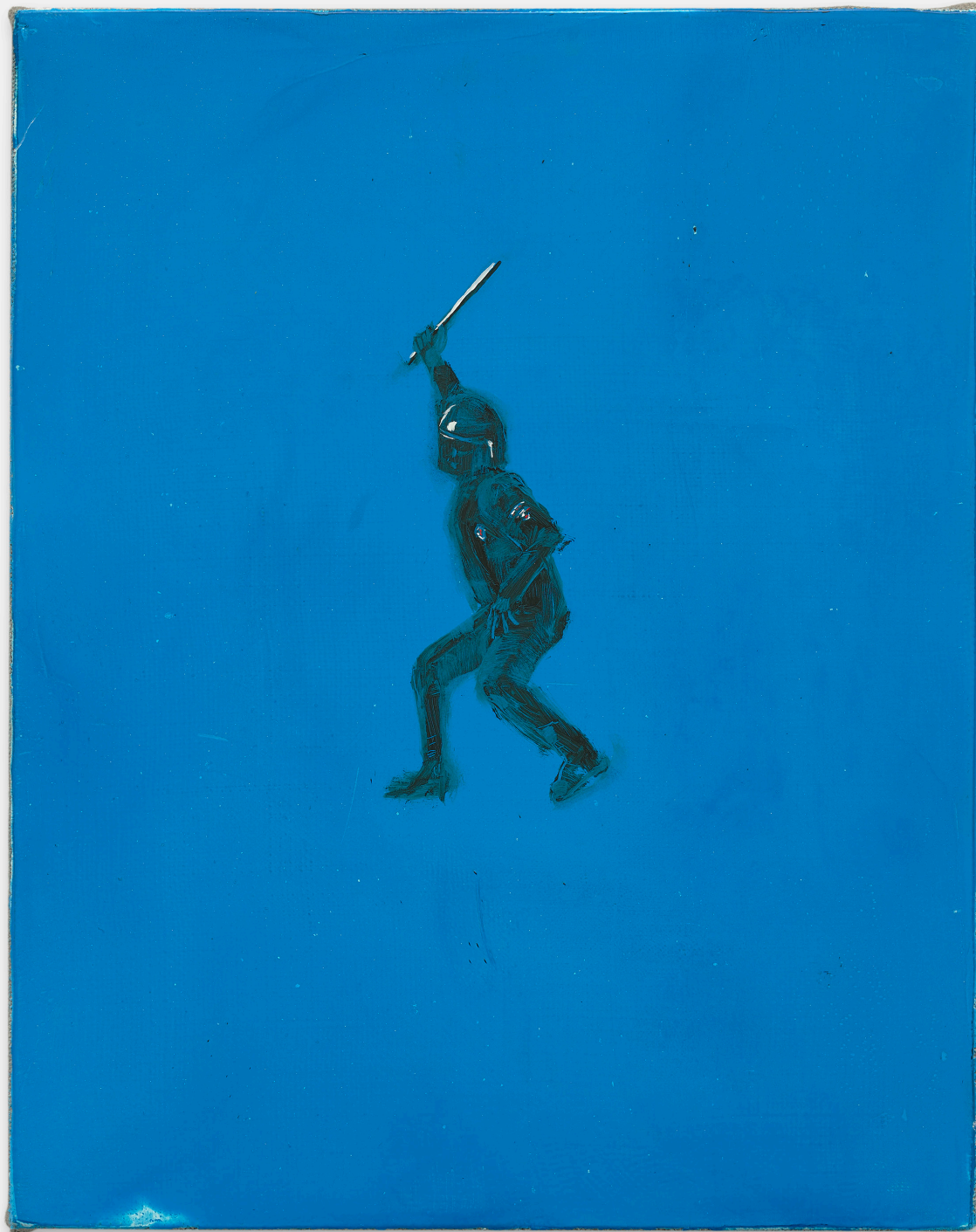
Sophie Reinhold Delusion is Short, Remorse is Long, 2022

Oil on pigmented marble powder on jute 50 x 40 cm 19 3/4 x 15 3/4 in