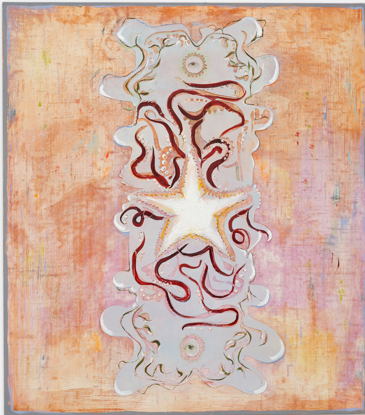
Sophie Reinhold APORIA (I) , 2022

Oil on marble powder on jute 140 x 125 cm 55 1/8 x 49 1/4 in