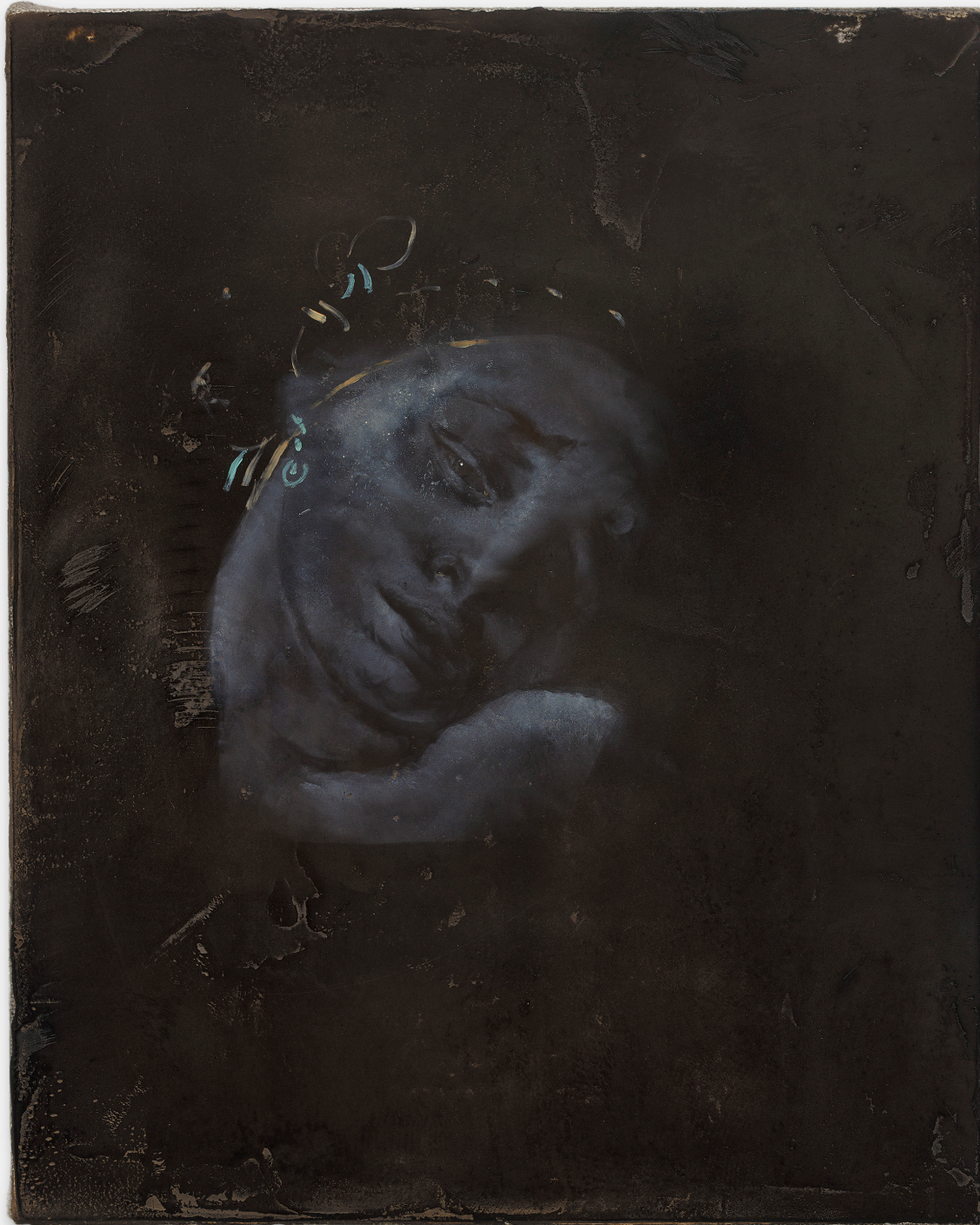
Sophie Reinhold Remorse is Long, Delusion is Short, 2022

Oil on asphalt on marble powder on jute 50 x 40 cm 19 3/4 x 15 3/4 in