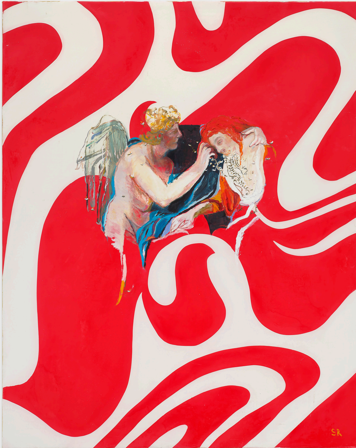
Sophie Reinhold Die Allegorie von Amor und Psyche ( L'allégorie de Cupidon et Psyché ), 2022

Oil on canvas 214.2 x 162.7 cm 84 3/8 x 64 1/8 in