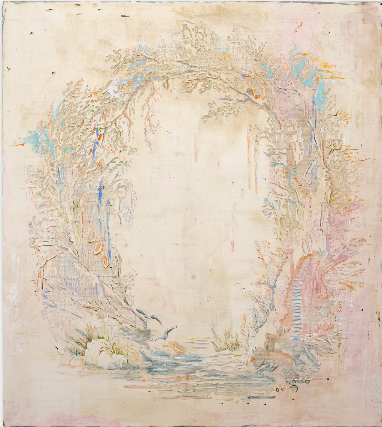
Sophie Reinhold APORIA (O) , 2022

Oil on marble powder on jute 140 x 125 cm 55 1/8 x 49 1/4 in