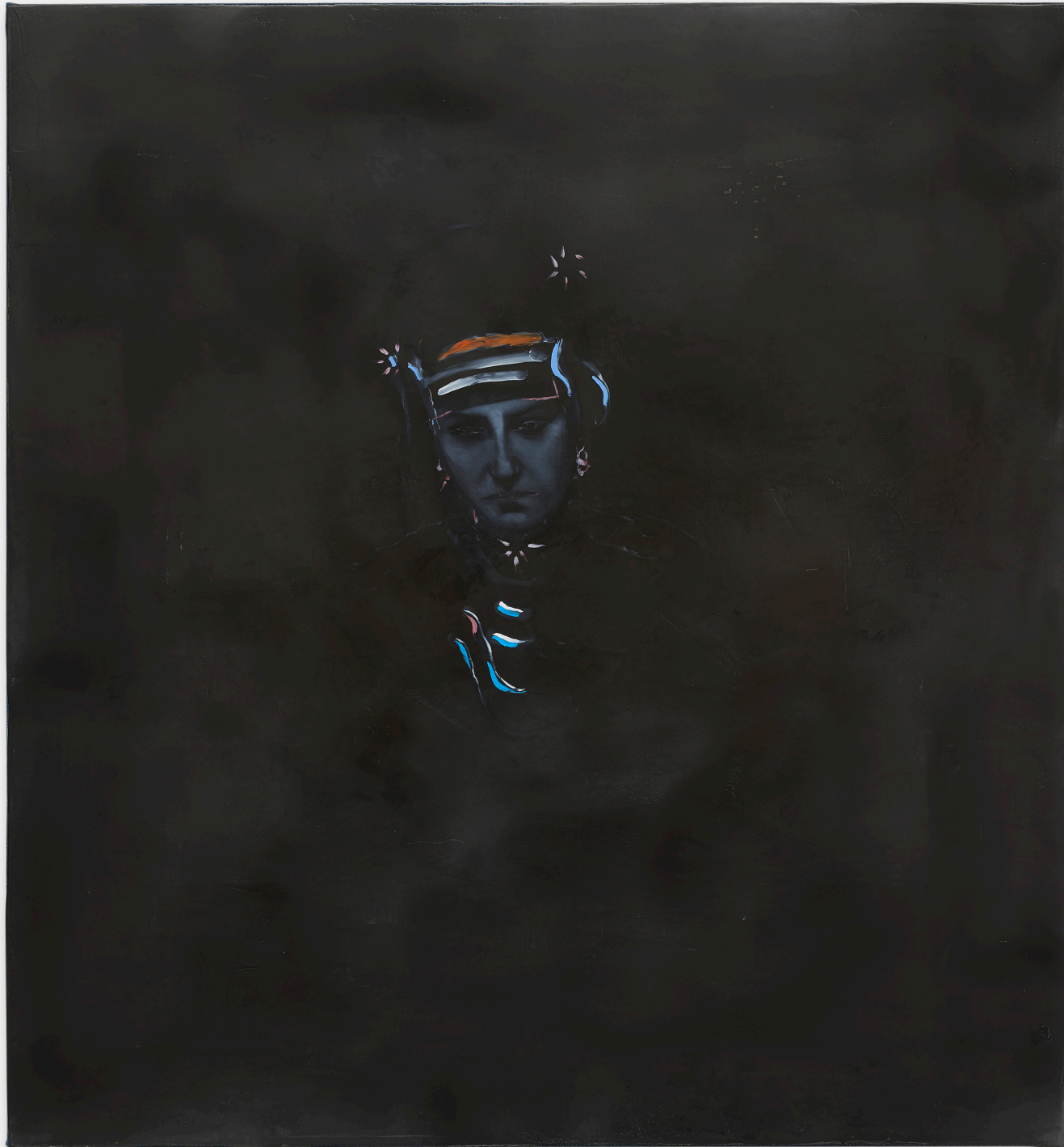
Sophie Reinhold Portrait of an Overwhelmed Person Through Silent Reproach, 2022

Oil on graphite on marble powder on jute 120 x 110 cm 47 1/4 x 43 1/4 in