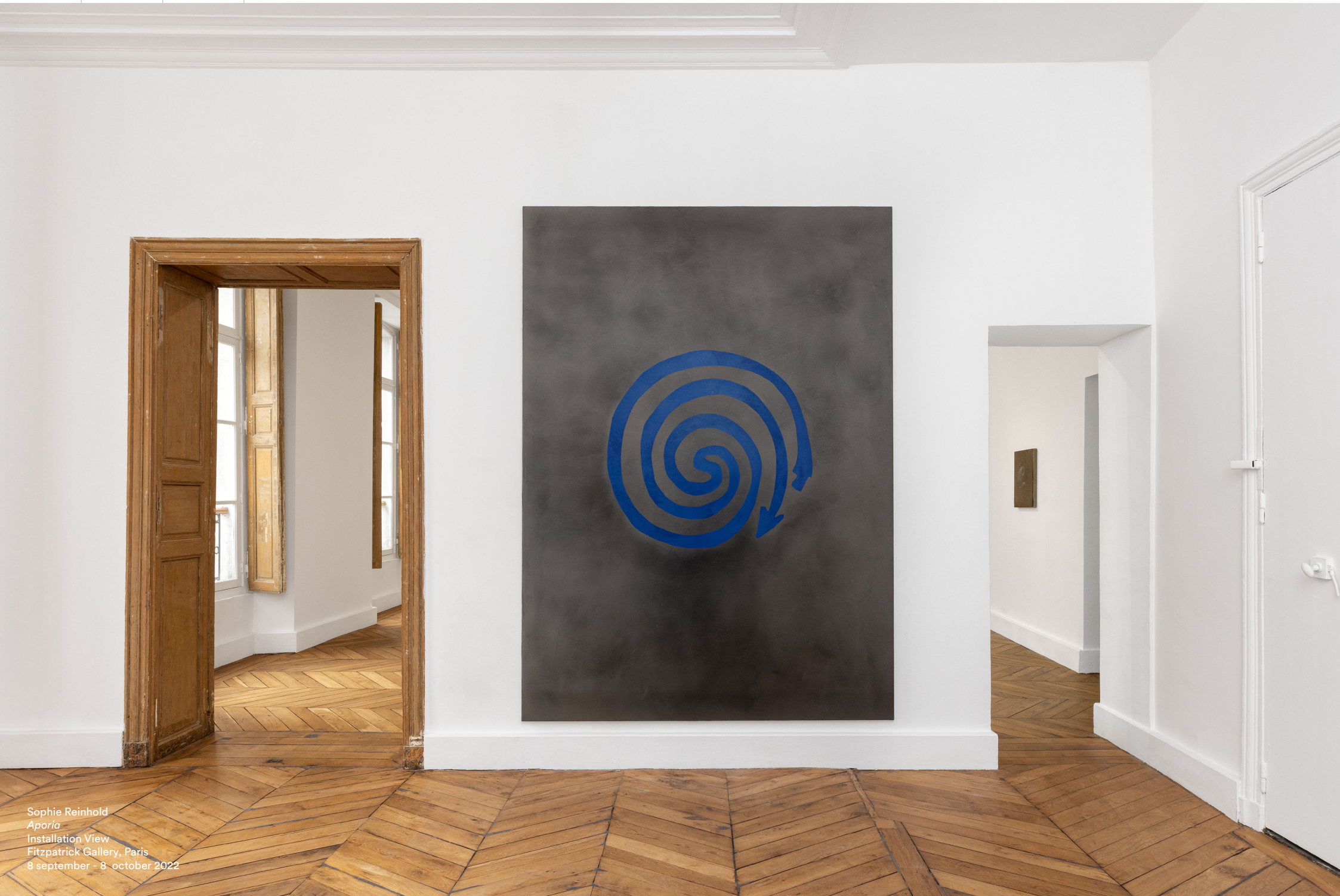
Sophie Reinhold Aporia Installation View Fitzpatrick Gallery, Paris 8 september - 8 october 2022