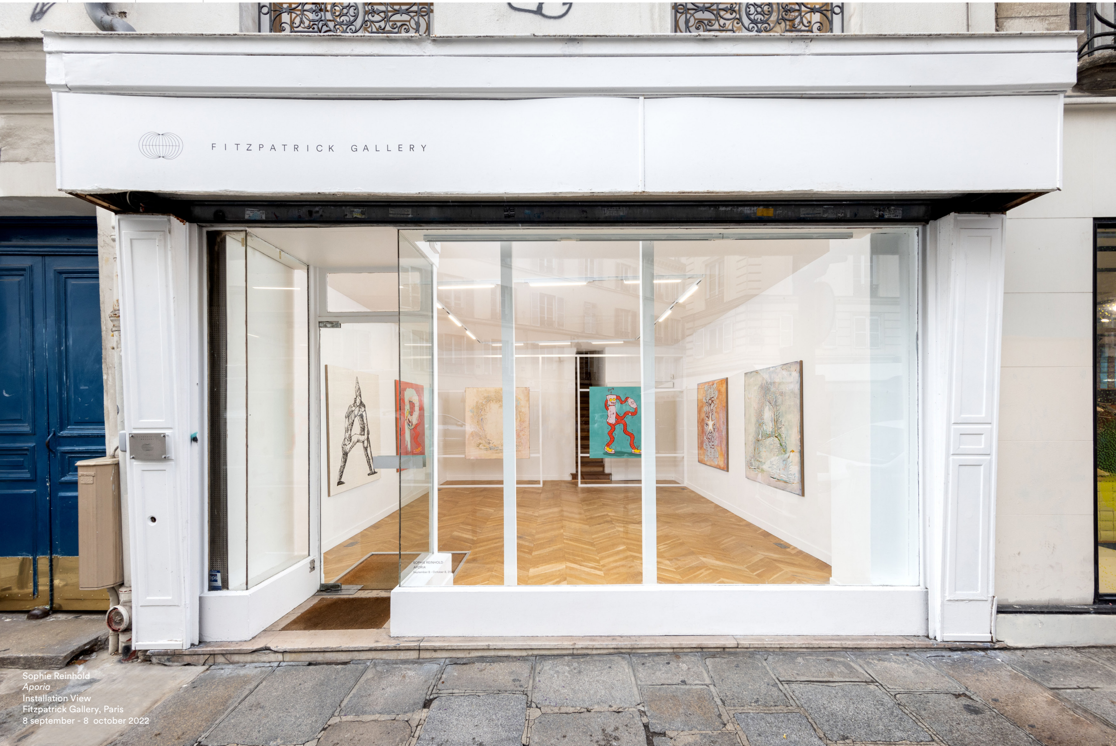
Sophie Reinhold Aporia Installation View Fitzpatrick Gallery, Paris 8 september - 8 october 2022