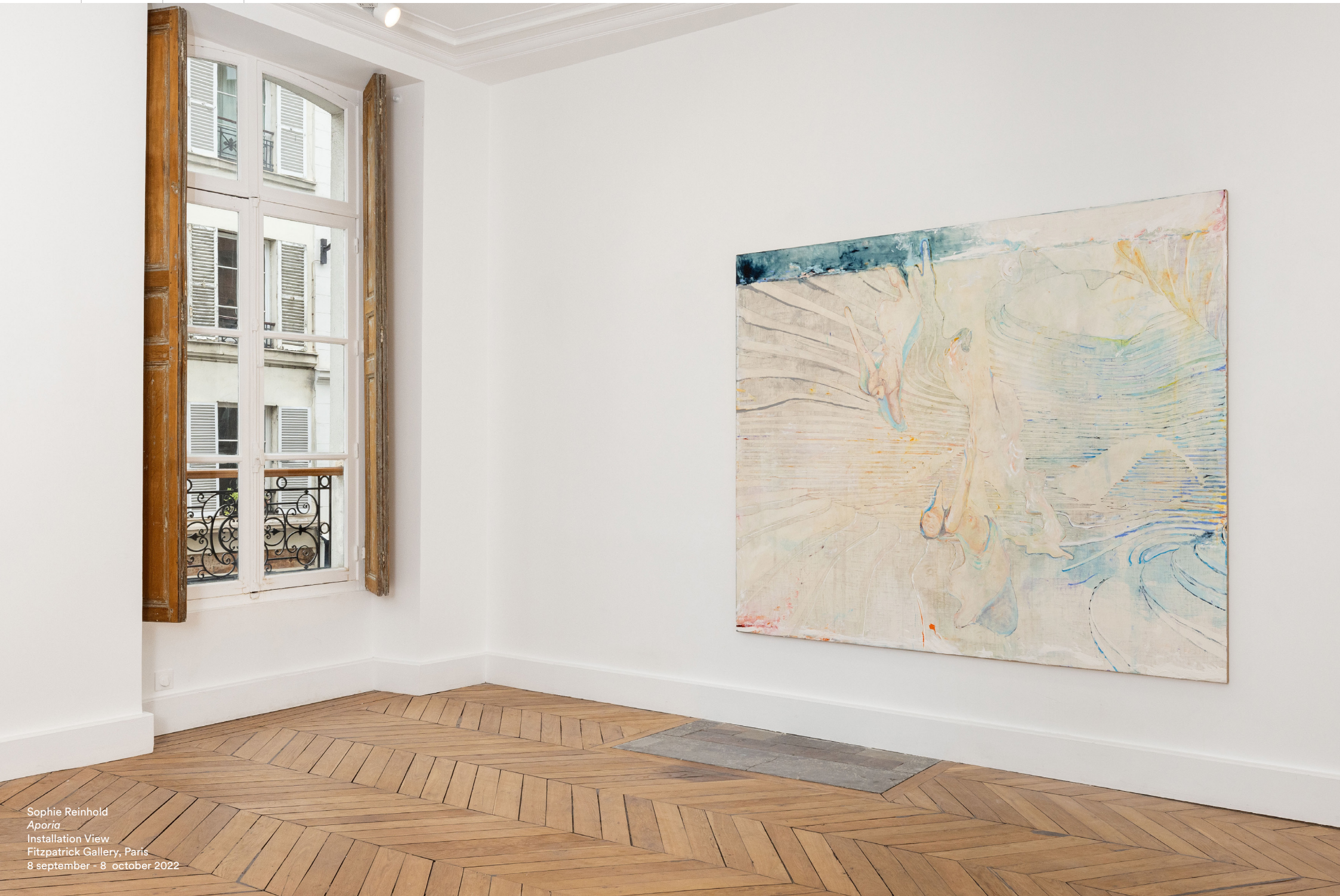
Sophie Reinhold Aporia Installation View Fitzpatrick Gallery, Paris 8 september - 8 october 2022