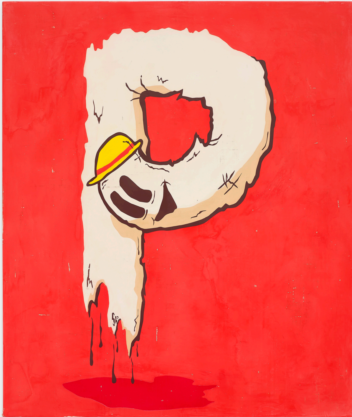
Sophie Reinhold APORIA (P) , 2022

Pigmented marble powder on jute 140 x 125 cm 55 1/8 x 49 1/4 in