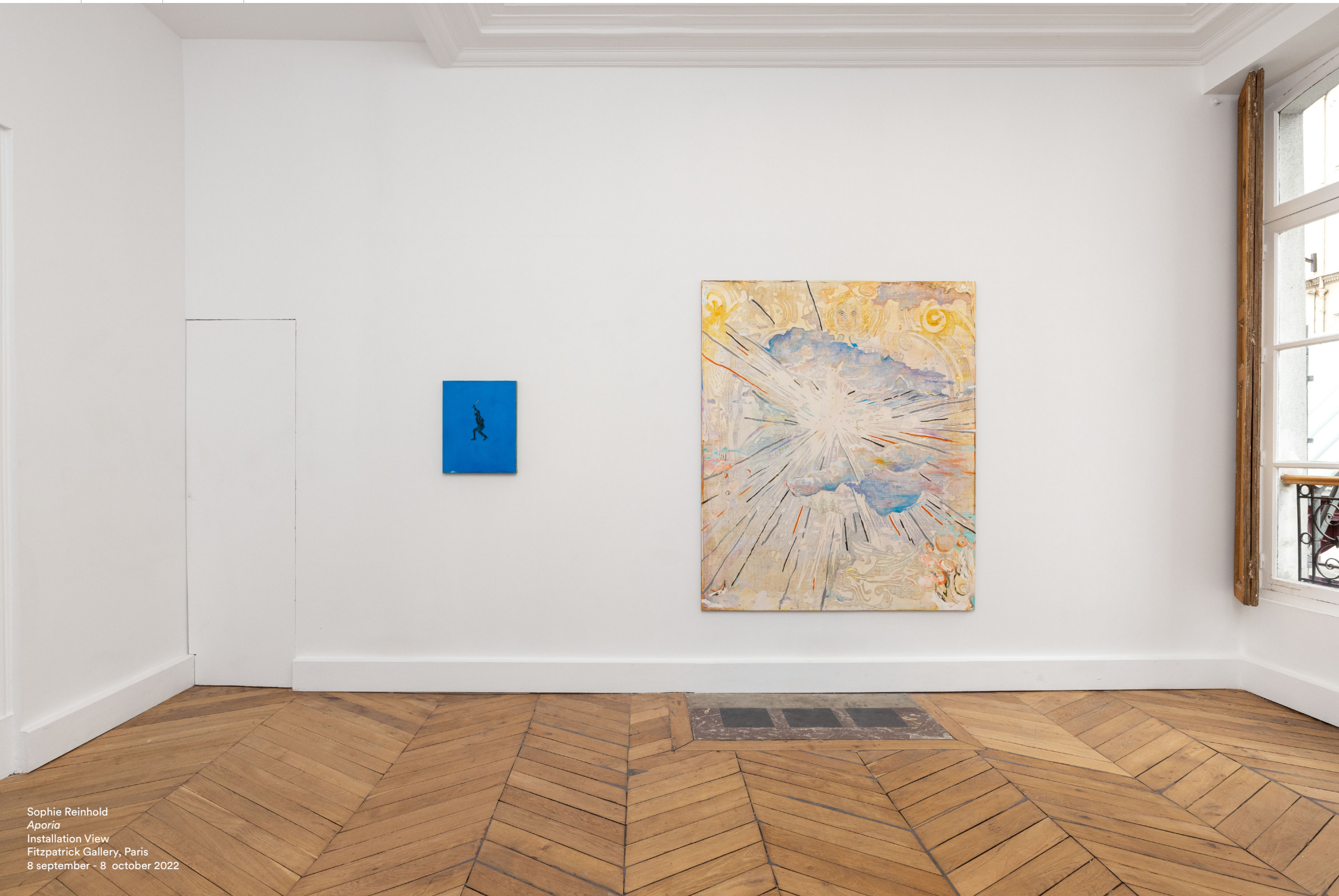
Sophie Reinhold Aporia Installation View Fitzpatrick Gallery, Paris 8 september - 8 october 2022