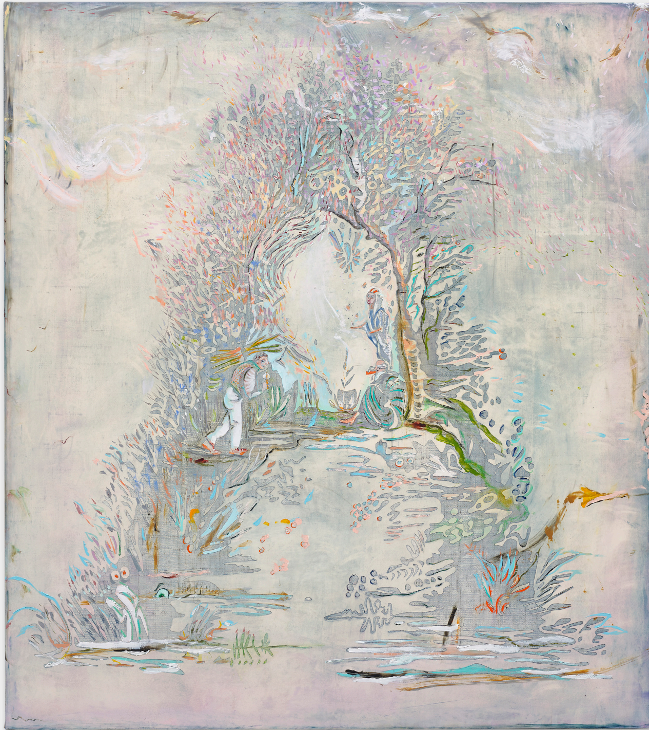
Sophie Reinhold APORIA (A) , 2022

Oil on marble powder on jute 140 x 125 cm 55 1/8 x 49 1/4 in