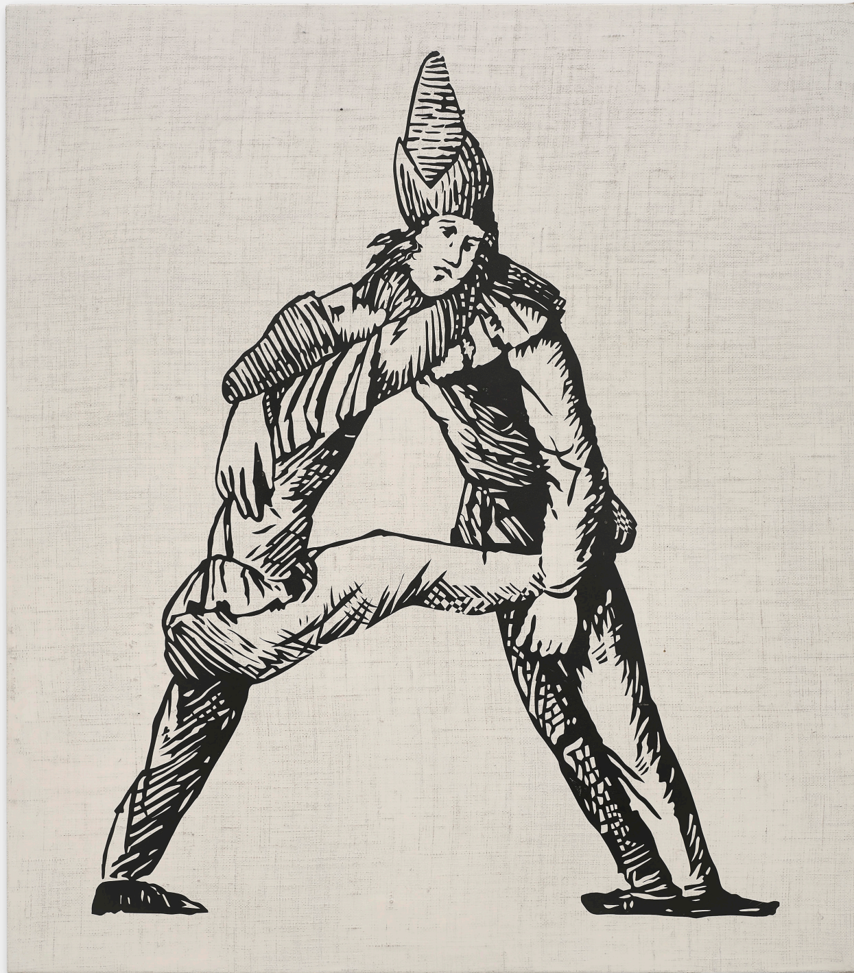
Sophie Reinhold APORIA (A) , 2022

Graphite on marble powder on jute 140 x 125 cm 55 1/8 x 49 1/4 in