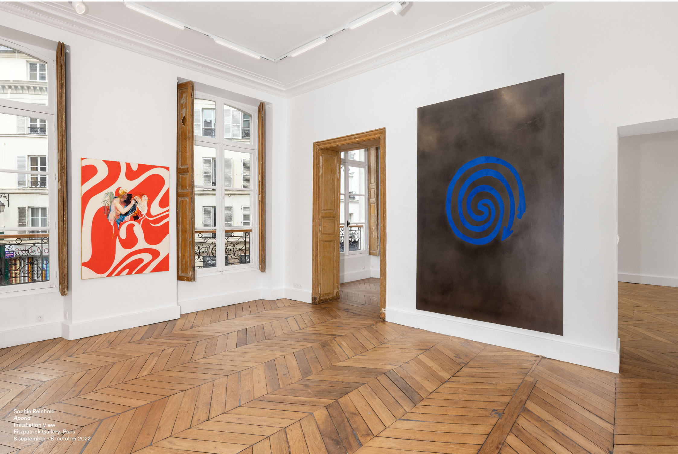
Sophie Reinhold Aporia Installation View Fitzpatrick Gallery, Paris 8 september - 8 october 2022