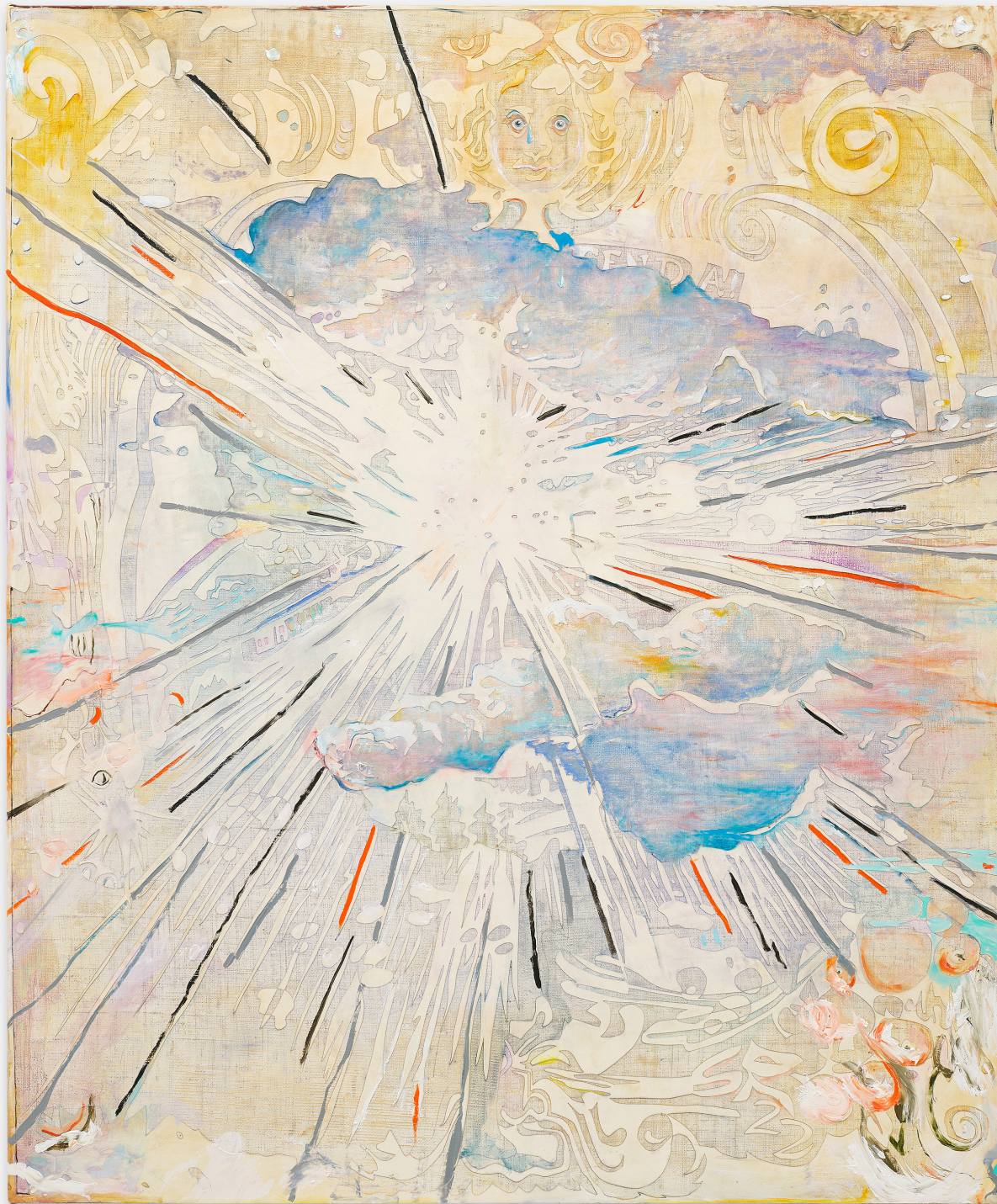
Sophie Reinhold Irresolvable Conflict of a Logical Expression , 2022

Oil on marble powder on jute 180 x 150 cm 70 7/8 x 59 in