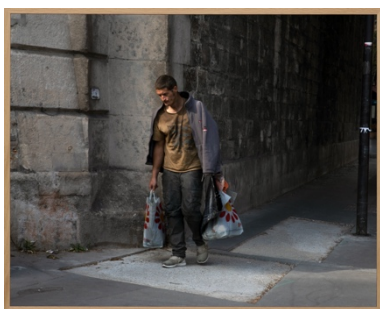
09. Anna Malagrida, Balard, 5 , 2020–2021, Digital print on Hahnemühle cotton paper, mounted on aluminum, 80,2 x 102,2 cm (framed), Edition of 3