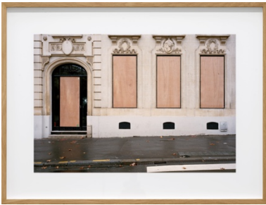
12. Anna Malagrida, 17, avenue de Friedland , 2018–2019, Digital print on Hahnemühle cotton paper, mounted on aluminum, 49,6 x 65,6 cm (framed), Edition of 6