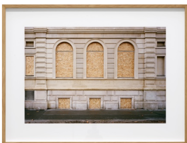
10. Anna Malagrida, 2, avenue Kléber , 2018–2019, Digital print on Hahnemühle cotton paper, mounted on aluminum, 49,6 x 65,6 cm (framed), Edition of 6