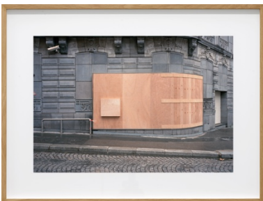
13. Anna Malagrida, 2, rue de Vernet , 2018–2019, Digital print on Hahnemühle cotton paper, mounted on aluminum, 49,6 x 65,6 cm (framed), Edition of 6