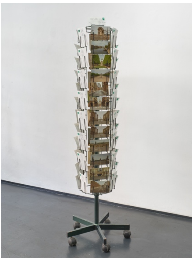
14. Anna Malagrida, Paris confiné II , 2020, 60 postcards, display, 178 x 55 x 55 cm