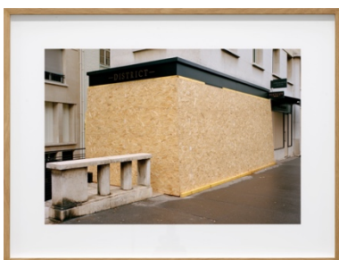
11. Anna Malagrida, Avenue de la Grande Armée, I , 2018–2019, Digital print on Hahnemühle cotton paper, mounted on aluminum, 49,6 x 65,6 cm (framed), Edition of 6