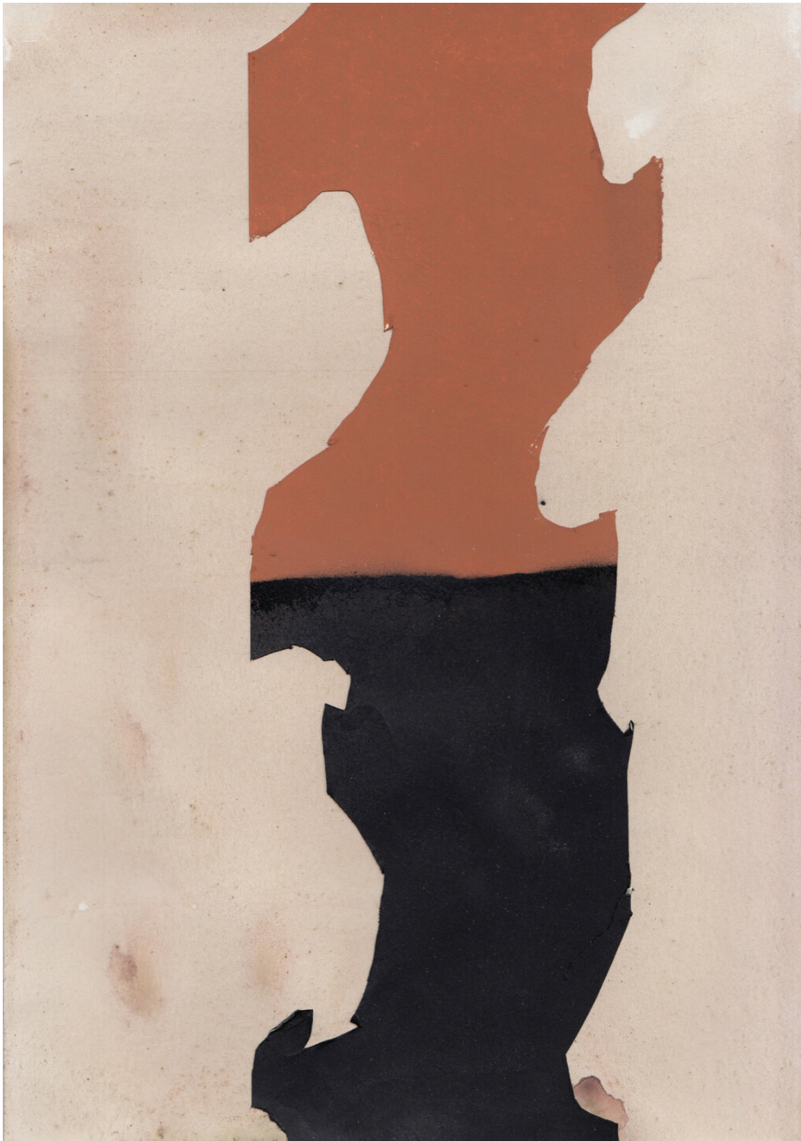
Mikołaj Moskal Untitled, 2022 collage on paper, acrylic, pencil 21 × 29 cm (8 1/4 × 11 3/8 in)