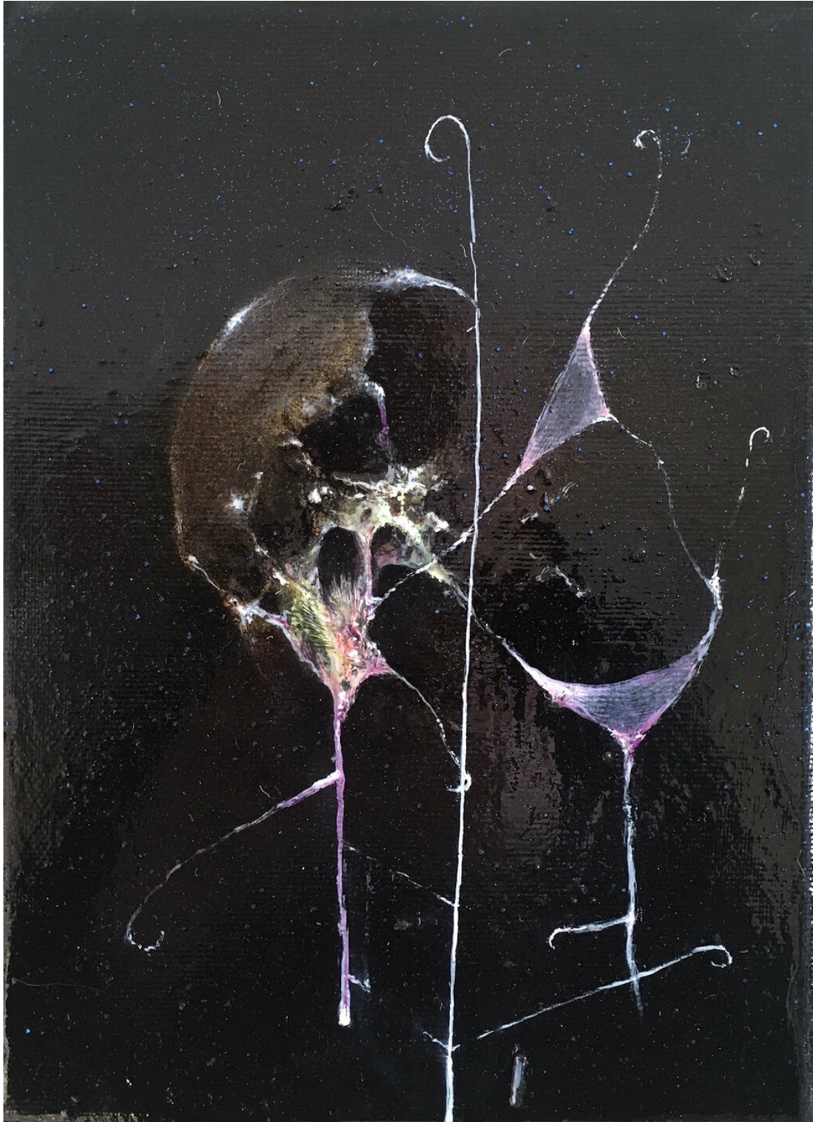
Piotr Janas Untitled, 2019 oil on canvas 24 × 18 cm (9 1/2 × 7 1/8 in)