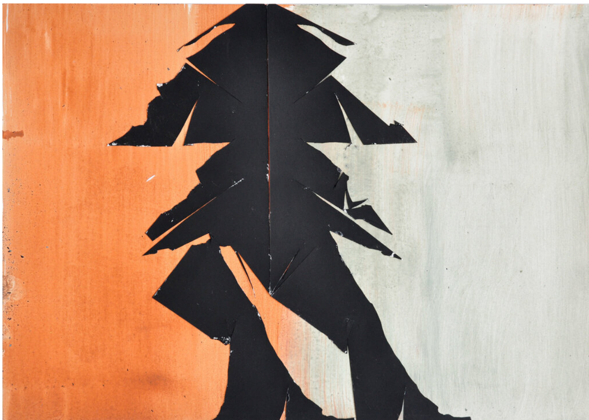
Mikołaj Moskal Untitled, 2022 collage on paper, acrylic, pencil 29 × 42 cm (11 3/8 × 16 1/2 in)