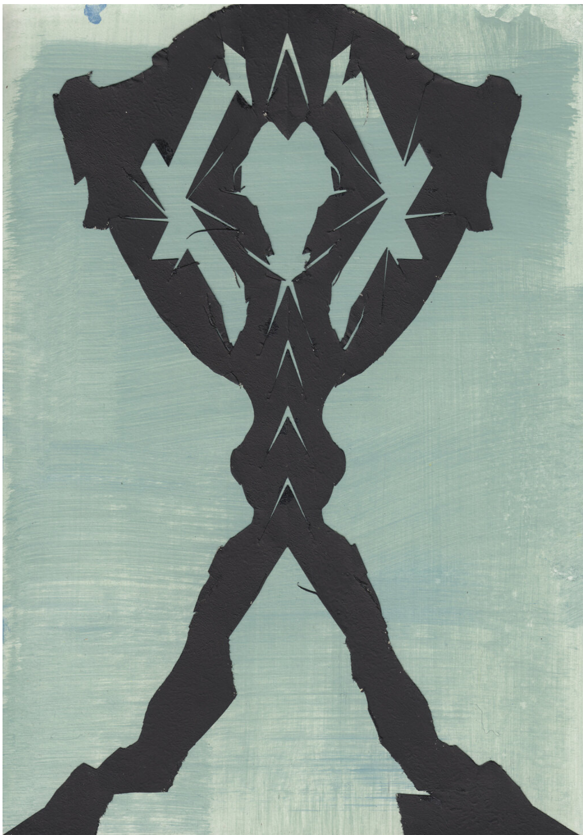
Mikołaj Moskal Untitled, 2020 collage on paper, acrylic, pencil 21 × 29 cm (8 1/4 × 11 3/8 in)