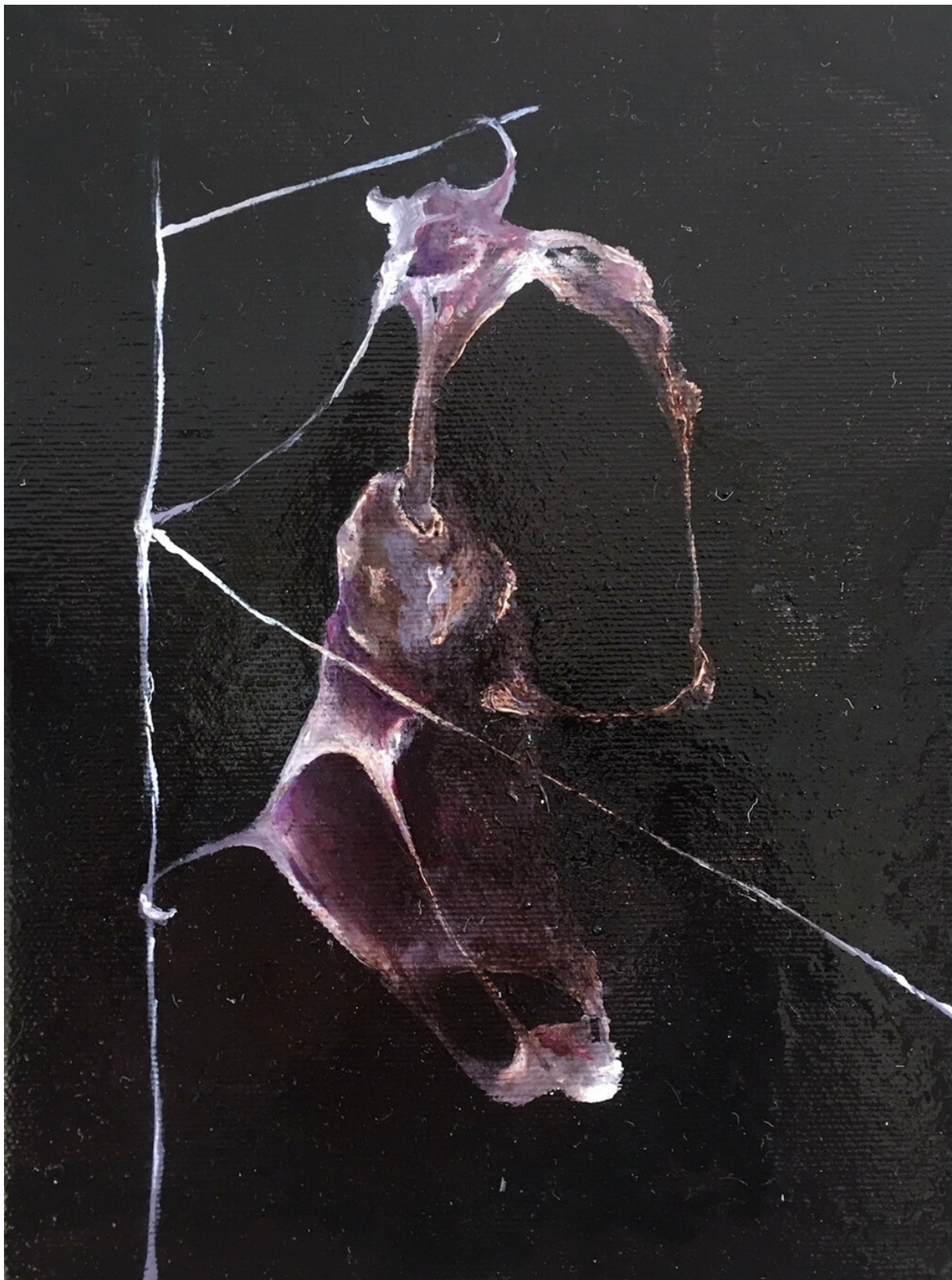
Piotr Janas Untitled, 2019 oil on canvas 24 × 18 cm (9 1/2 × 7 1/8 in)