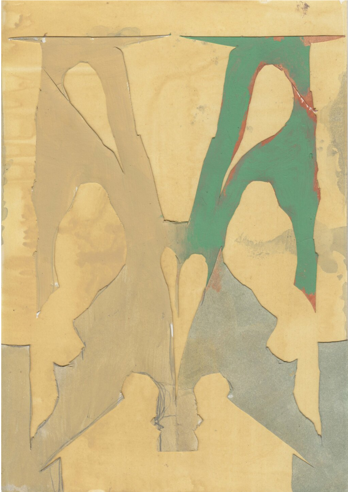
Mikołaj Moskal Untitled, 2022 collage on paper, acrylic, pencil 21 x 29 cm (8 1/4 x 11 3/8 in)