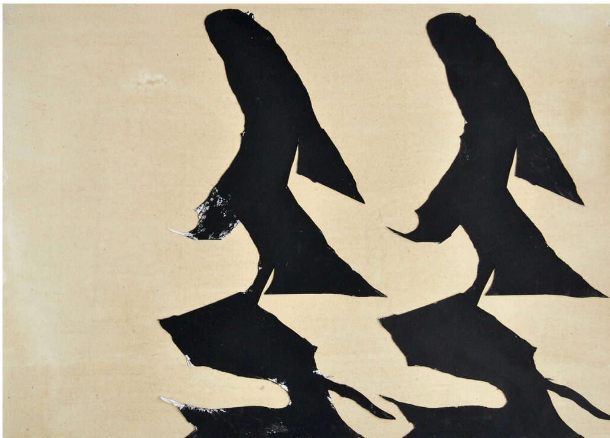
Mikołaj Moskal Untitled, 2022 collage on paper, acrylic, pencil 29 × 42 cm (11 3/8 × 16 1/2 in)