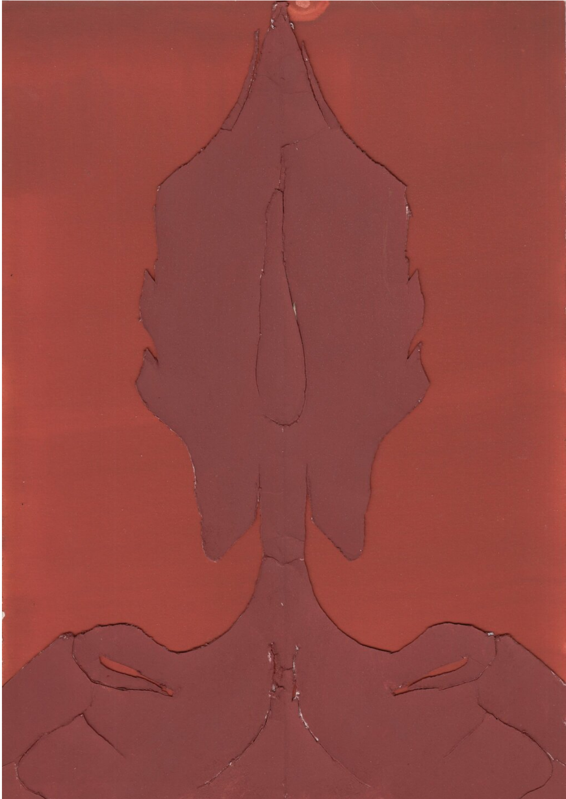
Mikołaj Moskal Untitled, 2022 collage on paper, acrylic, pencil 21 × 29 cm (8 1/4 × 11 3/8 in)