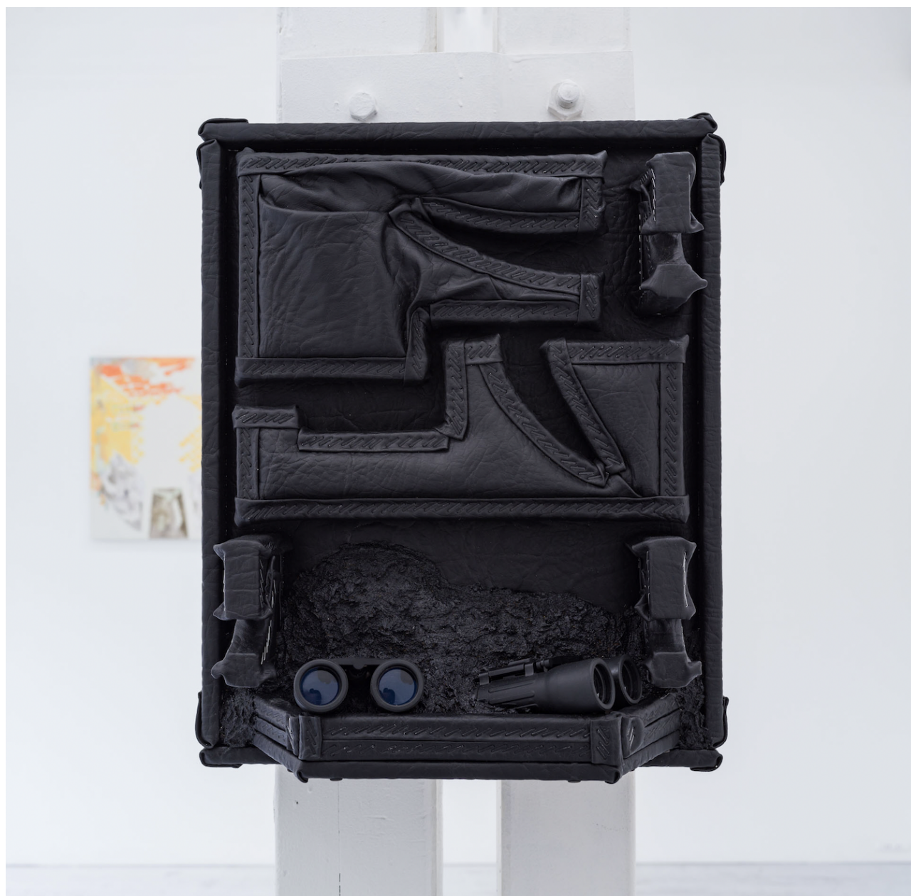
Cezary Poniatowski Sick-box, 2022 faux leather, upholstery foam, staples, wood, binoculars, sand, resin 44 x 36 x 14 cm (17 5/16 x 14 3/16 x 5 1/2 in)