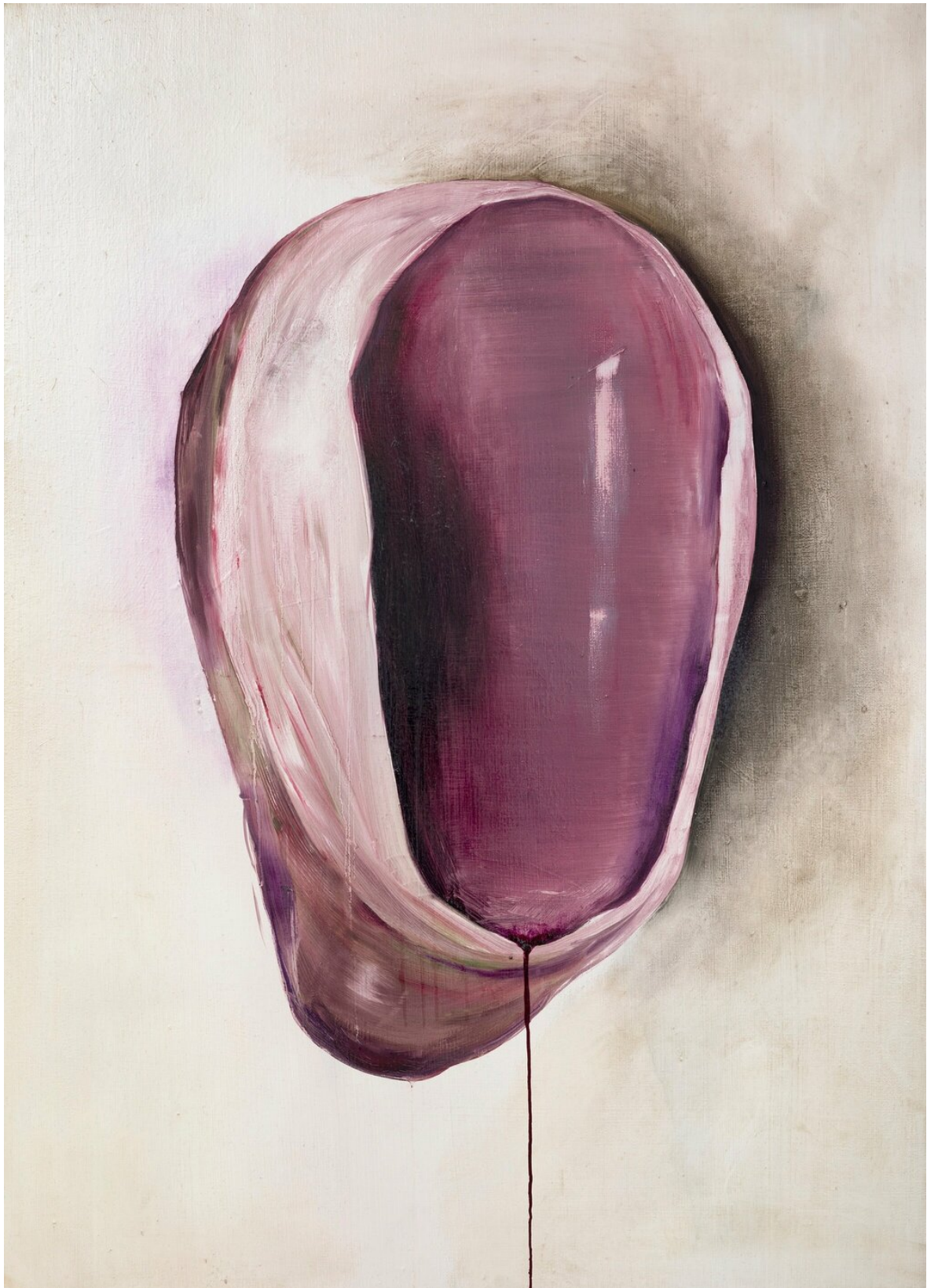
Piotr Janas Untitled, 2019 oil on canvas 96 × 69 cm (37 3/4 × 27 1/8 in)