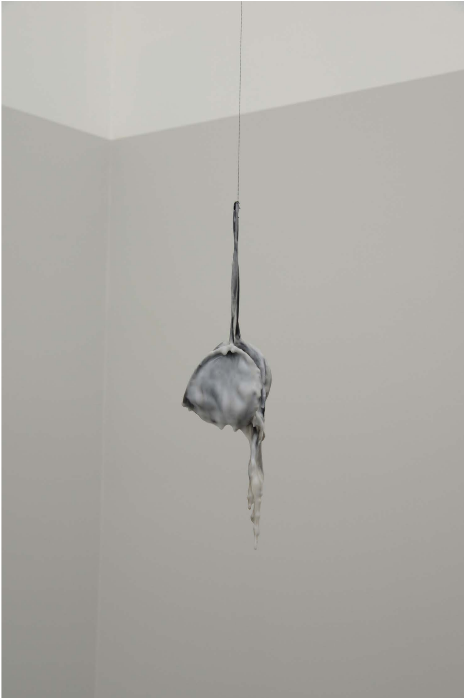
Charbel-joseph H. Boutros, Night Cartography #3 , 2017 airplane sleeping mask, votive candle wax, dreams, wishes (ongoing series) courtesy the artist and Grey Noise, Dubai – photo: Benoît Mauras