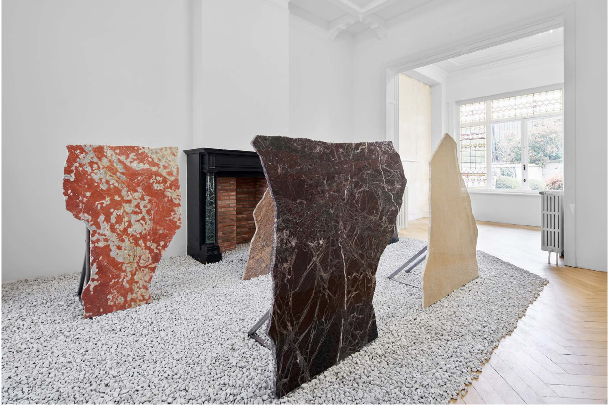
Charbel-joseph H. Boutros, Life variation #3, the marble the ring and the continents , 2022 5 stele from Brazil, Lebanon, France, Belgium and Greece, pieces of a broken ring, gravel, metal structure, displacement, love, hopes, exhibition courtesy the artist and Jaqueline Martins Gallery, São Paulo and Brussels