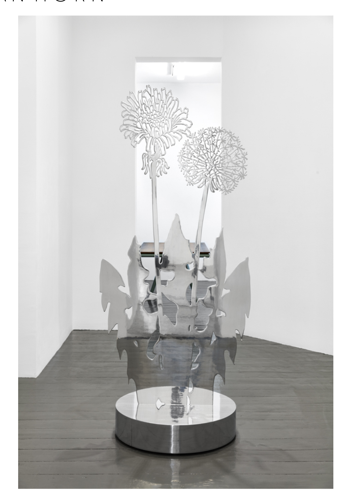
MOR_025_VH Paul Morrison Rhizotron, 2022 Polished stainless steel H. 200 x 94 x 75 cm Ed. 5