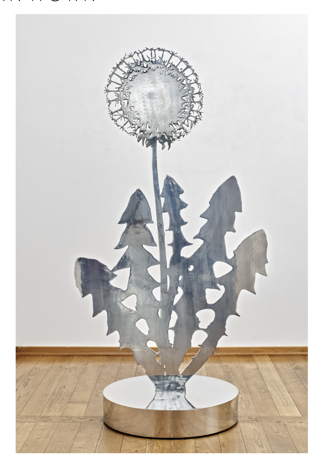
MOR_028_VH Paul Morrison Mericarp, 2022 6 mm mirrorpolished stainless steel H. 217 x 114 (incl. base) Ed. 5 installation view Knust Kunz, Munich