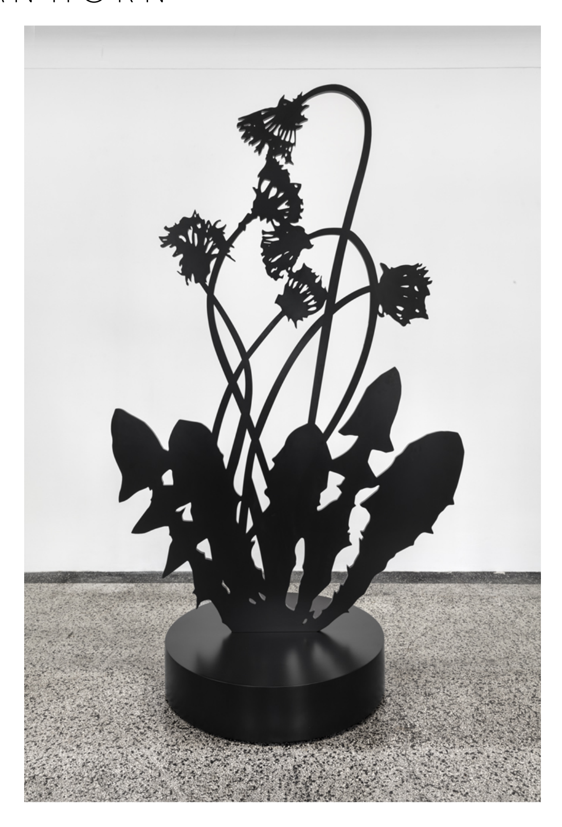
MOR_024_VH Paul Morrison Mystacidium, 2022 Powder-coated aluminum H. 235 x 151 x 90 cm Ed. 5 courtesy VAN HORN, Düsseldorf