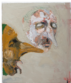
Monsieur and Chopin, 2022 oil on stitched linen and cotton canvas 13 3/4 x 11 3/4 in 35 x 30 cm