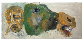
Monsieur and Donkey, 2022 oil on linen 10 x 23 1/2 in 25 x 60 cm