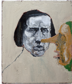
Chopin and Monsieur, 2022 oil on stitched linen canvas 13 3/4 x 11 3/4 in 35 x 30 cm