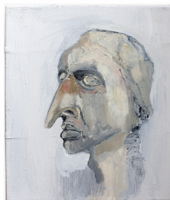
Chopin, 2022 oil on stitched linen and cotton canvas 13 3/4 x 11 3/4 in 35 x 30 cm