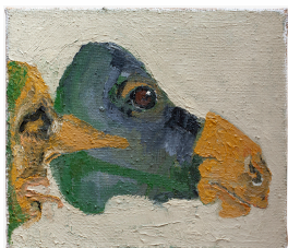
Donkey and Monsieur, 2022 oil on stitched linen and cotton canvas 11 3/4 x 13 3/4 in 30 x 35 cm