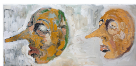
Chopin and Lars Hertervig, 2022 oil on linen 10 x 23 1/2 in 25 x 60 cm