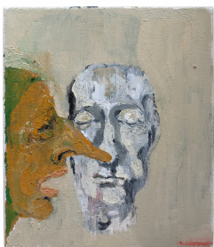
Monsieur and Chopin, 2022 oil on stitched linen and cotton canvas 13 3/4 x 11 3/4 in 35 x 30 cm