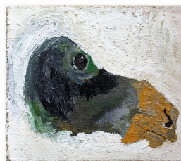
Donkey, 2022 oil on hessian 11 3/4 x 13 3/4 in 30 x 35 cm