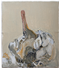
Chopin, 2022 oil on stitched cotton canvas 13 3/4 x 11 3/4 in 35 x 30 cm