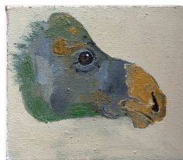
Donkey, 2022 oil on hessian 11 3/4 x 13 3/4 in