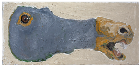
Donkey, 2022 oil on linen 10 x 35 1/2 in 25 x 60 cm