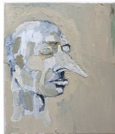
Chopin, 2022 oil on stitched lined and cotton canvas 13 3/4 x 11 3/4 in 35 x 30 cm