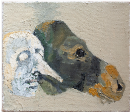
Monsieur and Donkey, 2022 oil on hessian 11 3/4 x 13 3/4 in 30 x 35 cm