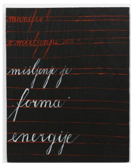
Mangelos Manifest o mišljenju no. 1 / manifesto on thinking no. 1, c.1977–1978, acrylic on wooden board 44.2 x 35 cm