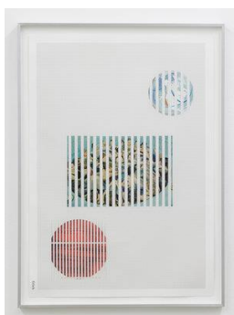
Goshka Macuga Discrete Model 007, 2019 collage 59.4 x 42 cm