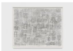
Ciprian Muresan All the Images from the Complete collection catalogue of S.M.A.K. 4, 2019 pencil on paper 150 x 185 cm