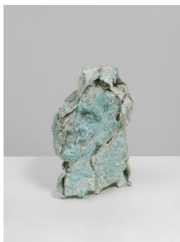
Ciprian Muresan Untitled (Portrait), 2021 epoxy resin 33 x 24 x 14 cm