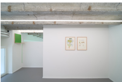
Installation view, Martina Klein, _stehen_, 2019, Kemang Wa Lehulere, Elf, 2020, Courtesy the artists and Galerie Tschudi, Photo: Max Ehrenguber