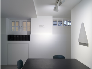
Installation view, Katie Paterson, IDEAS - (The tectonic plates of future earth drawn over its surface), 2021, Alan Charlton, Triangle Painting, 2015, Courtesy the artists and Galerie Tschudi, Photo: Max Ehrenguber