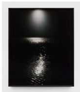
Melanie Schiff Convict Lake , 2022 pigment print 50 x 41 1/2 in (127 x 105.4 cm) Framed: 50 3/4 x 42 1/4 x 2 in (128.9 x 107.3 x 5.1 cm) Ed. 1 of 3 + 2 A.P. MS048