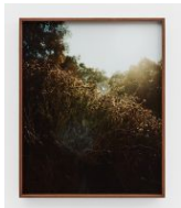
Melanie Schiff Dry Flowers , 2022 pigment print 30 x 24 in (76.2 x 61 cm) Framed: 30 1/2 x 24 3/4 x 2 in (77.5 x 62.9 x 5.1 cm) Ed. 1 of 3 + 2 A.P. MS050