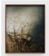
Melanie Schiff On Soto , 2022 pigment print 30 x 24 in (76.2 x 61 cm) Framed: 30 3/4 x 24 3/4 x 2 in (78.1 x 62.9 x 5.1 cm) Ed. 1 of 3 + 2 A.P. MS051