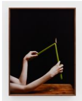
Melanie Schiff Serpentine , 2022 pigment print 40 x 30 in (101.6 x 76.2 cm) Framed: 40 3/4 x 30 3/4 x 2 in (103.5 x 78.1 x 5.1 cm) Ed. 1 of 3 + 2 A.P. MS047