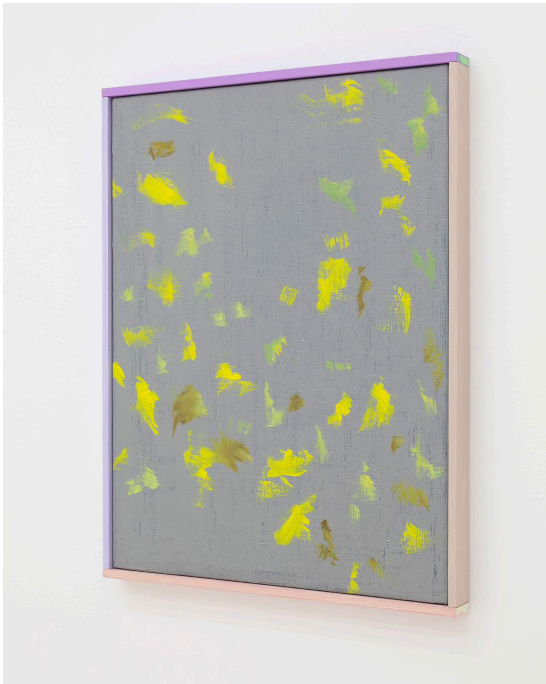
Comedian , 2022.

Oil on canvas board, acrylic, artist frame.