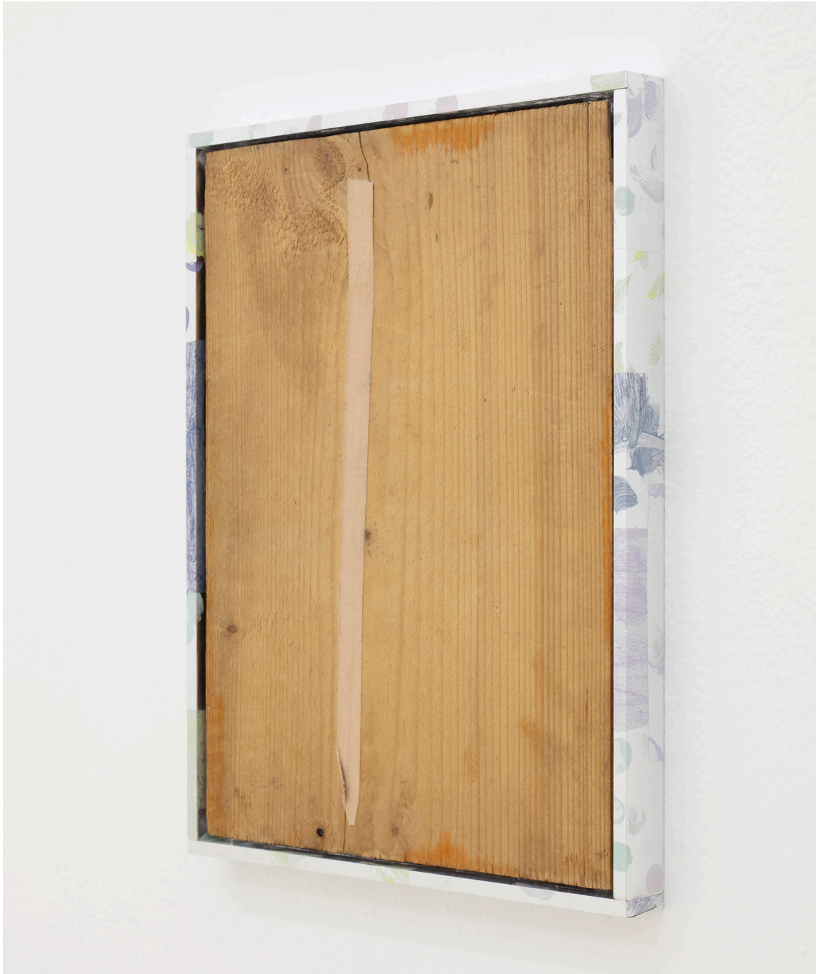
The Kingdom , 2022.

Found wood with plaster, enamel on foil, artist frame.