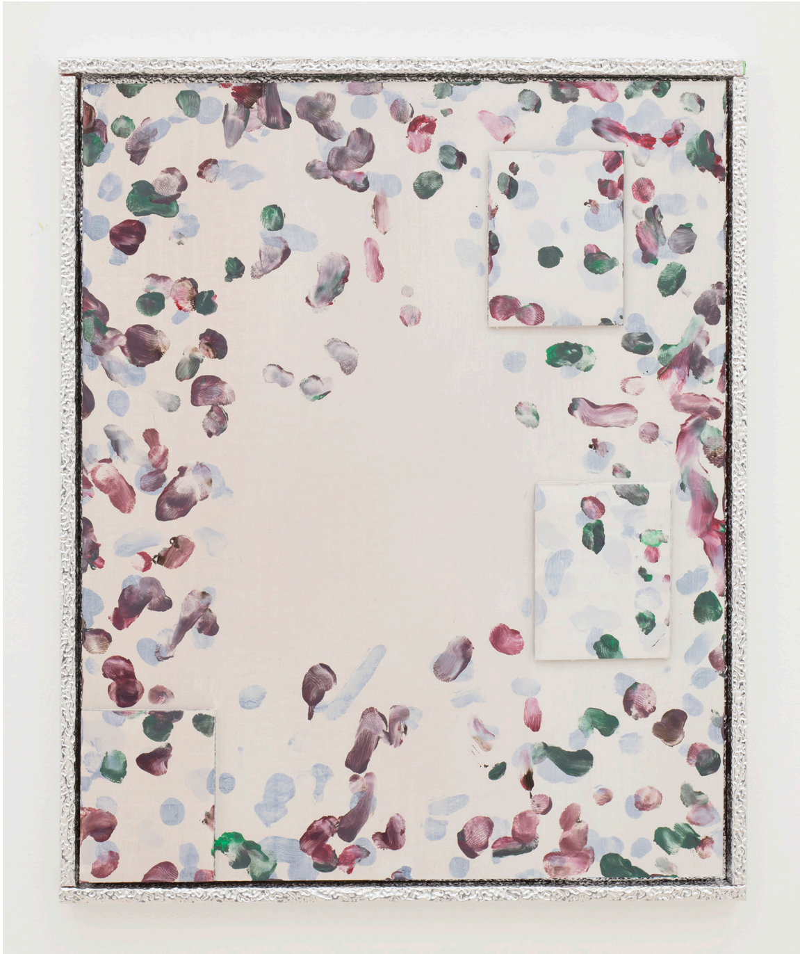
Milk Spill Marble , 2022.

Oil on cardboard, artist frame, wood and aluminium.