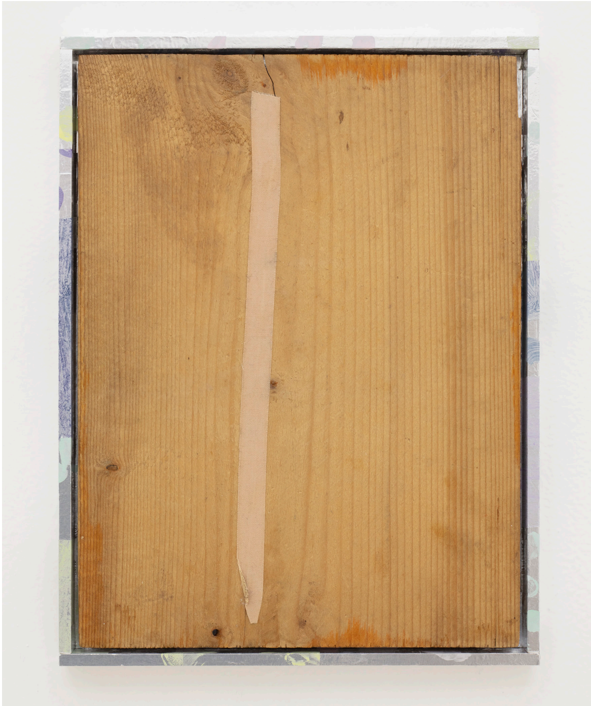
The Kingdom , 2022.

Found wood with plaster, enamel on foil, artist frame.