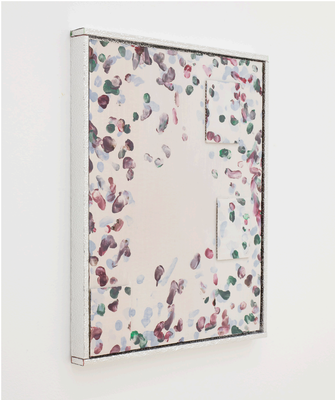
Milk Spill Marble , 2022.

Oil on cardboard, artist frame, wood and aluminium.