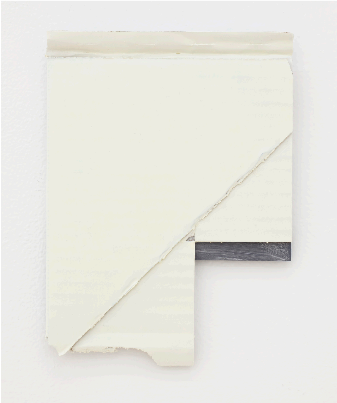
Half Doors, 2022. Oil on cardboard, acrylic on wood, 17.5 x 13.8 x 1 cm ( 6.88 x 5.43 x 0.39 in)