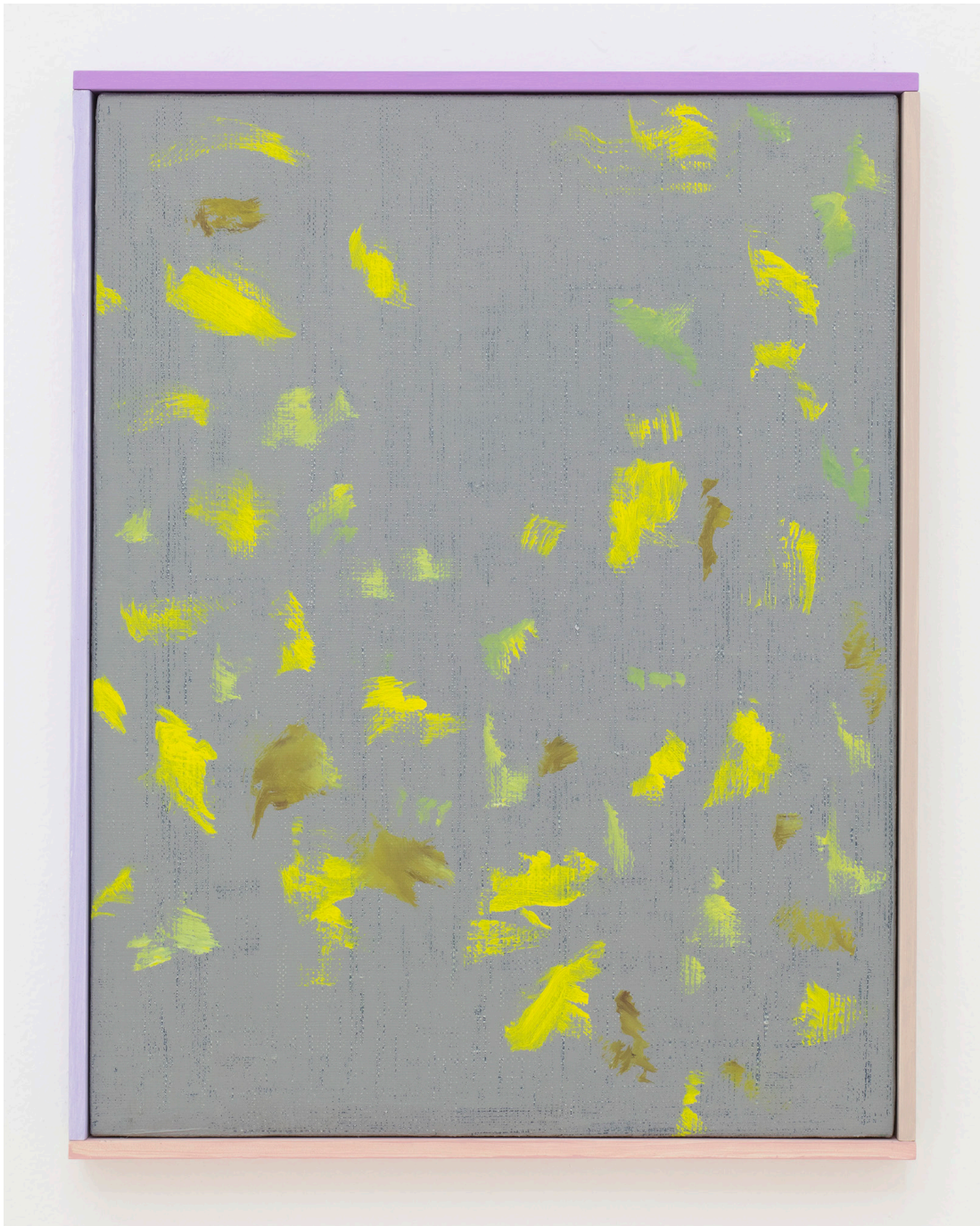
Comedian , 2022. Oil on canvas board, acrylic, artist frame. 31 x 25 x 2 cm (12.2 x 9.84 x 0.78 in).