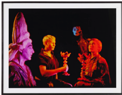
Kenneth Anger Inauguration of the Pleasure Dome , 1954-2014 C-Print 77,5 x 100,5 x 2,8 cm (framed) Edition 1/7 + 2 AP

© Kenneth Anger Courtesy the artist and Sprüth Magers