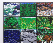
Jack Lawler Genesis, 2022 Oil on canvas 51½ x 62 x 2 in. 130.81 x 157.48 x 5.08 cm. JL0027

No Gallery is an ambiguously commercial art gallery established in 2019, located in the lowest of the Lower East Side, Manhattan. Its programming focuses on work which pushes the boundaries of transgression, working primarily with emerging artists whose practices address the relationship between external and internal experiences in the contemporary cultural landscape as well mid-career artists with a trail of burnt bridges behind them.