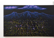
Jack Lawler Bright Lights, Big City, 2022 Oil on canvas 39½ x 64 x 2 in. 100.33 x 162.56 x 5.08 cm. JL0026