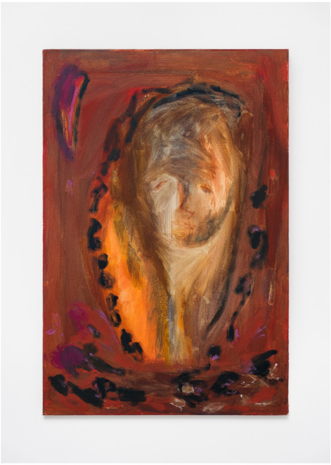
Bas, 2022. Egg tempera and oil on canvas, 35.43 x 23.62 in (90 x 60 cm)