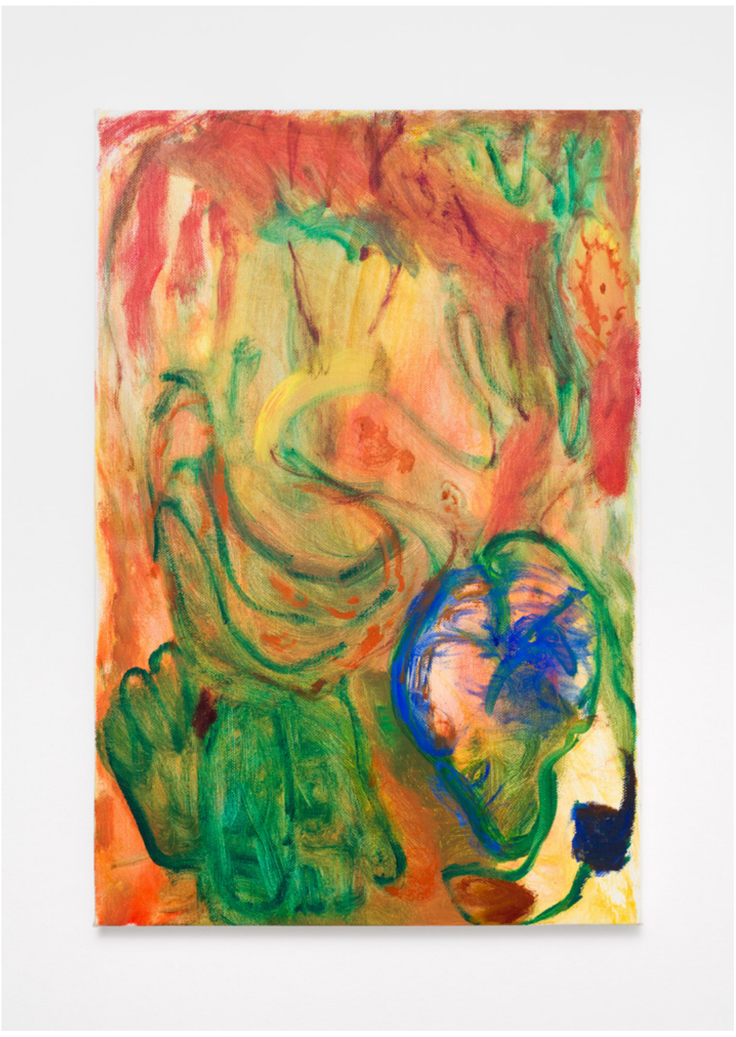
Repainting (the house 2006), 2022. Egg tempera and oil on canvas, 23.62 in x 15.74 in (60 \times 40 \text{ cm})