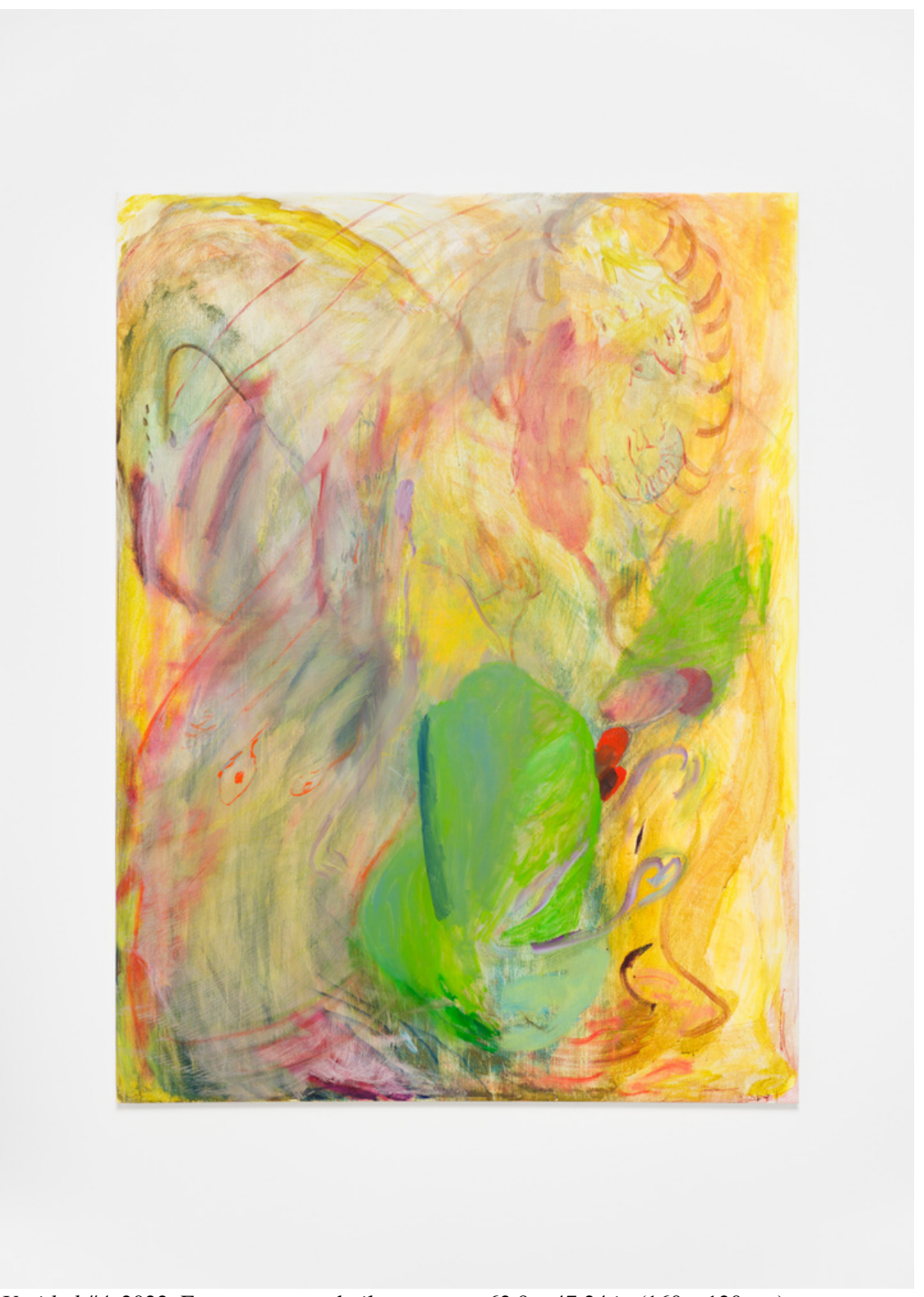
Untitled #4 , 2022. Egg tempera and oil on canvas, 62.9 x 47.24 in (160 x 120 cm)