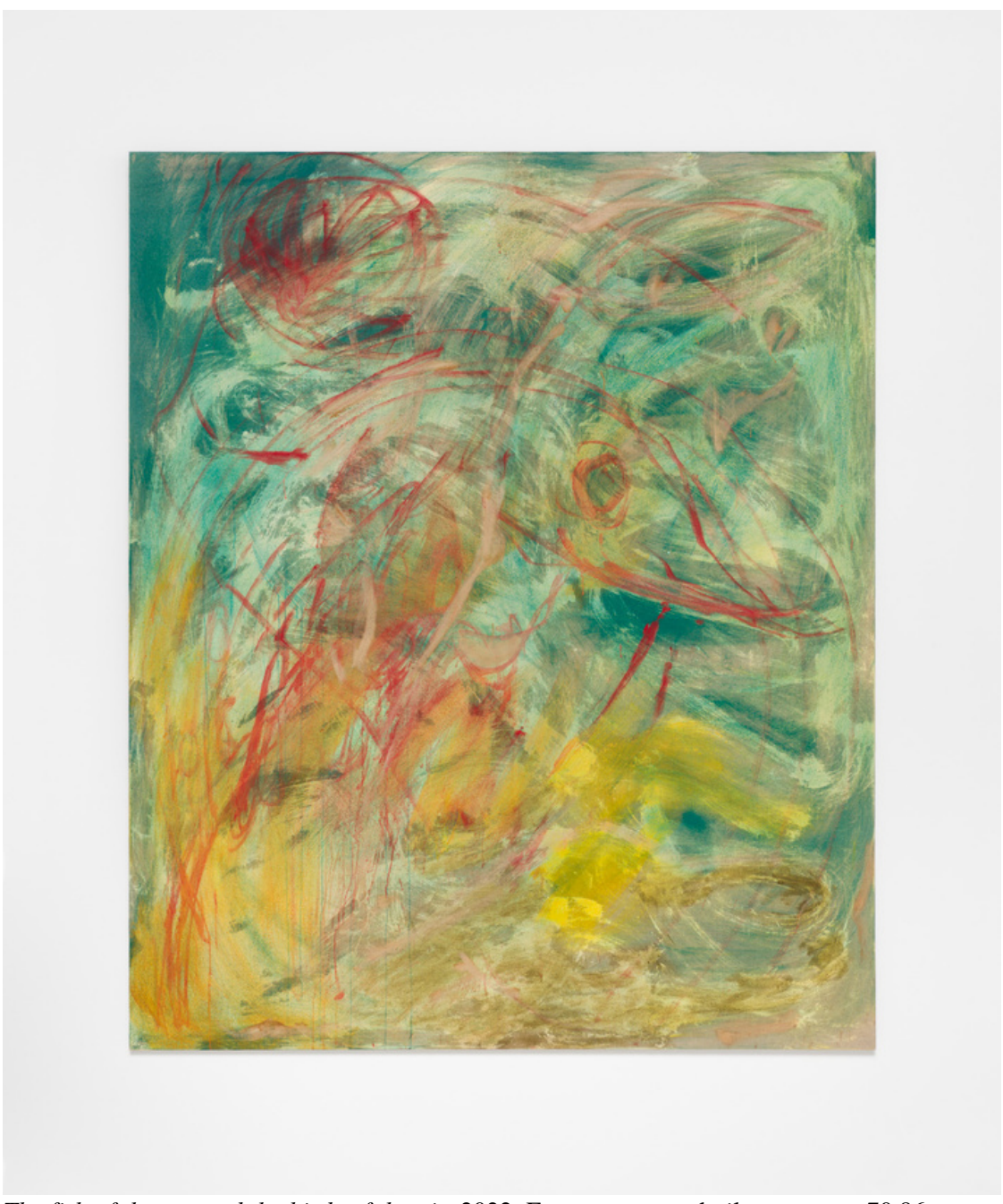
The fish of the sea and the birds of the air, 2022. Egg tempera and oil on canvas, 70.86 x 59.05 in (180 x 150 cm)