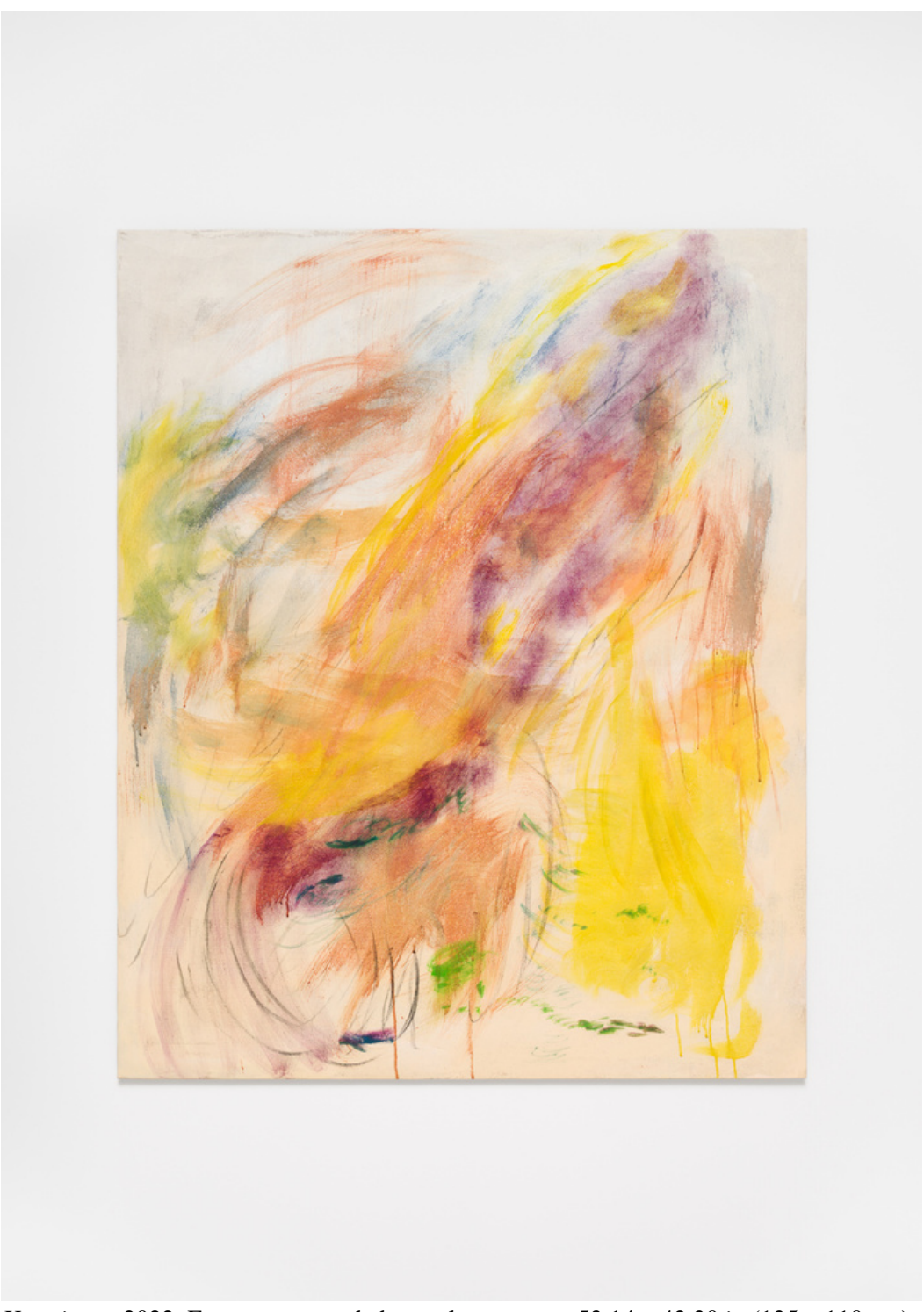
Happiness, 2022. Egg tempera and charcoal on canvas, 53.14 \times 43.30 \text{ in } (135 \times 110 \text{ cm})