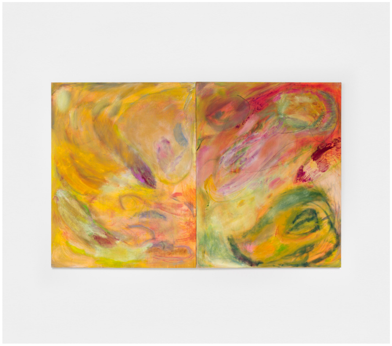
Untitled #1, 2022. Egg tempera, oil and charcoal on canvas, 55.11 x 86.61 in (140 x 220 cm)