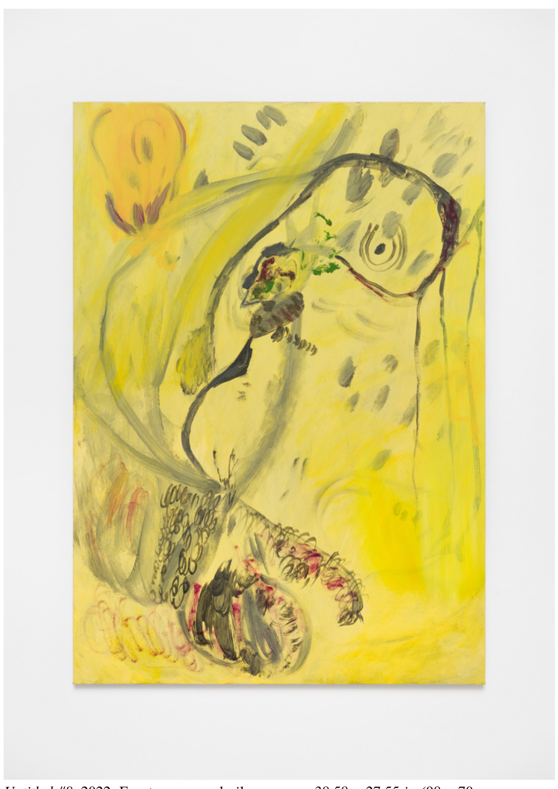
Untitled #8, 2022. Egg tempera and oil on canvas 38.58 \times 27.55 in (98 x 70 cm)