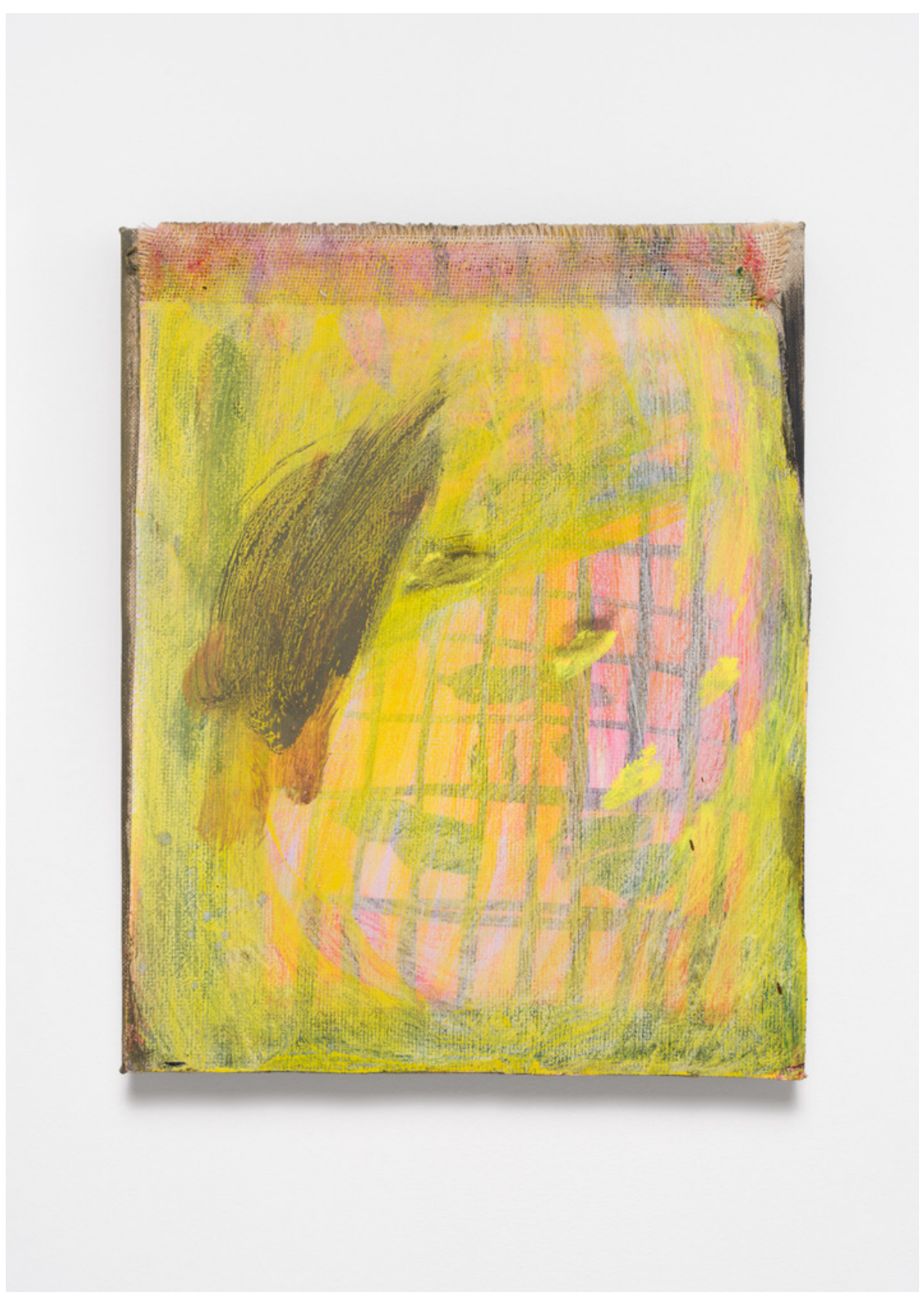
Untitled #11 , 2022. Egg tempera and oil on canvas, 15.35 x 12.29 in (39 x 31 cm)