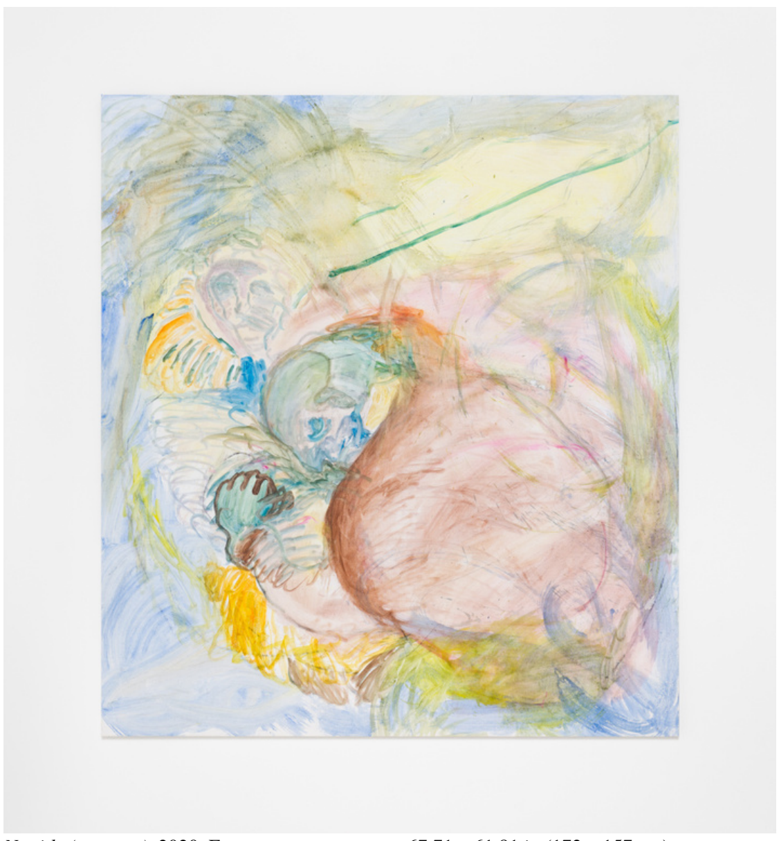
No title (mormor), 2020. Egg tempera on canvas, 67.71 x 61.81 in (172 x 157 cm)