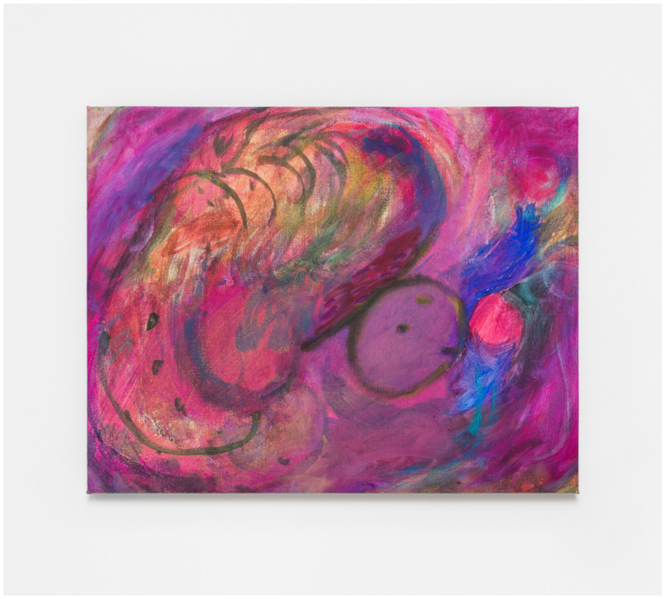
Between, 2021. Egg tempera and oil on canvas, 19.68 x 24.01 in (50 x 61 cm)