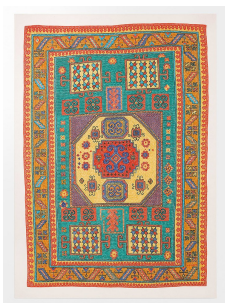
Lupo Borgonovo Õ IV , 2022 felt tip pen on paper 100 × 70 cm