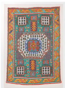
Lupo Borgonovo Ō V , 2022 felt tip pen on paper 100 × 70 cm