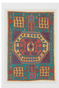
Lupo Borgonovo Ō III , 2022 felt tip pen on paper 100 × 70 cm

Lupo Borgonovo | Volare 3 November–3 December, 2022