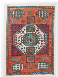
Lupo Borgonovo Õ VI , 2022 felt tip pen on paper 100 × 70 cm