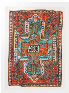
Lupo Borgonovo ō III , 2022 felt tip pen on paper 70 × 50 cm