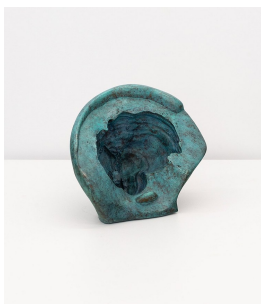
Lupo Borgonovo (, 2022 patinated bronze, unique 33 × 37 × 20 cm