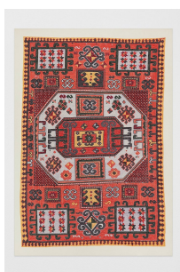
Lupo Borgonovo Õ I , 2022 felt tip pen on paper 100 × 70 cm