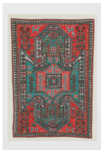
Lupo Borgonovo ō I , 2022 felt tip pen on paper 70 × 50 cm