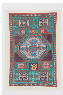
Lupo Borgonovo Ō II , 2022 felt tip pen on paper 100 × 70 cm