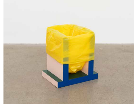
Ludwig Low Table / Bookstand / Side Table, 2 Leg 2021

Laminated MDF, Shown in Hunter/Cobalt/Blush 16 × 12 × 10 In Open Edition