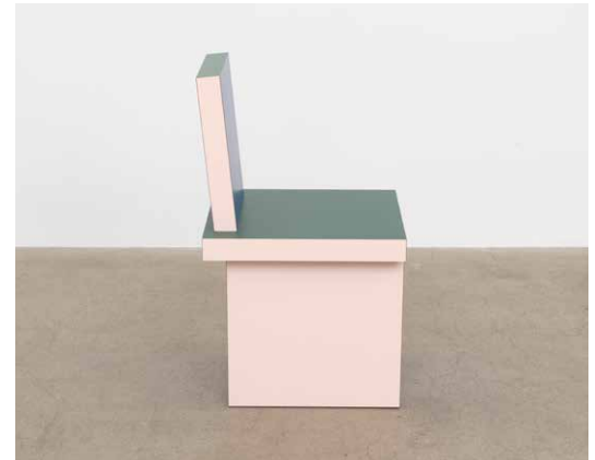
Ludwig Armstool (Kaninchen und Ente) 2021

Laminated MDF, Shown in Hunter/Cobalt/Blush 22 × 26 × 12 In Open Edition