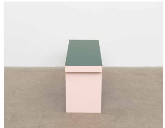
Ludwig Low Table/ Bookstand, 3 Leg 2021

Laminated MDF, Shown in Hunter/Cobalt/Blush 26 × 12 × 10 In Open Edition