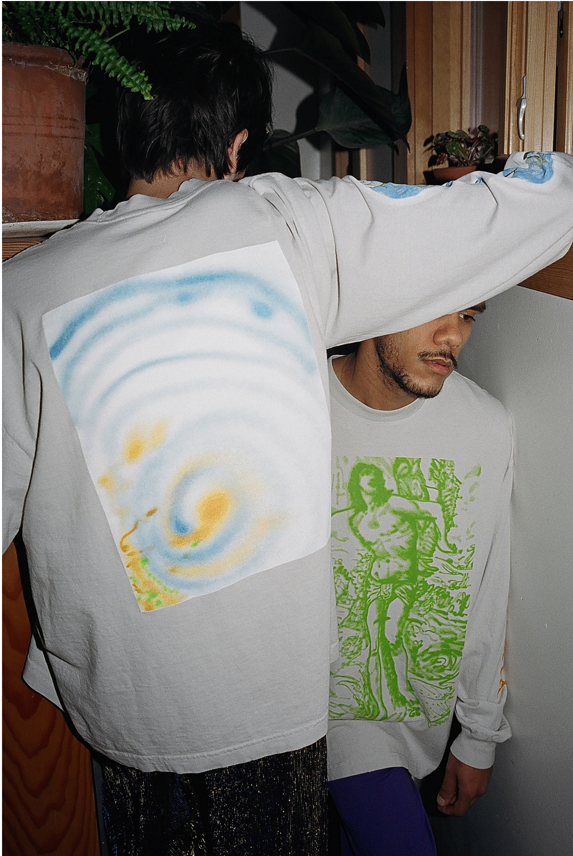
Daniel Long early bird gets the worm but second mouse gets the cheese , 2022 Screen Printed T-Shirt, Edition of 72 $125