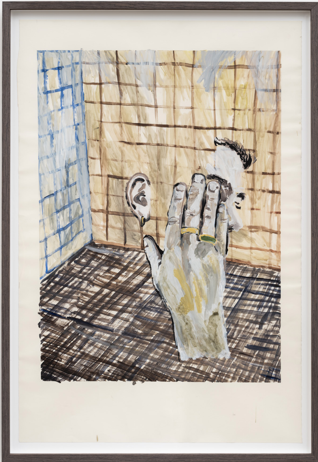
Daniel Long Sweeping , 2020 Acrylic and Flashe on Paper 28 x 42 In Framed