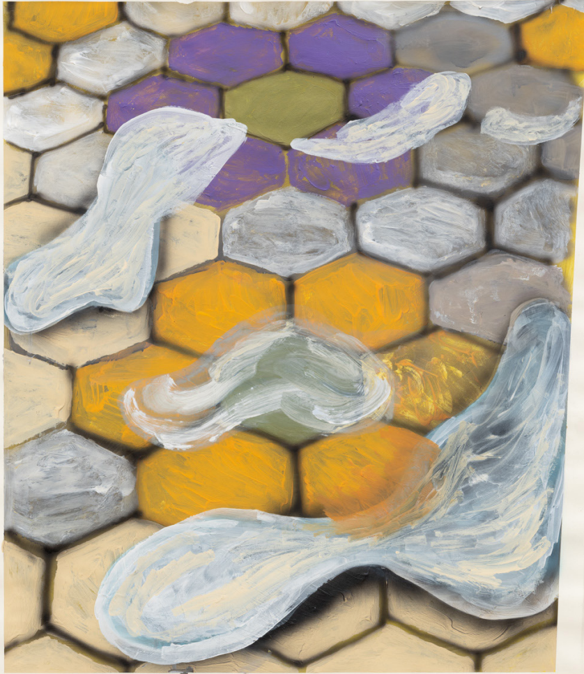
Maren Jensen I Don't Know Why , 2020 Acrylic and Flashe on Paper 30 x 42 In