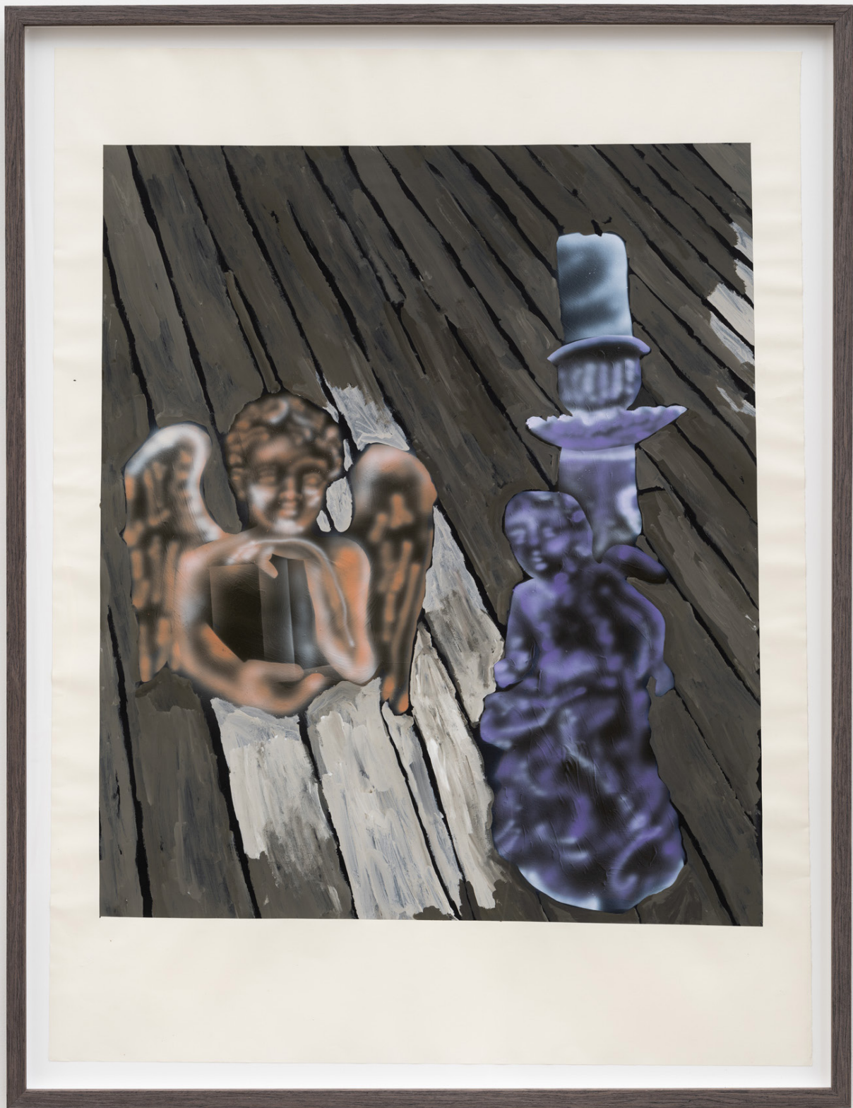
Daniel Long Why You Don't Explain , 2020 Acrylic and Flashe on Paper 31.5 x 42 In Framed