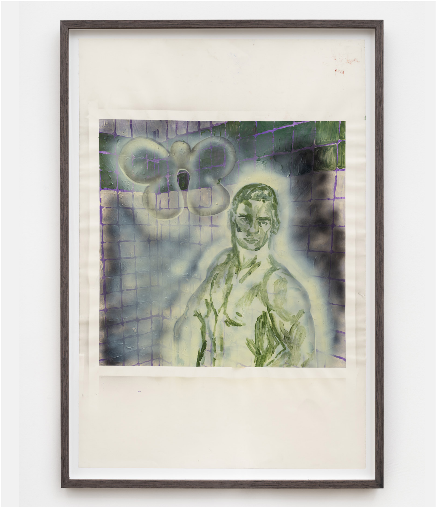
Daniel Long as if they did not have shadows , 2020 Acrylic and Flashe on Paper 27 1/2 x 42 in Framed