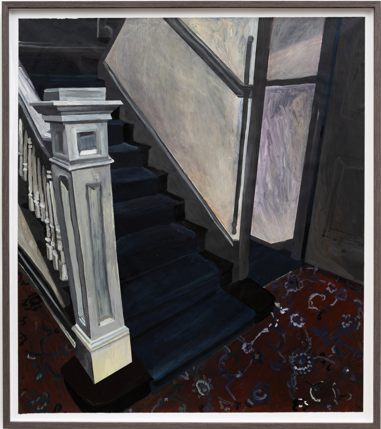
Daniel Long Around from the Next , 2022 Acrylic and Flashe on Paper 42 x 48 In Framed