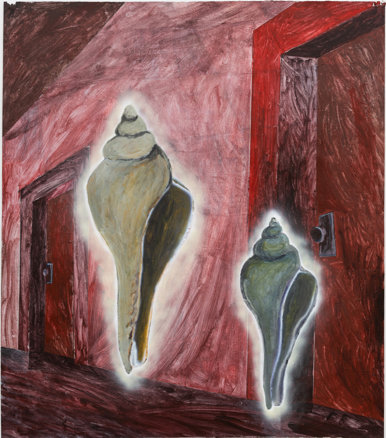
Daniel Long the other said, 'no' , 2021 Acrylic and Flashe on Paper 48 x 42 In