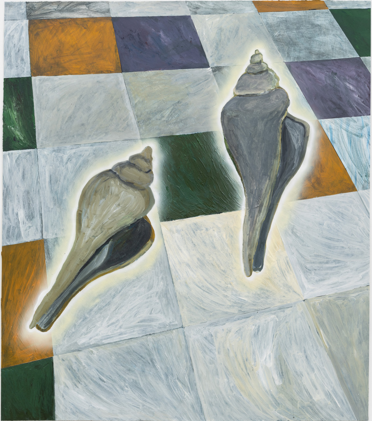
Daniel Long checking up , 2021 Acrylic and Flashe on Paper 48 x 42 In