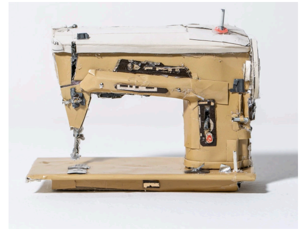
I Can Make You A Pillow 2020 3.5" h x 4.5" w x 1.5" d Scrap materials