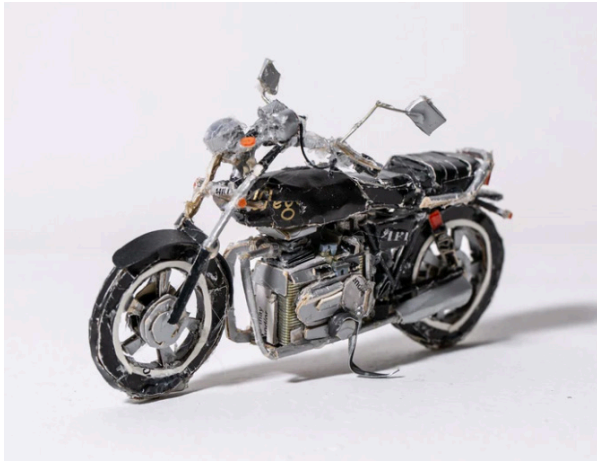
You Need to Wear Pants 2017 3.5" h x 5.5" w x 2" d Scrap materials