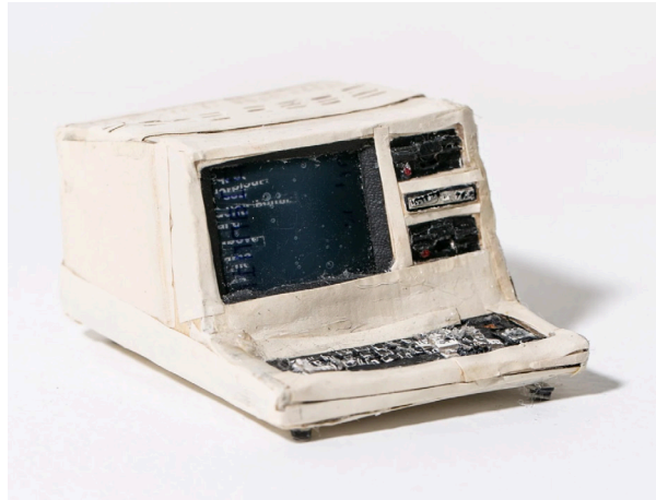
Restart 2020 2" h x 2.5" w x 3" d Scrap materials