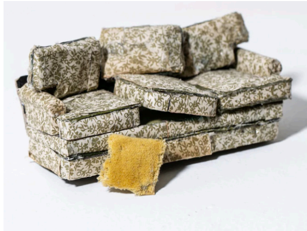
Cushioned 2020 2.5" h x 5" w x 2" d Scrap materials