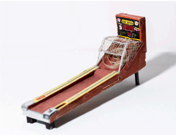
Go Easy 2020 4" h x 8.5" w x 2" d Scrap materials