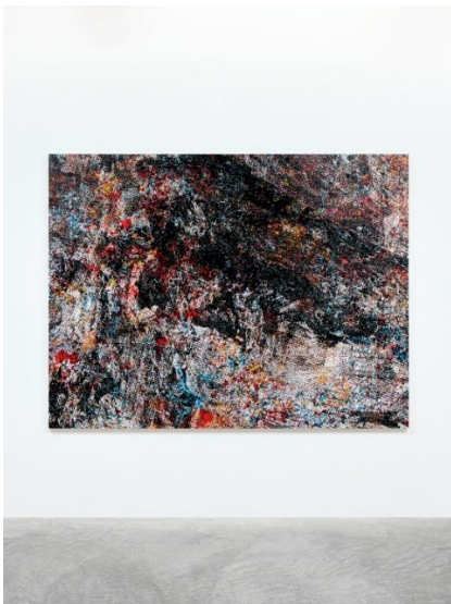
Makoto Saito "Face Landscape 2021_01", 2020-21 Oil on canvas 163 x 215 cm © Makoto Saito

Tue-Sat 12:00-18:00 Closed on Sun, Mon, and National Holidays