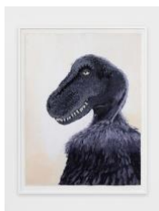
Manuel Solano T-Rex , 2021 Acrylic on canvas 150 x 110 cm (59 1/8 x 43 1/4 in) 162 x 121 x 5 cm (63 3/4 x 47 5/8 x 2 in), framed (CI-MS-0004)