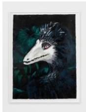
Manuel Solano Siouxsie , 2021 Acrylic on canvas 152 x 111 cm (59 7/8 x 43 3/4 in) 163 x 122 x 5 cm (64 1/8 x 48 x 2 in), framed (CI-MS-0001)