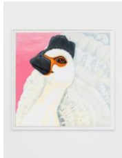
Image © Manuel Solano 2022, courtesy the artist; Carlos/Ishikawa, London; and Peres Projects, Berlin.