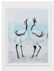
Manuel Solano Cranes 2 , 2021 Acrylic on canvas 151 x 110 cm (59 1/2 x 43 1/4 in) 161 x 121 x 5 cm (63 3/8 x 47 5/8 x 2 in), framed (CI-MS-0003)