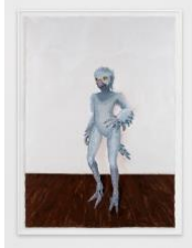
Image © Manuel Solano 2022, courtesy the artist; Carlos/Ishikawa, London; and Peres Projects, Berlin.