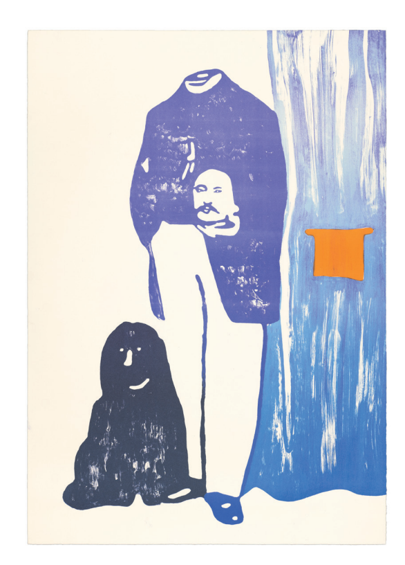
Ulla von Brandenburg, Scène avec ombre & Magicien, 2022 Lithography on BFK Rives, each 100 x 70 cm