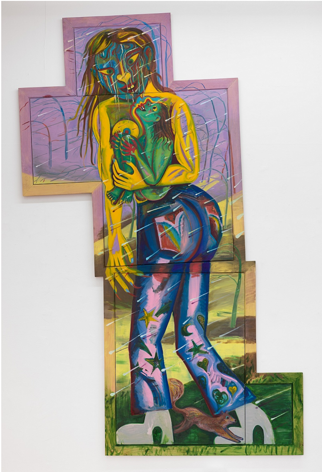
Rainen Knecht Flower Fresh at Springs Edge, 2022 Oil on linen, artist frame 103 1/2h x 54w x 1d in RK_0004