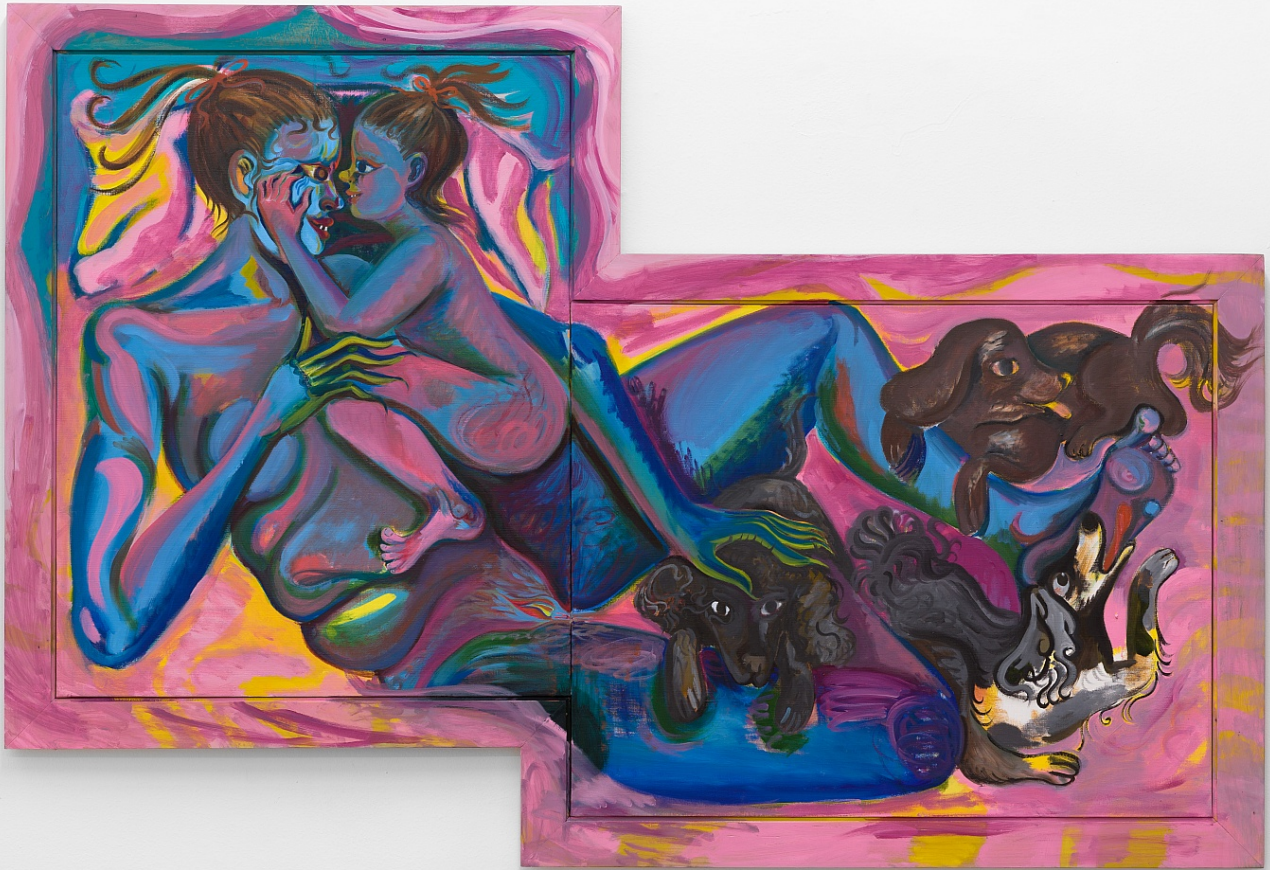
Rainen Knecht La Gimblette's Pets , 2022 Oil on canvas, artist frame 40 1/4h x 59w x 1d in RK_0001