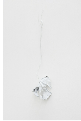
JAKUB CZYSZCZOŃ Untitled, 2022 covered with oil paint and epoxy resin plant debris, natural size