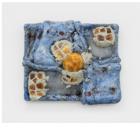
PIOTR BURY ŁAKOMY Blue Bodies Garden / Ogród ciał niebieskich , 2022 aluminum honeycomb, concrete, ostrich egg shells, oil paint, resin approx 46 x 58 cm