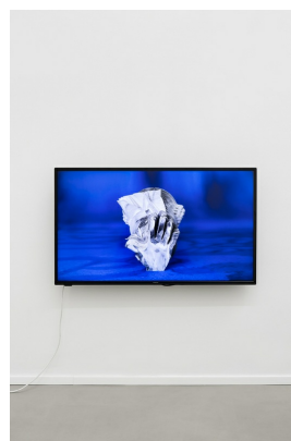
MATEUSZ SADOWSKI Time Settings , 2022 stop-motion animation 4K, 6'22"