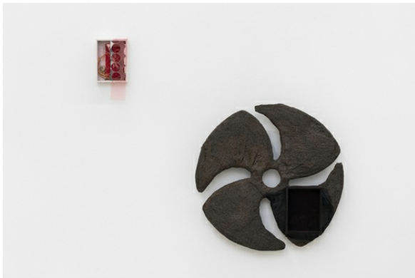
ANIA BAŃK Dirty Seeker, 2022 wooden panels, textiles, iron filings, glue, wax, corduroy, metal, copper cable, grass, snail shells 50 x 50 cm