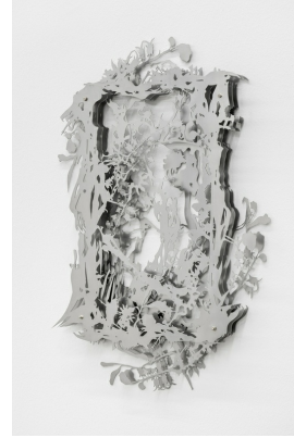
INSIDE JOB Diaphane , 2022 stainless steel, brass 67 x 45 x 5 cm