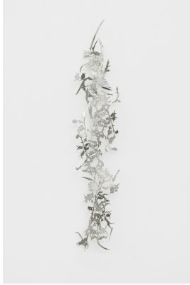
INSIDE JOB Diaphane , 2022 stainless steel, brass 55 x 13 cm