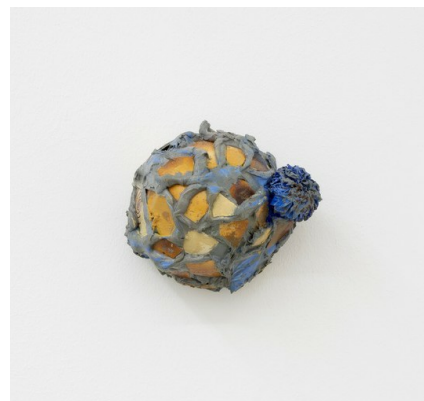
PIOTR BURY ŁAKOMY Planet Garden / Planeta ogród 2022 ostrich egg shells, dried flower, aluminum car putty, oil paint, offset print, resin