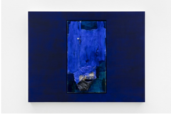
JAKUB CZYSZCZOŃ Untitled, 2022 oil paint, acrylic, plant debris, newsprint clippings, epoxy resin, wood 70 x 90 x 4.5 cm