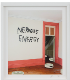
Stine Deja & Richie Culver NERVOUS ENERGY 2022 Digital print on Hahnemühle paper 43,5 x 38 cm Edition of 15 + 5 A.P.