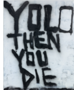
Richie Culver You only live once 2022 Acrylic and lacquer on canvas 220 x 180 cm