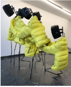
Stine Deja Joint Forces 2022 Various materials 180 x 190 x 145 cm