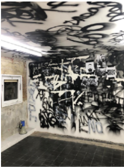
Richie Culver Godwin 2022 In-situ installation Variable dimensions