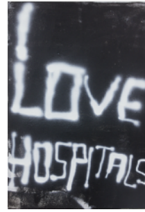
Richie Culver Hospitals 2022 Acrylic and lacquer on canvas 100 x 70 cm