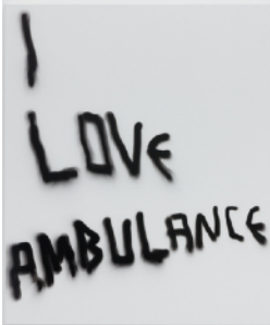
Richie Culver Ambulance 2022 Lacquer on canvas 120 x 100 cm