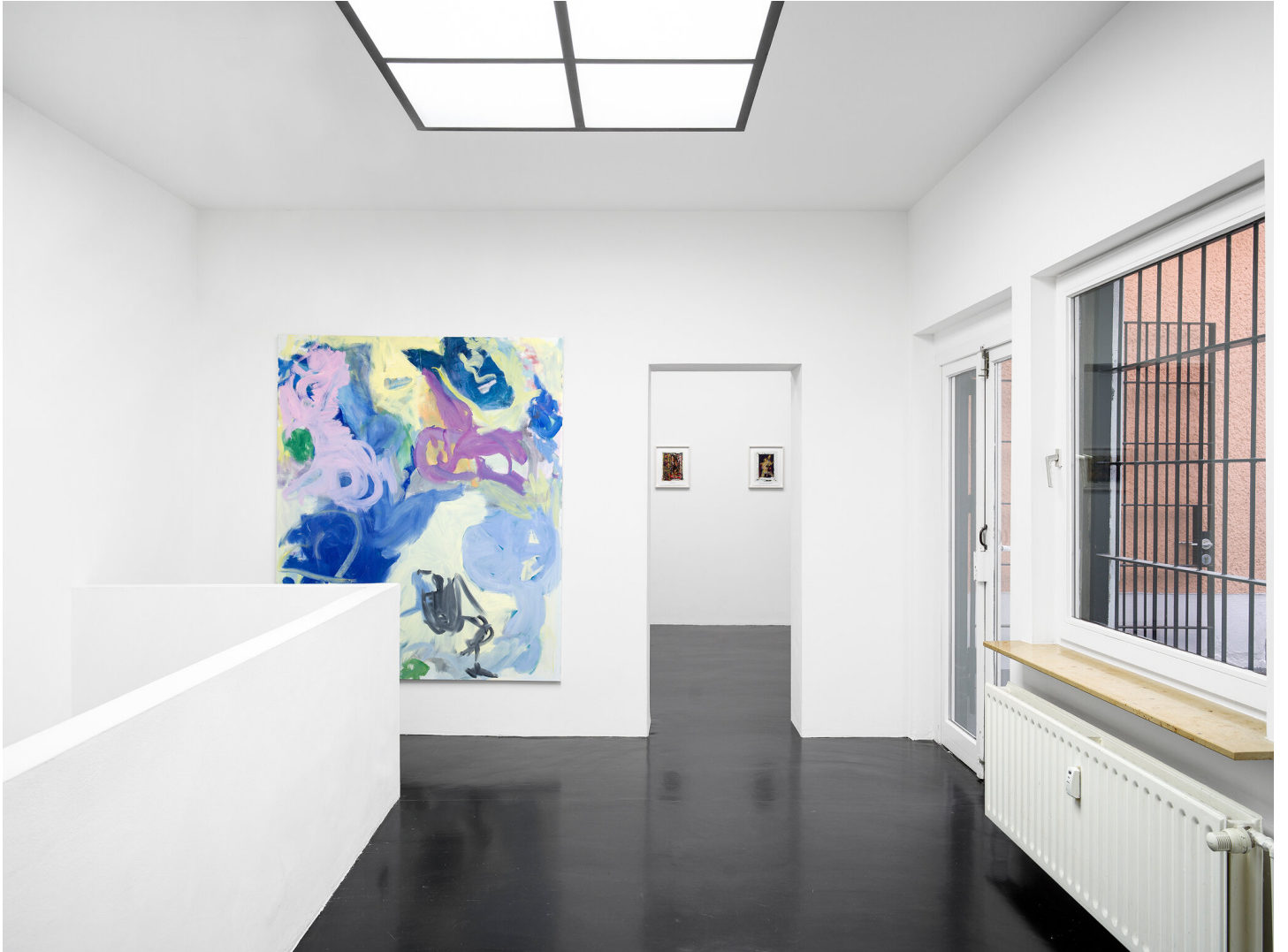
Wait, Where Did I Leave My Keys? November 16, 2022 - January 28, 2023