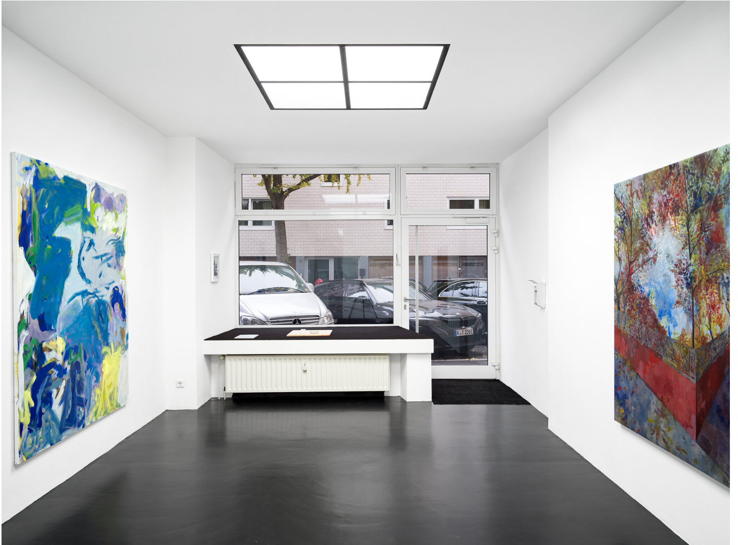
Wait, Where Did I Leave My Keys? November 16, 2022 - January 28, 2023