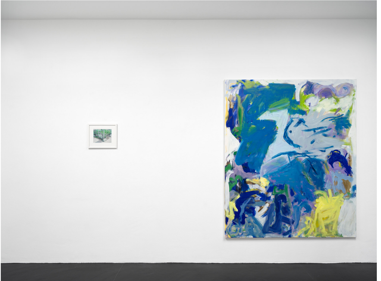
Wait, Where Did I Leave My Keys? November 16, 2022 - January 28, 2023