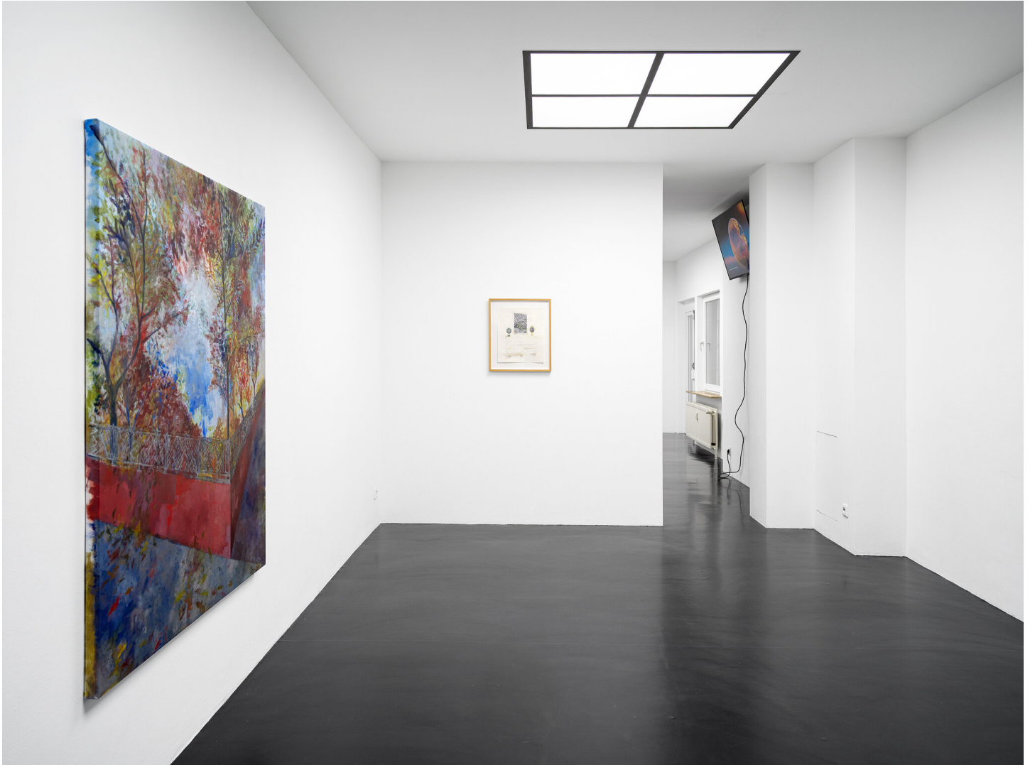
Wait, Where Did I Leave My Keys? November 16, 2022 - January 28, 2023