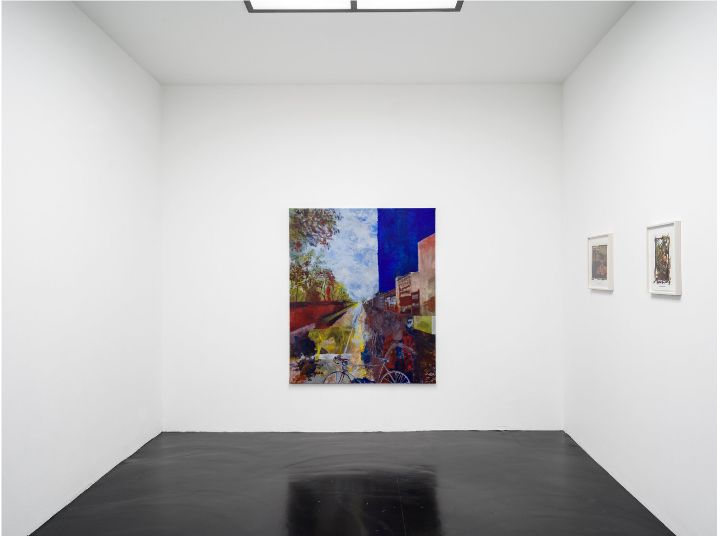
Wait, Where Did I Leave My Keys? November 16, 2022 - January 28, 2023