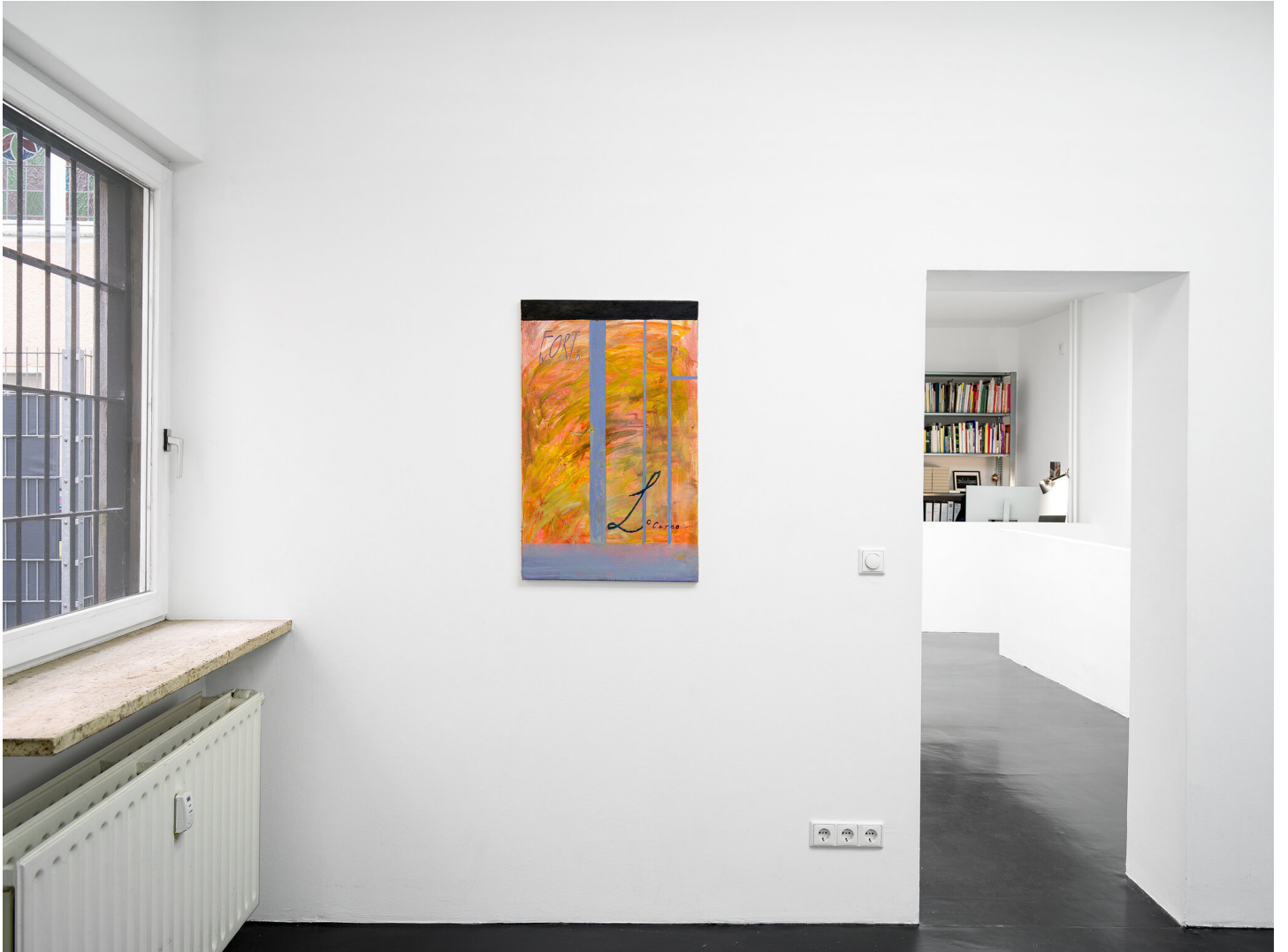
Wait, Where Did I Leave My Keys? November 16, 2022 - January 28, 2023