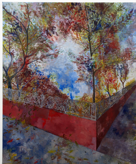
Wait, Where Did I Leave My Keys? November 16, 2022 - January 28, 2023