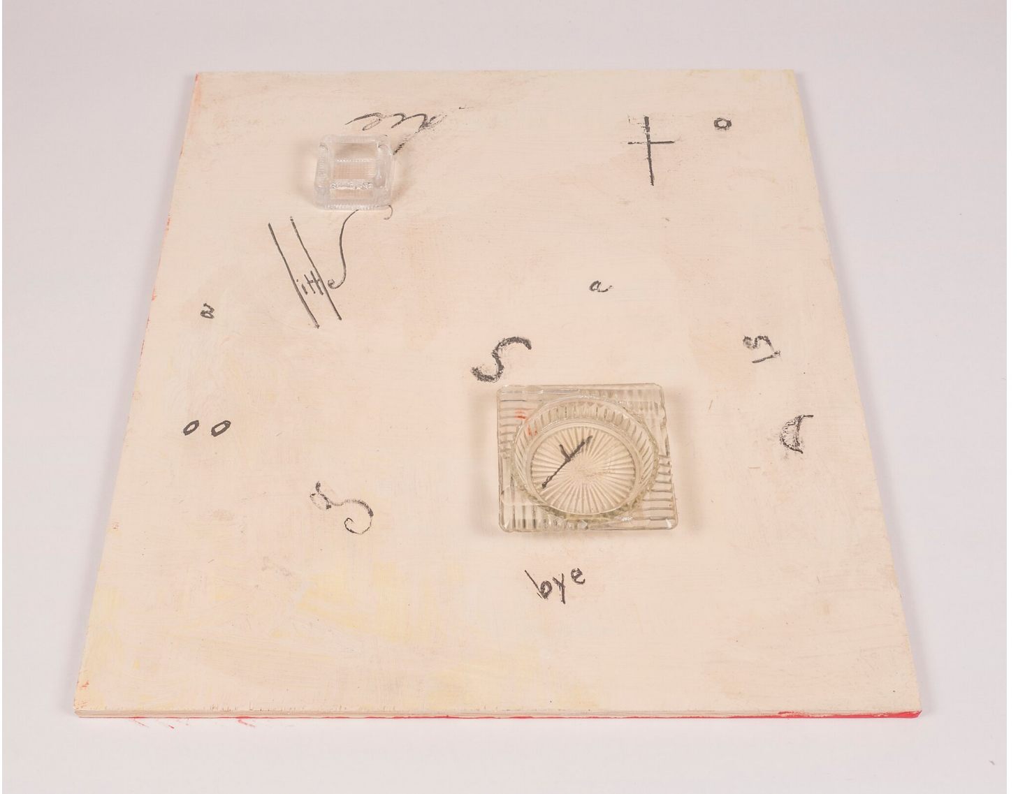
Tam Ochiai To say good bye is to die a little , 2017 Oil and ashtrays on board 48 × 53,5 cm (18 7/8" × 21 1/8")