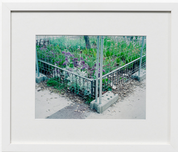
Colin Cardinal Untitled (La Barceloneta) , 2022 Inkjet print on Baryta 15 × 20 cm (5 7/8" × 7 7/8") 28 × 33 cm (11" × 13") (framed)