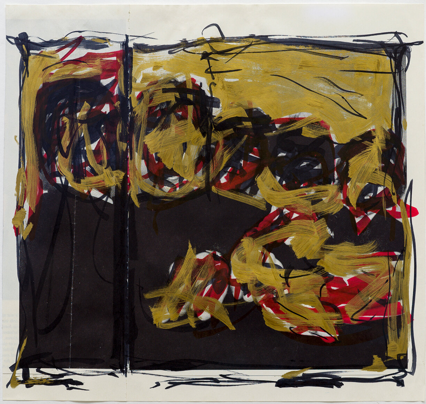
THE ROLLING STONES