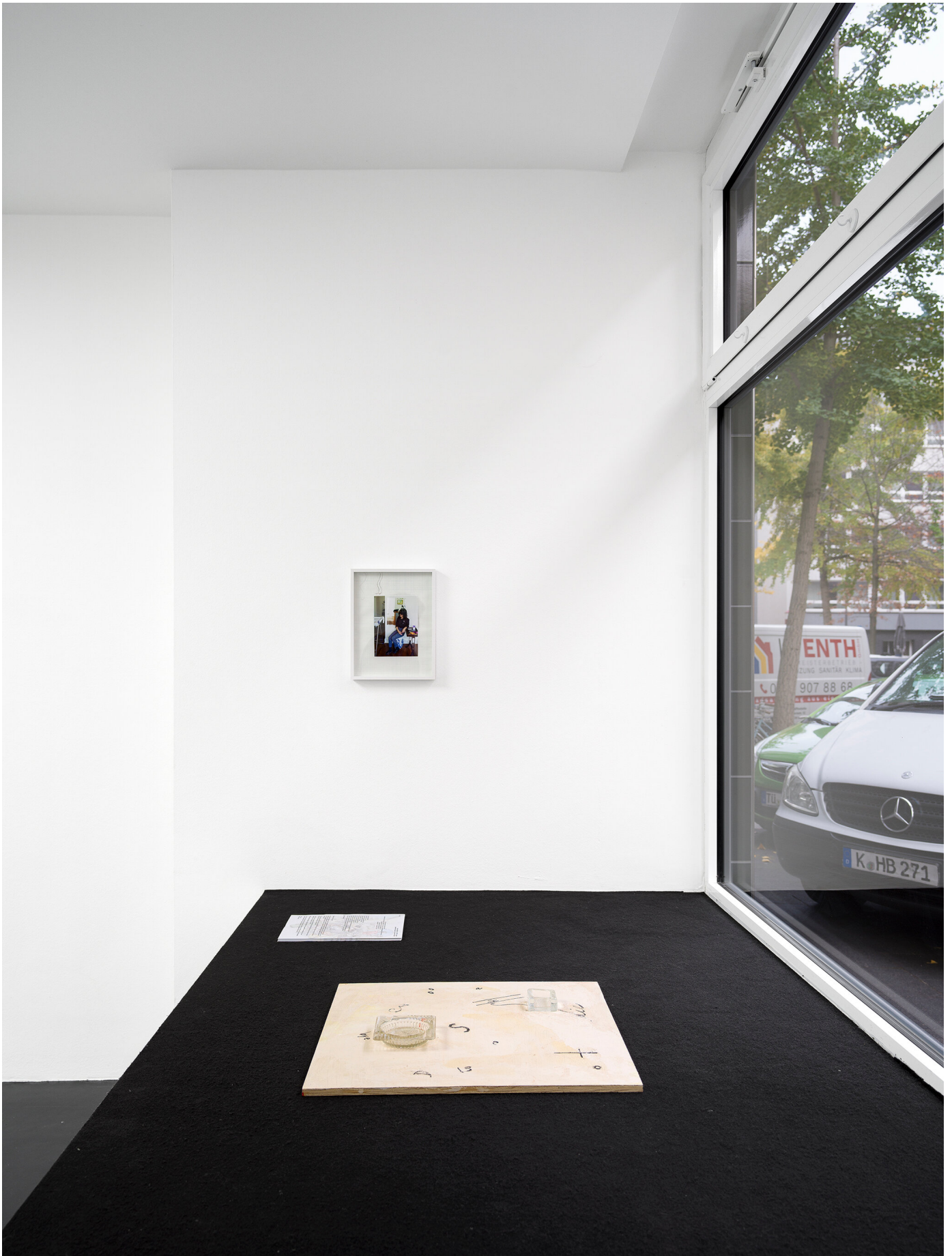
Wait, Where Did I Leave My Keys? November 16, 2022 - January 28, 2023