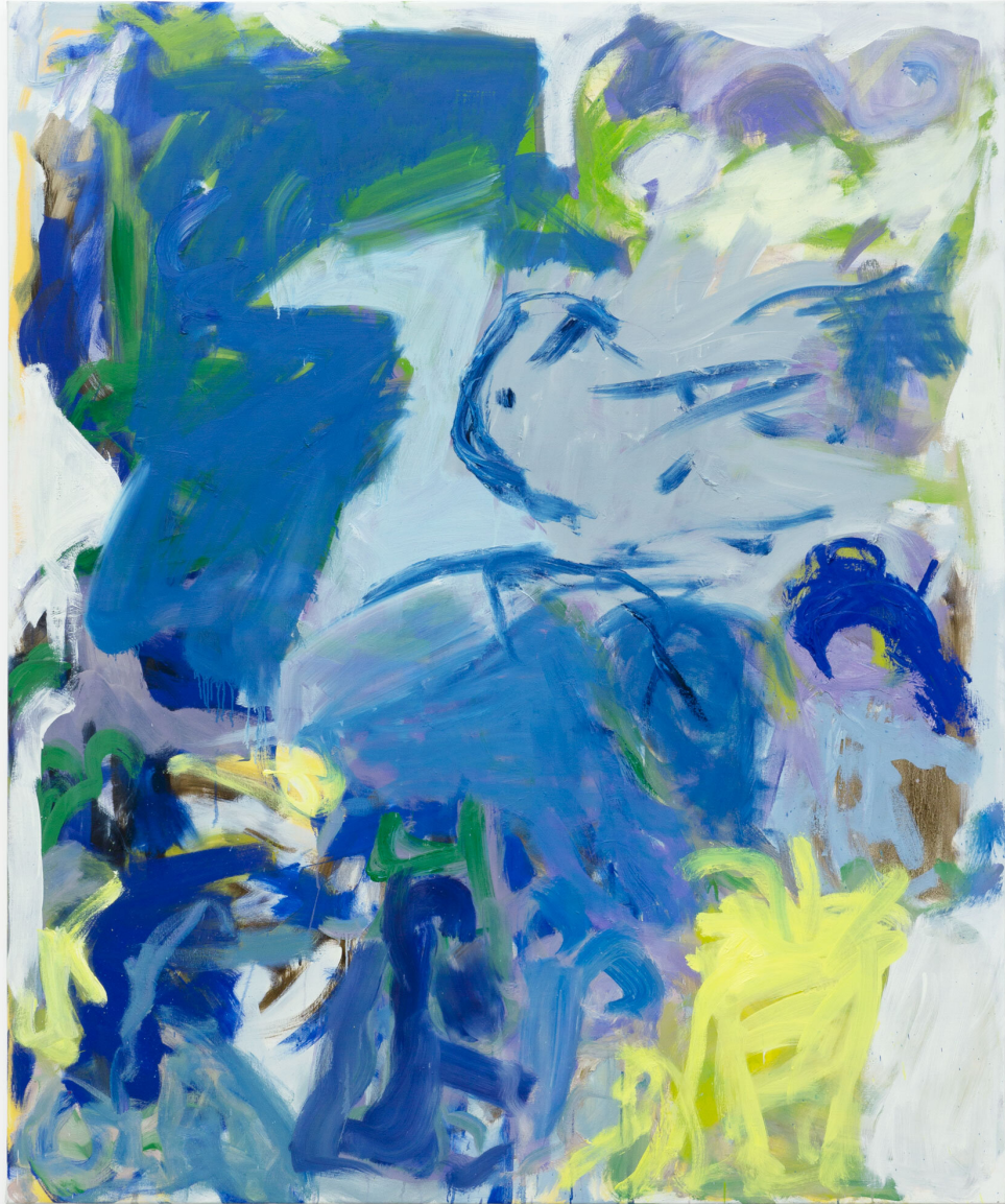
Joanne Robertson Stranger Day , 2021 Oil on canvas 180 × 150 cm (70 7/8" × 59")