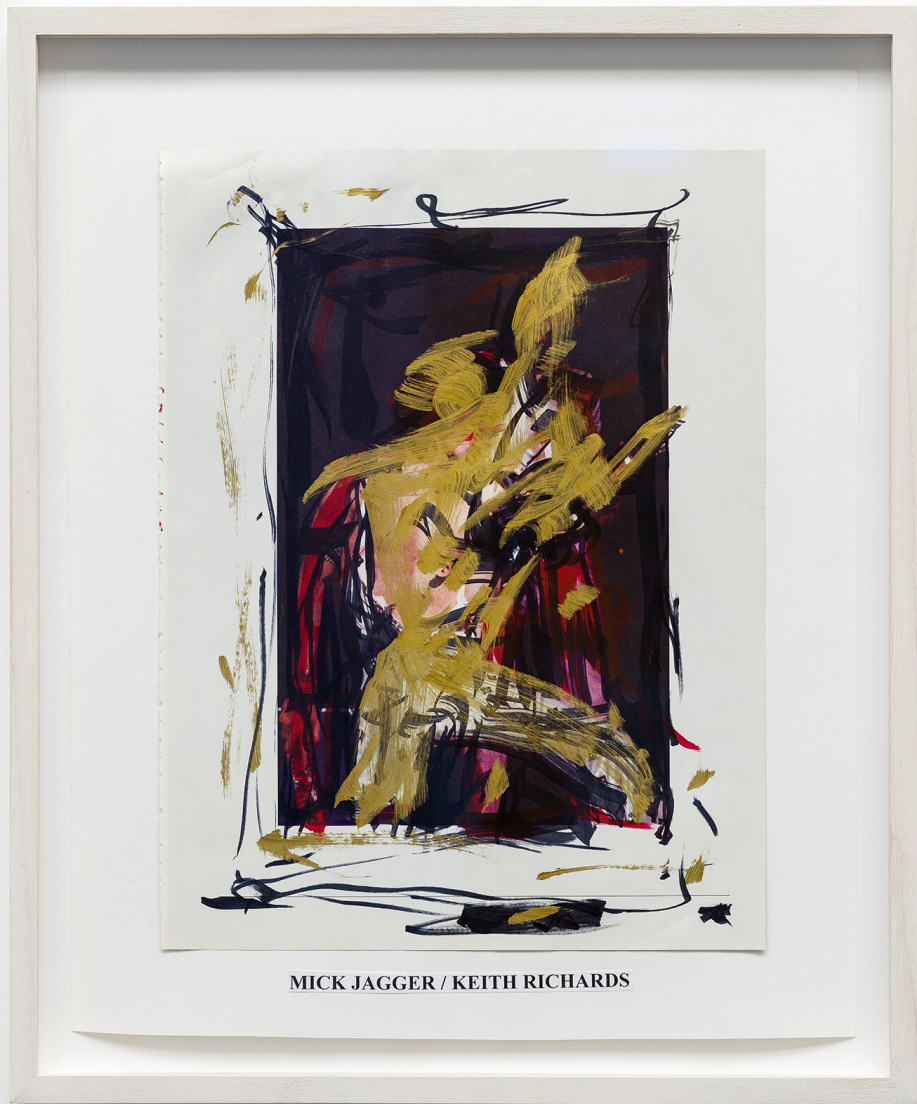
MICK JAGGER / KEITH RICHARDS