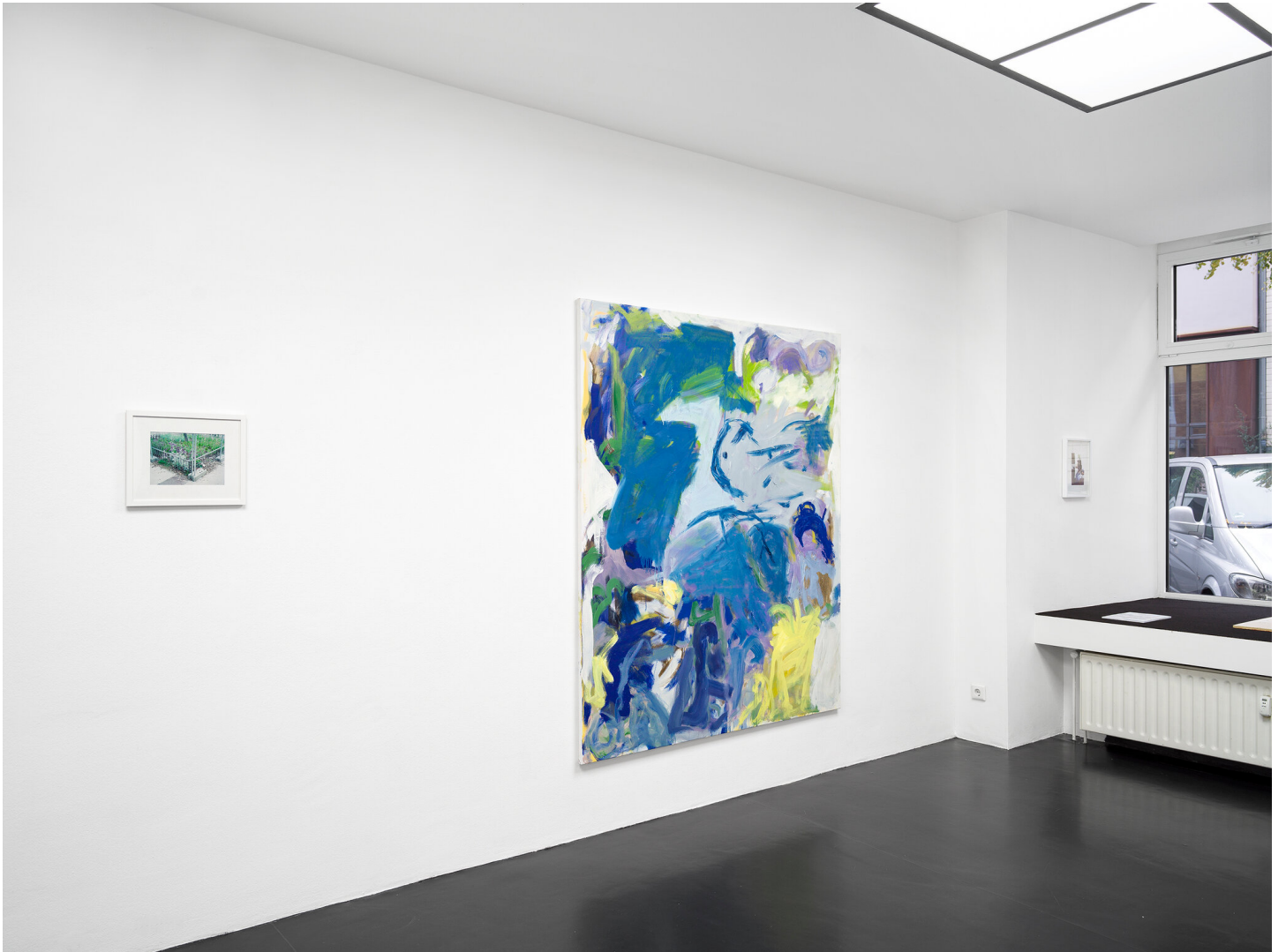
Wait, Where Did I Leave My Keys? November 16, 2022 - January 28, 2023