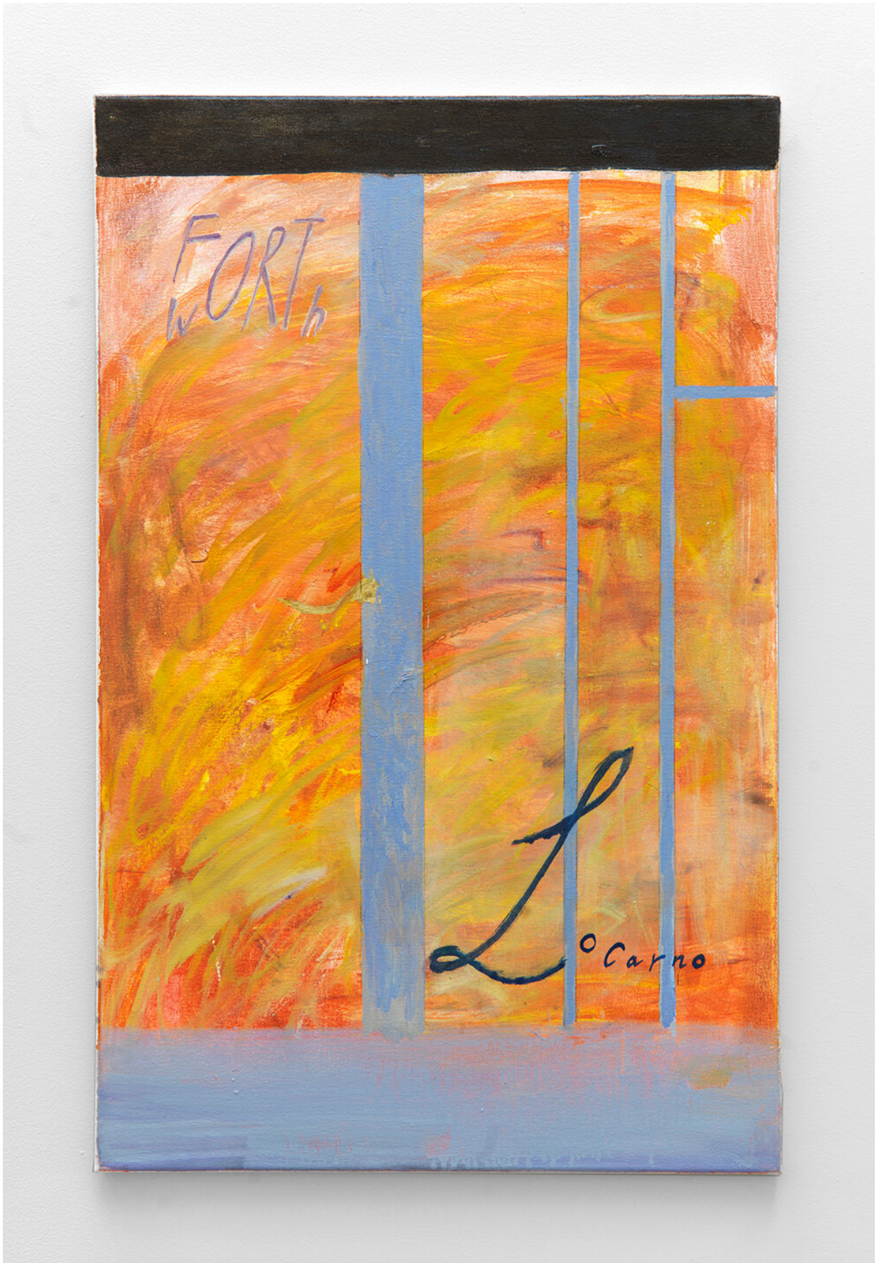
Tam Ochiai Fort Worth Locarno (Patricia Highsmith) , 2014 Oil on canvas 84 × 53 cm (33 1/8" × 20 7/8")