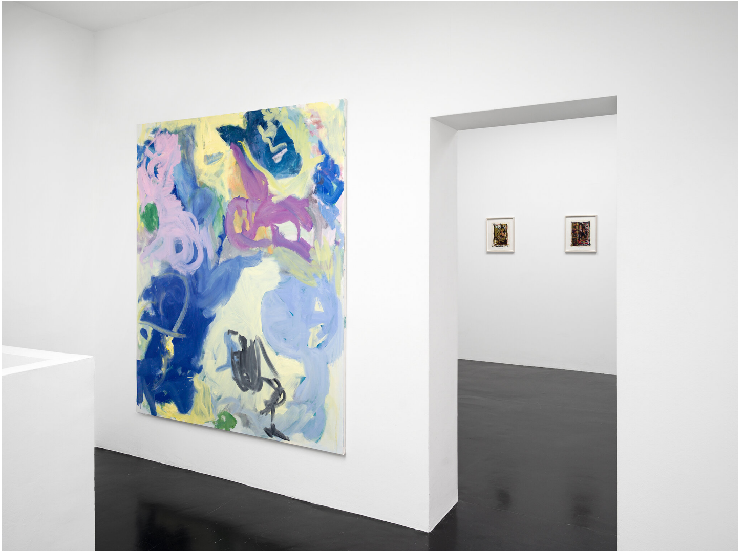
Wait, Where Did I Leave My Keys? November 16, 2022 - January 28, 2023