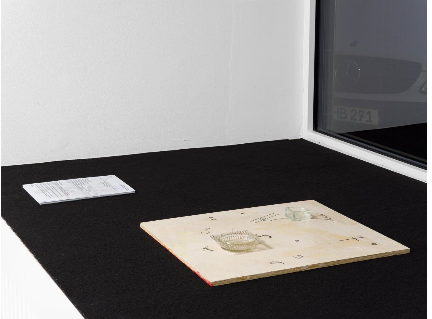
Wait, Where Did I Leave My Keys? November 16, 2022 - January 28, 2023