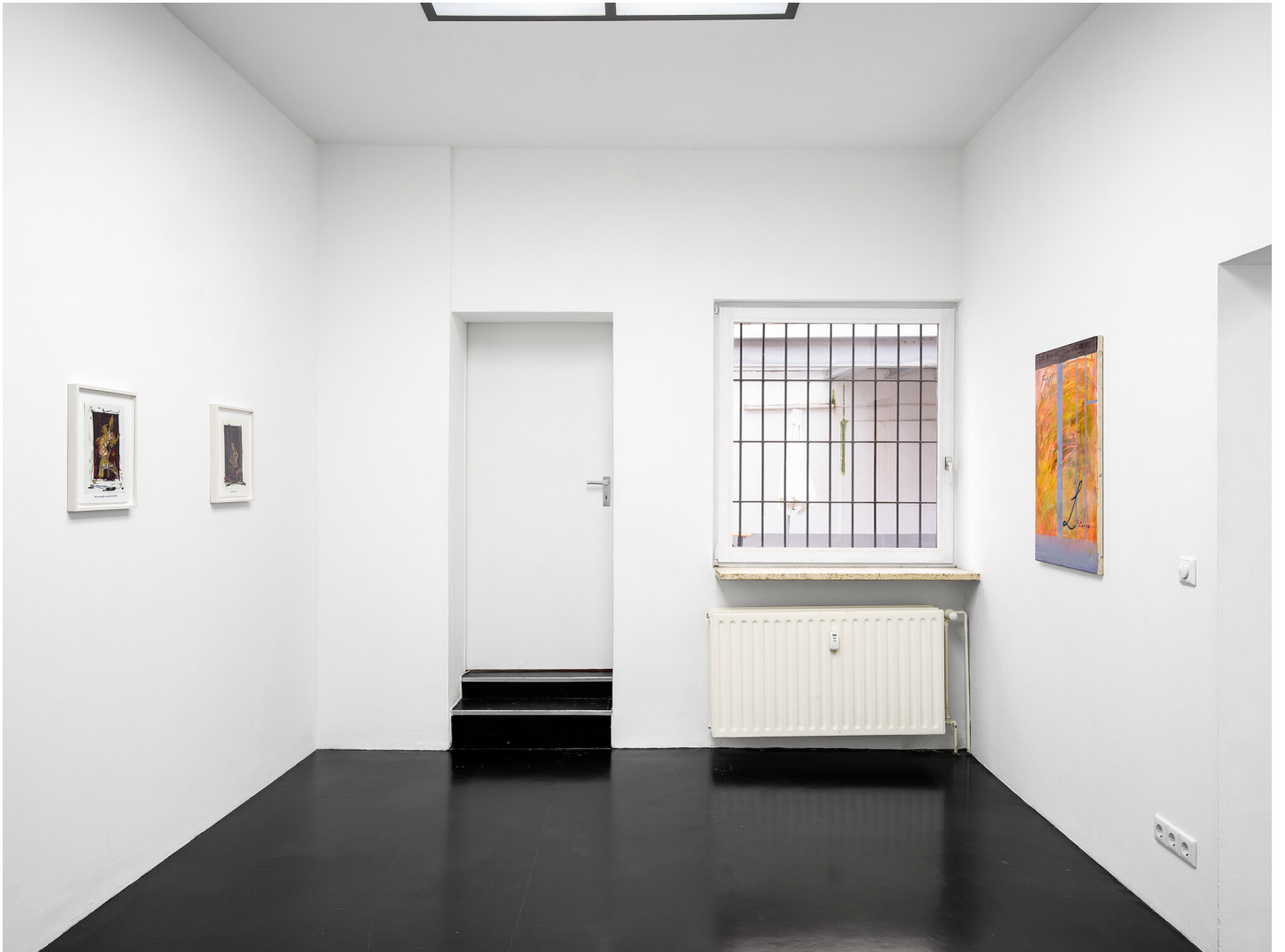
Wait, Where Did I Leave My Keys? November 16, 2022 - January 28, 2023