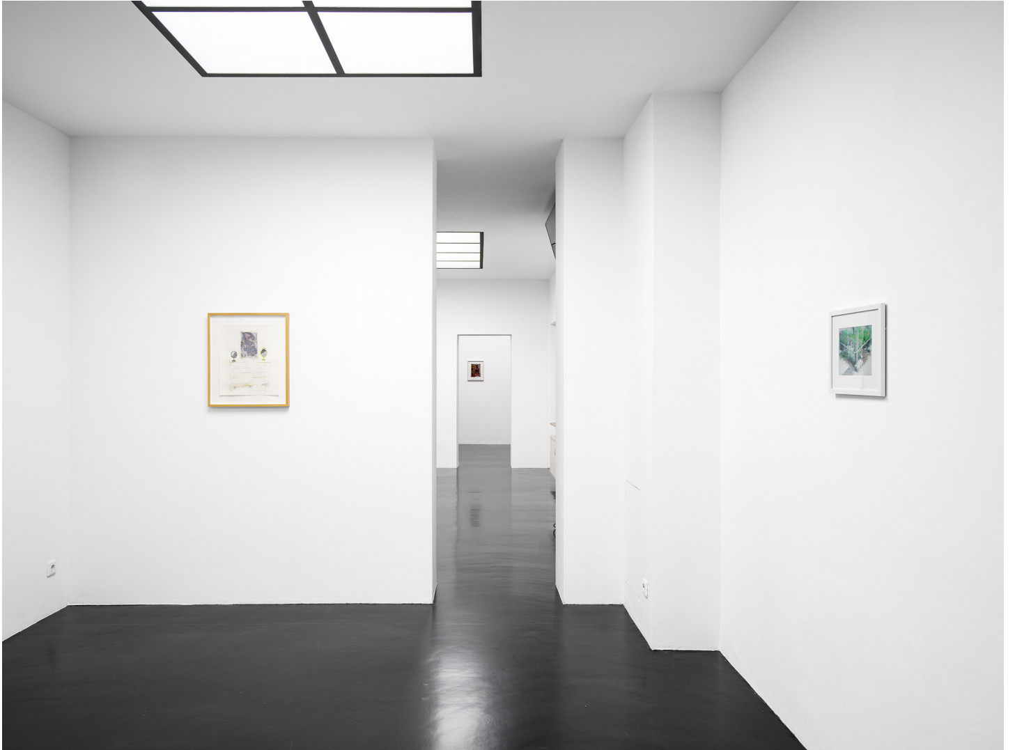
Wait, Where Did I Leave My Keys? November 16, 2022 - January 28, 2023