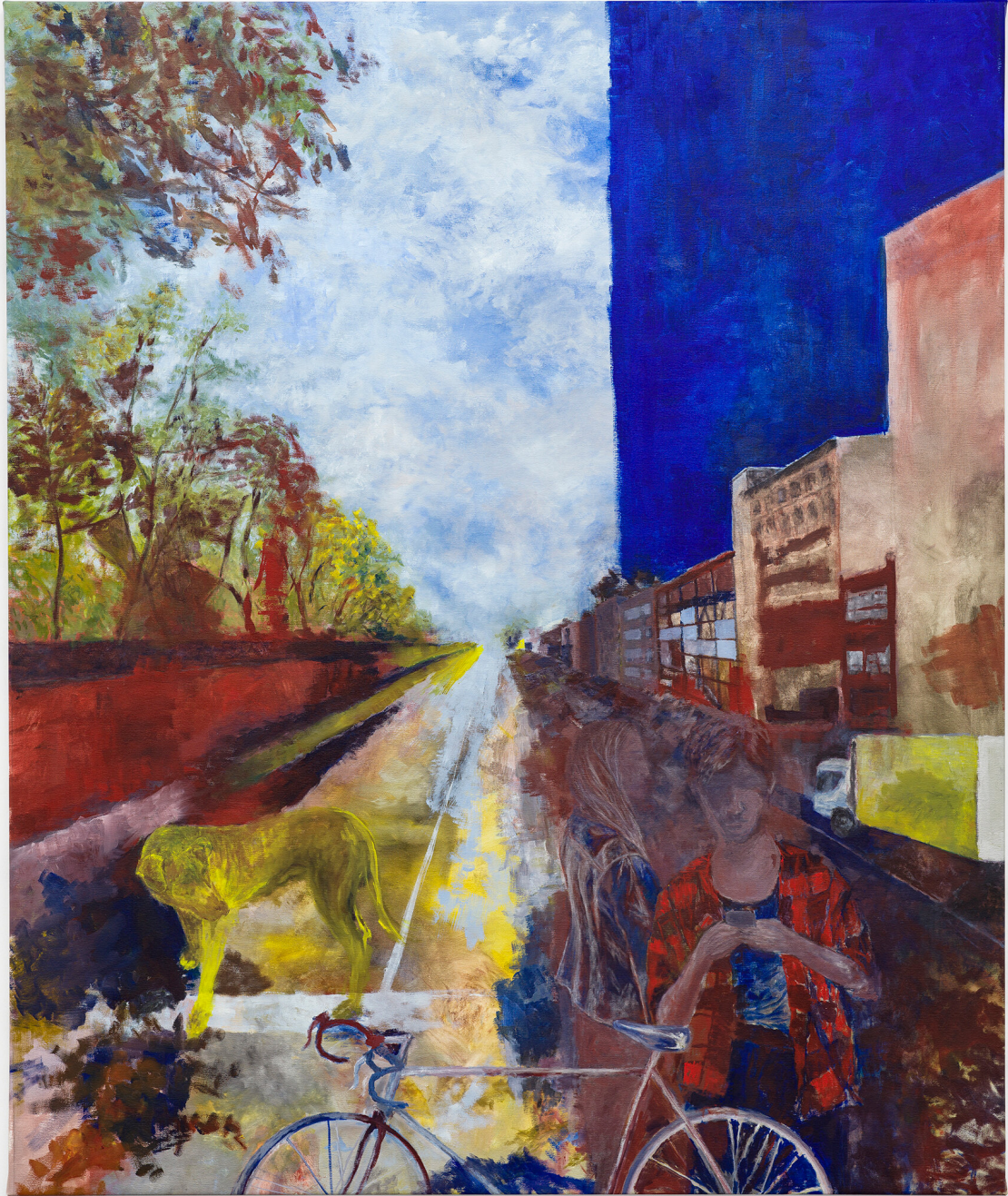
John Sandroni Chrystie Street , 2022 Oil on canvas 152 × 127 cm (59 7/8" × 50")