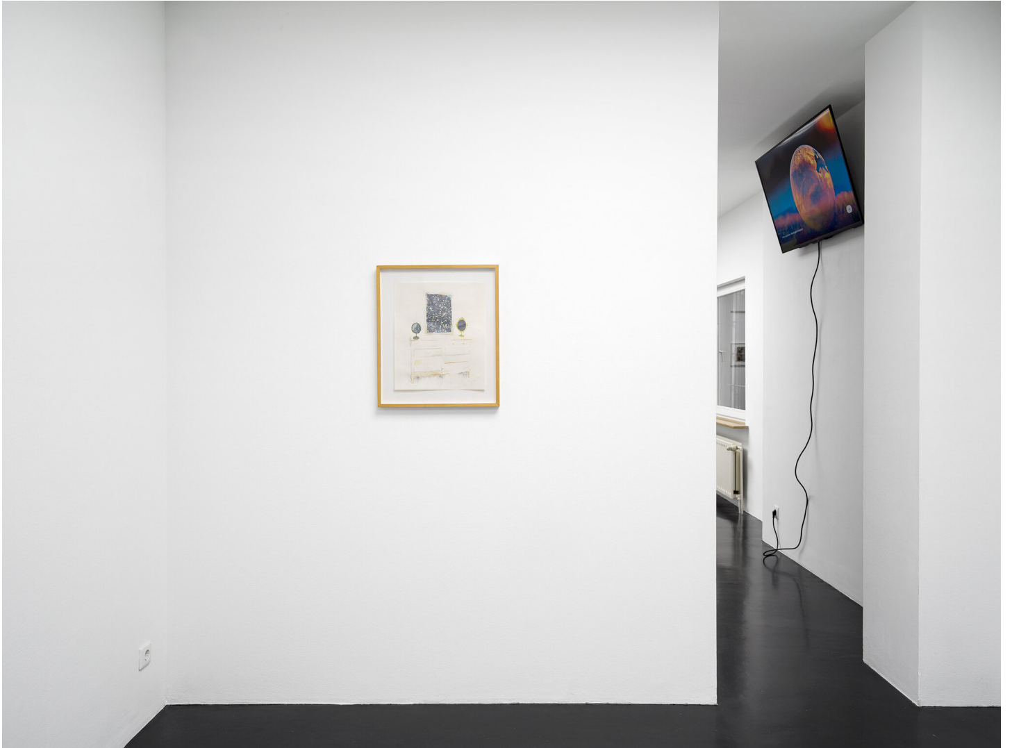
Wait, Where Did I Leave My Keys? November 16, 2022 - January 28, 2023