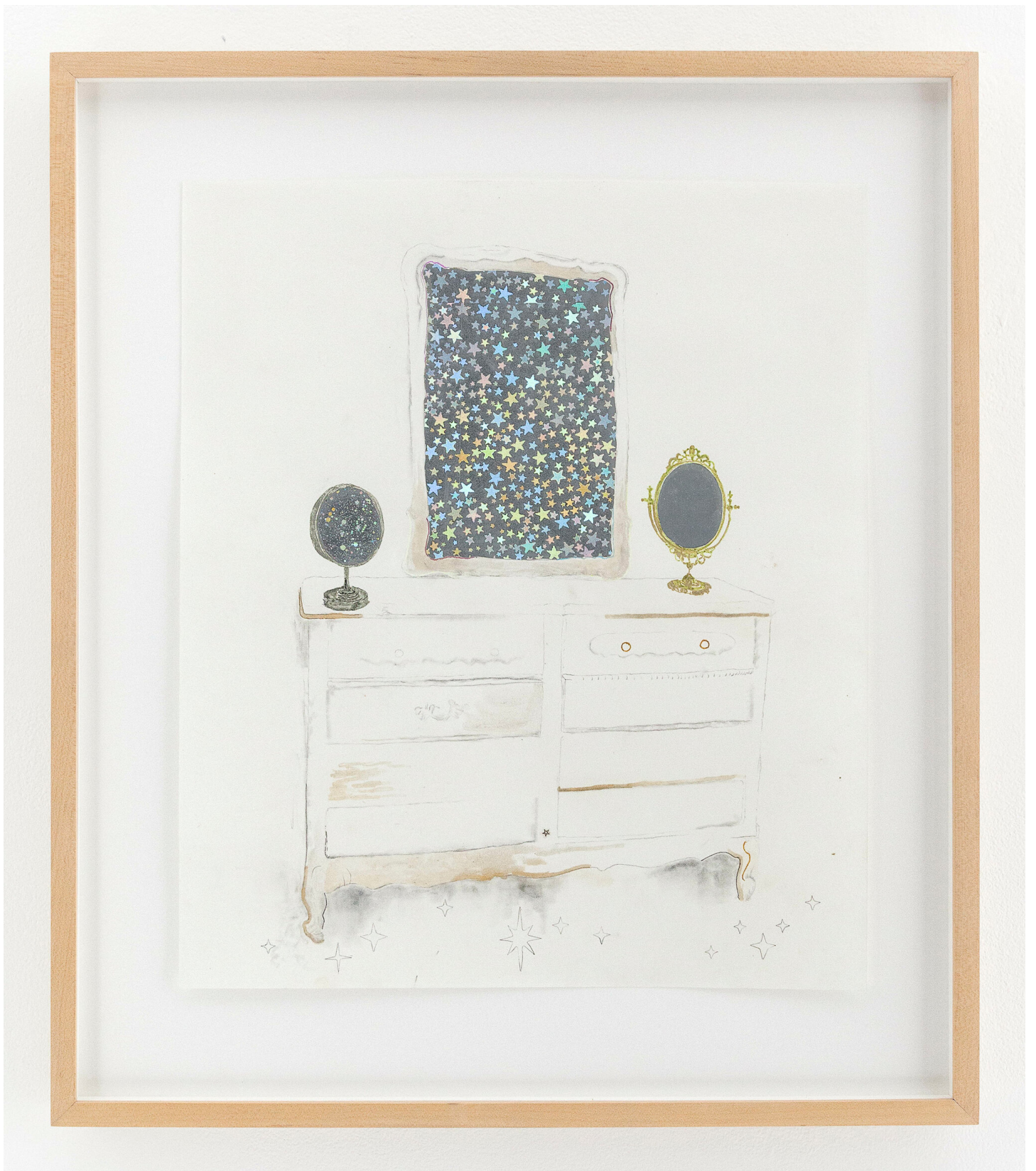
Julie Becker Untitled (mirror drawing) , 2004 Mixed media on paper 43 × 35,5 cm (16 7/8" × 14") 55 × 47,5 × 4 cm (21 5/8" × 18 3/4" × 1 5/8") (framed)