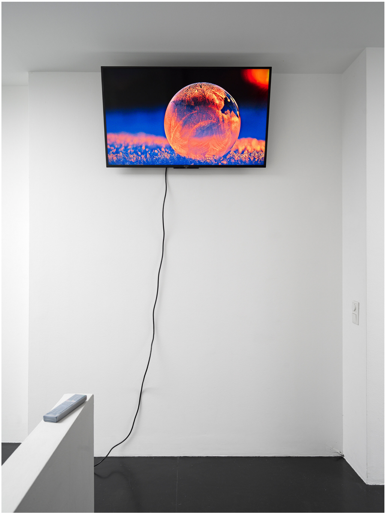
Bill Hayden Untitled, 2022 YouTube channel on television, mounting bracket, remote control with silicone sleeve