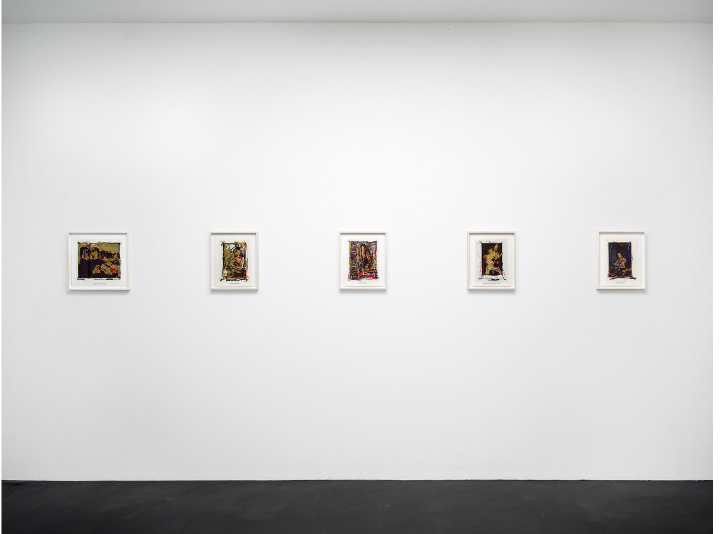
Wolfgang Voigt The Rolling Stones , 2018 felt pen and collage on paper Set of five works, each (except of one: 28 x 30 cm): 28 x 21 cm Dimensions variable