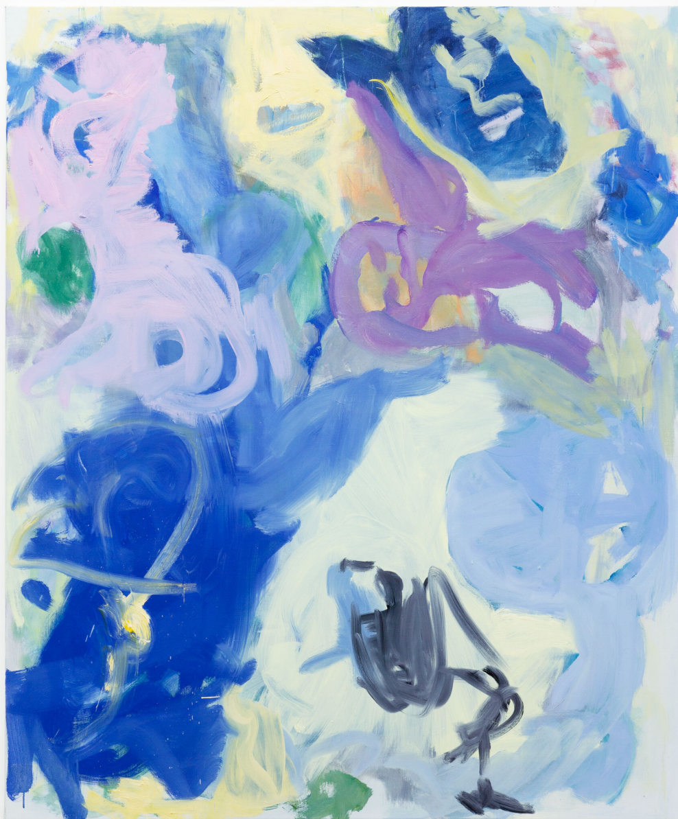
Joanne Robertson Press Onto , 2021 Oil on canvas 180 × 150 cm (70 7/8" × 59")