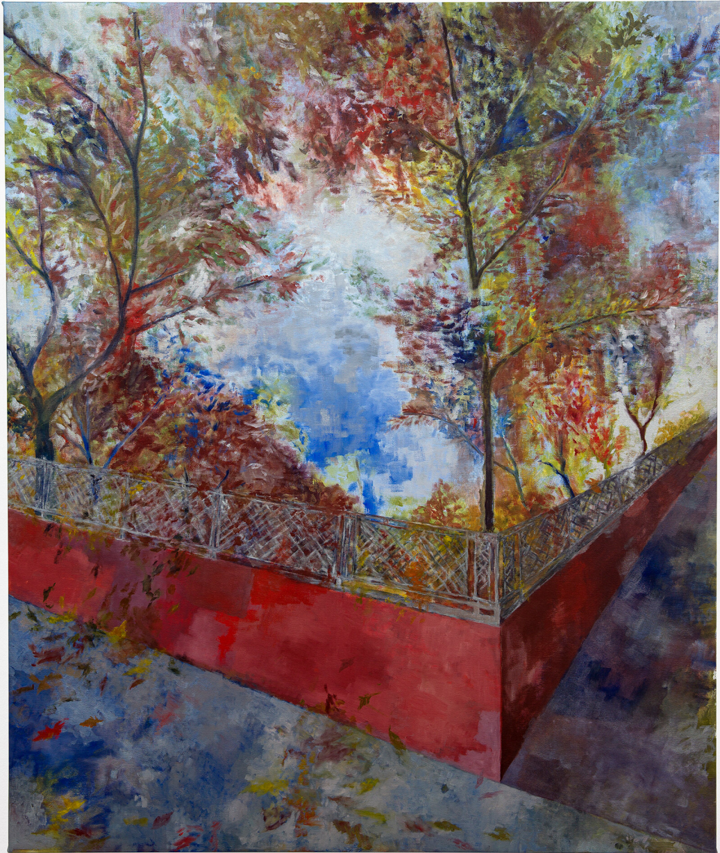
John Sandroni Chrystie Street 2 , 2022 Oil on canvas 152 × 127 cm (59 7/8" × 50")