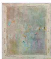
EMPTY MAP (FOR NELLA) , 2021, oil on marble powder on jute, 220 x 190 cm | 86.6 x 74.8 in