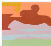
Subversive Softening or the softened reality , 2021, pigmented marble powder on jute, 205 x 230 cm | 80.7 x 90.6 in