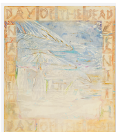
Nadir and Zenith , 2021, oil on marble powder on jute, 230 x 200 | 90.6 x 78.7 in

+41786599193 PHILIPP@PHILIPPZOLLINGER.COM WWW.PHILIPPZOLLINGER.COM