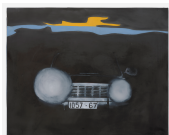
MERCEDS BENZ , 2021, oil on graphite and pigmented marble powder on jute, 90 x 110 cm | 35.4 x 43.3 in