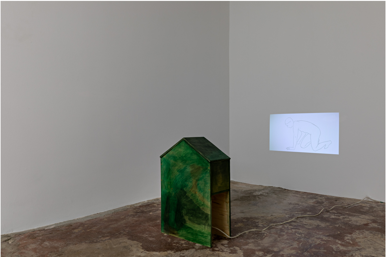
Installation view 14a, Hamburg Aidan Koch, Tides and Trees