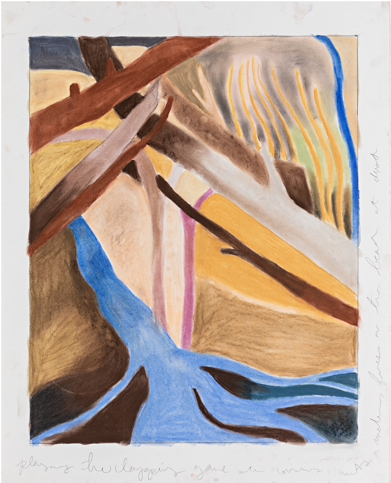
Oregon Coast Hand Game, 2022