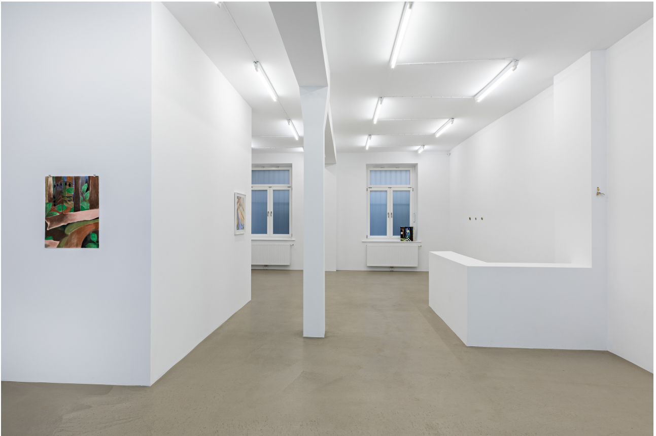
Installation view 14a, Hamburg Aidan Koch, Tides and Trees