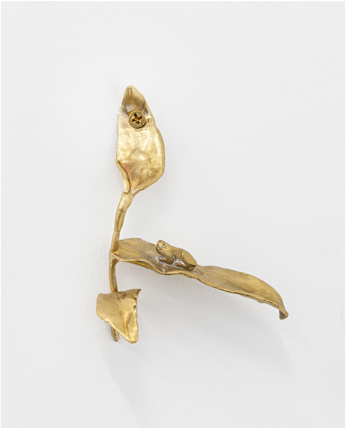
Frog on Leaf , 2016 Brass 4 × 4.5 × 3 inches 10,2 × 11,4 × 7,6 cm AK023