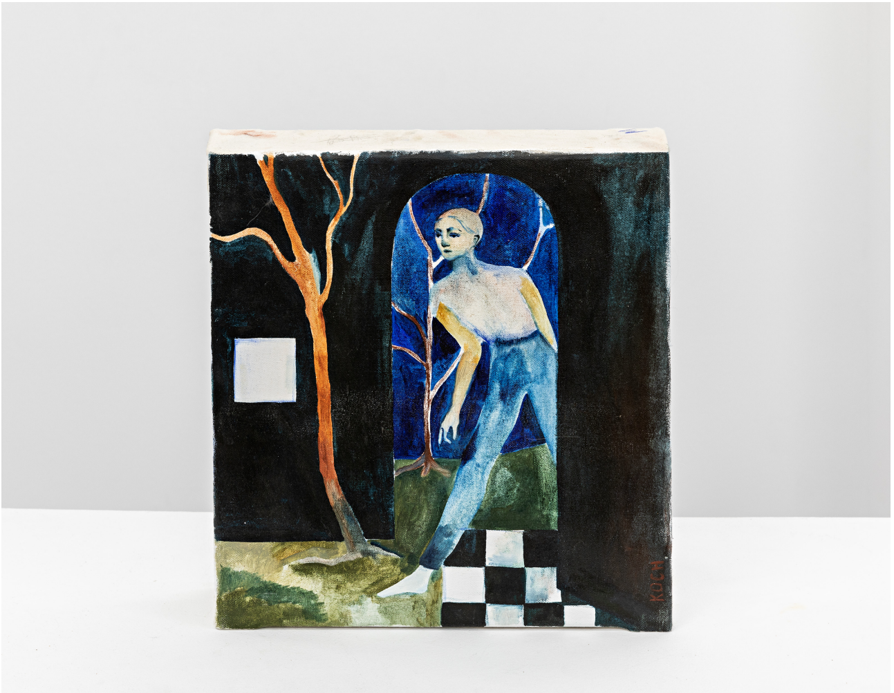
Portal and Sapling, 2020