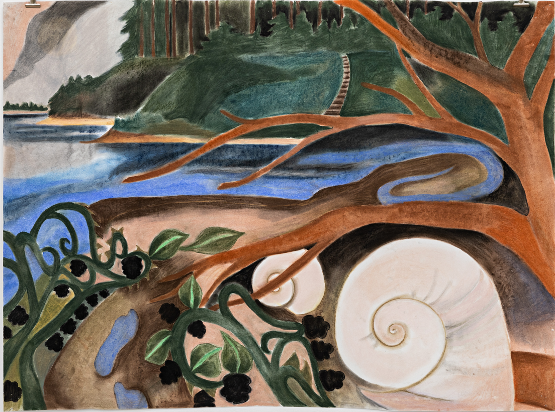
Tides on Earlin I, 2022