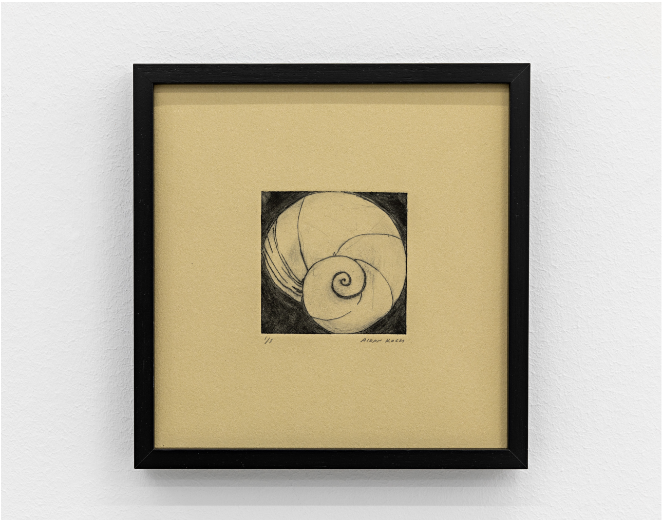
Moonsnail Shell, 2022

Drypoint print 7.5 × 7.5 inches 19,1 × 19,1 cm Edition of 5 AK020