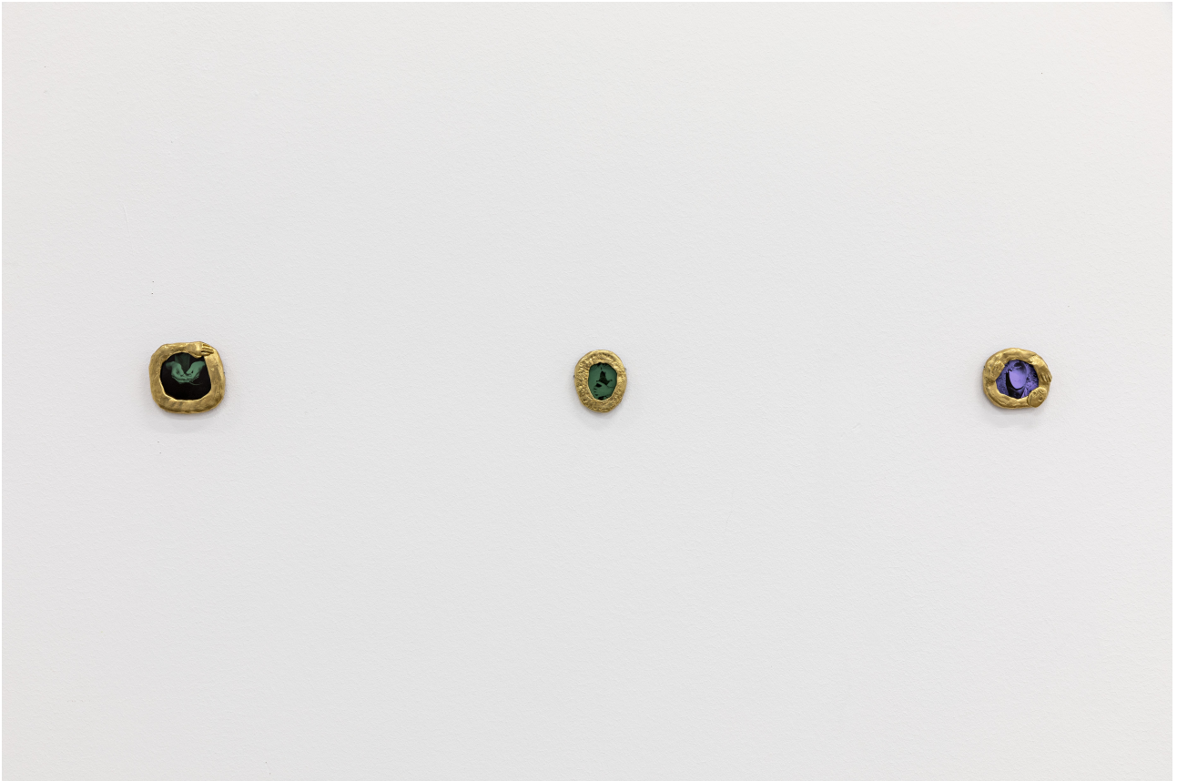
Installation view 14a, Hamburg Aidan Koch, Tides and Trees