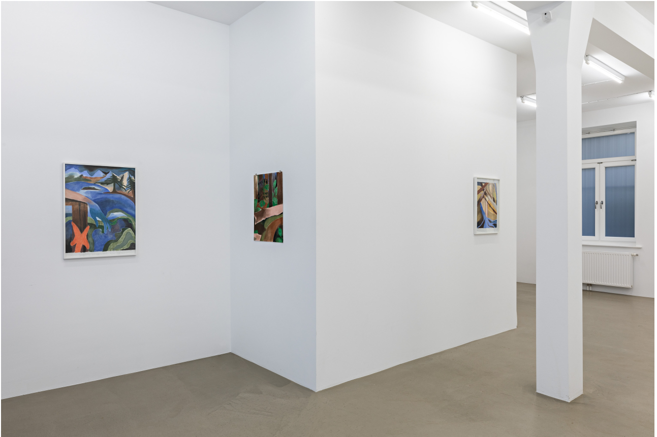
Installation view 14a, Hamburg Aidan Koch, Tides and Trees