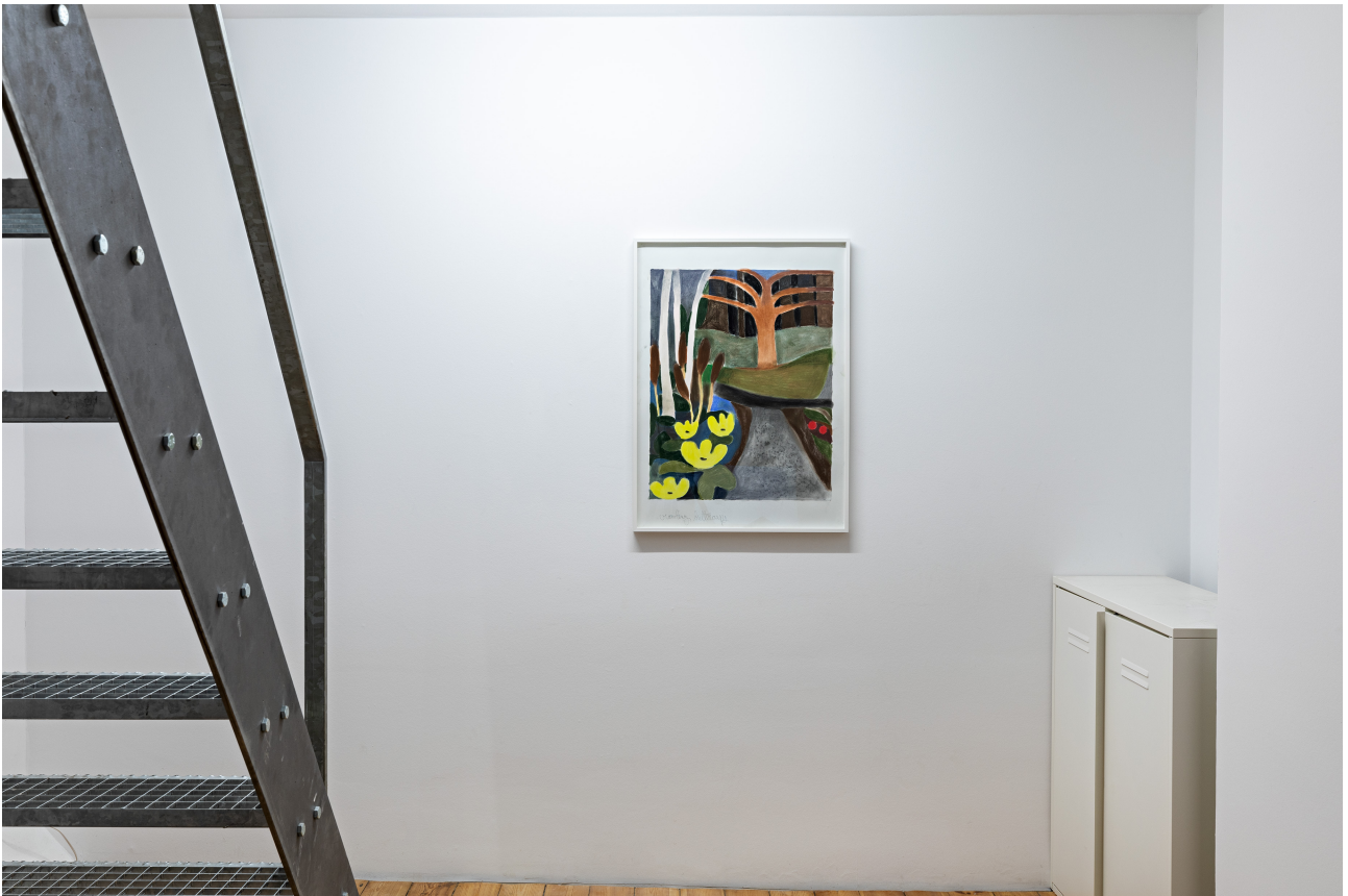
Installation view 14a, Hamburg Aidan Koch, Tides and Trees