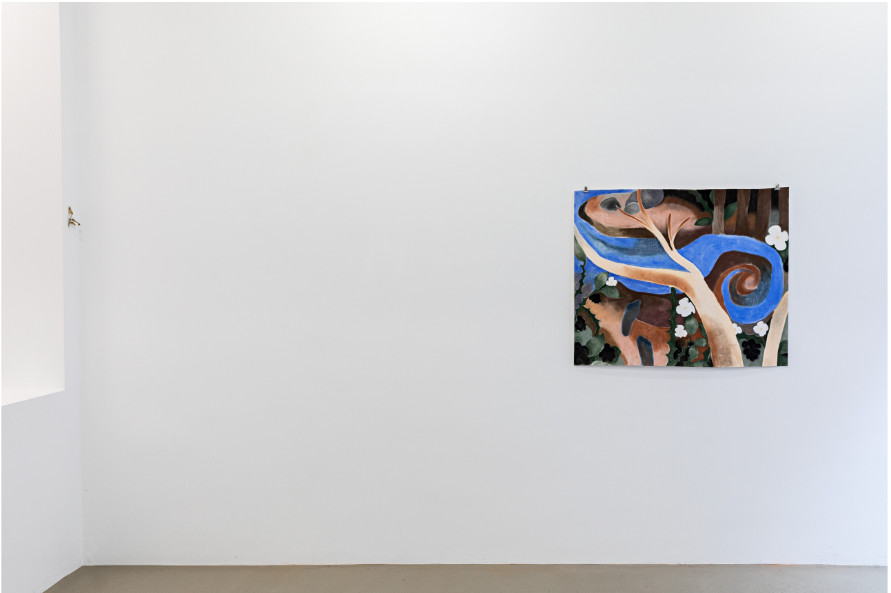
Installation view 14a, Hamburg Aidan Koch, Tides and Trees