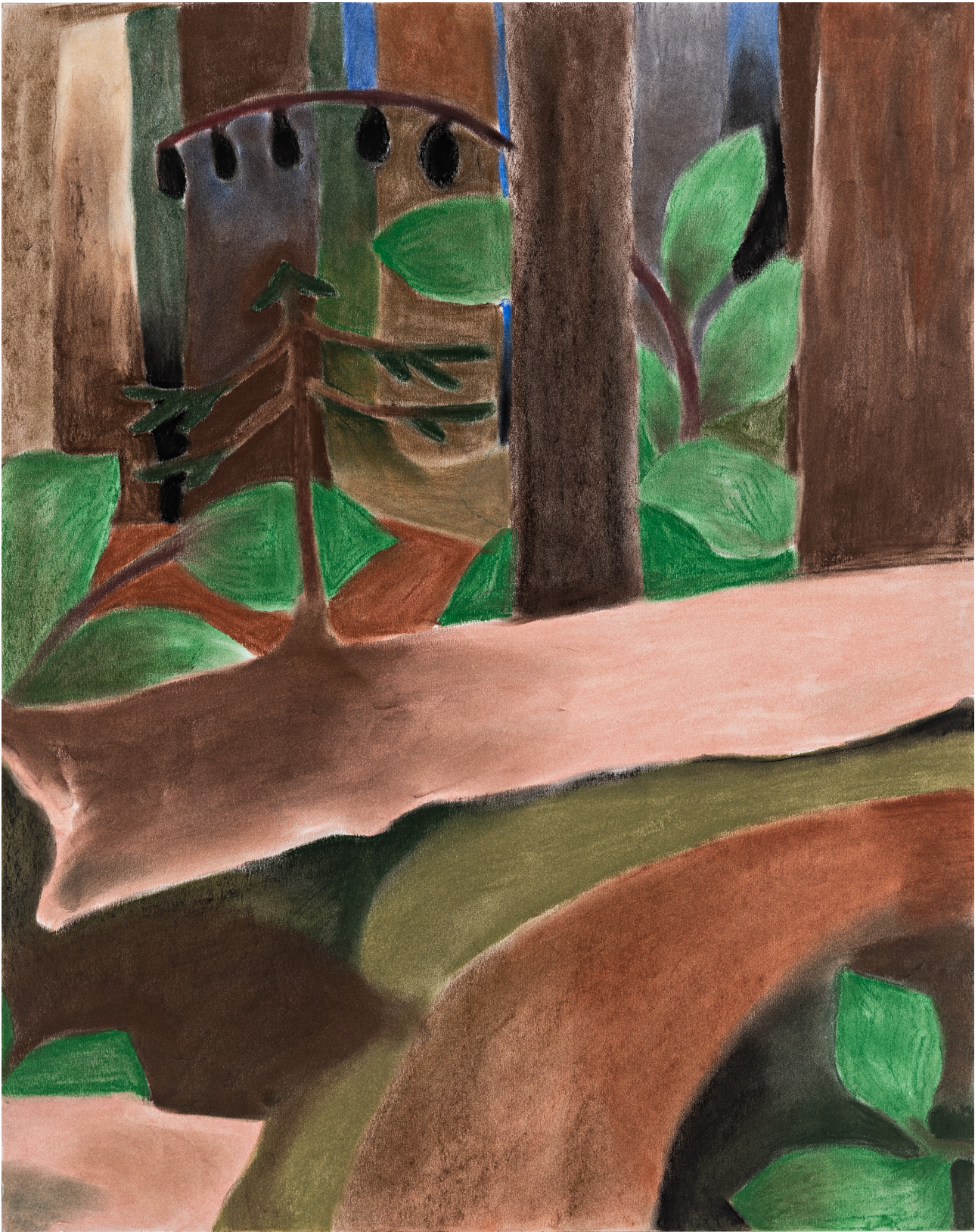
Nurse Log , 2022 Soft pastel on paper 24 × 19 inches 61 × 48,3 cm AK014