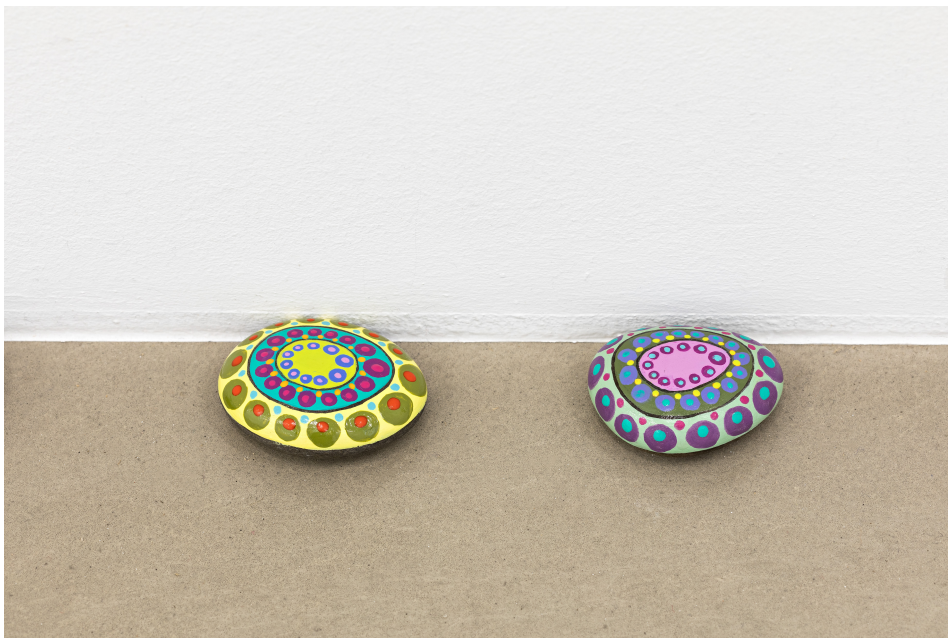
Rocks by Katie Koch, 2022 Acrylic paint on collected rocks Variable dimensions AK027