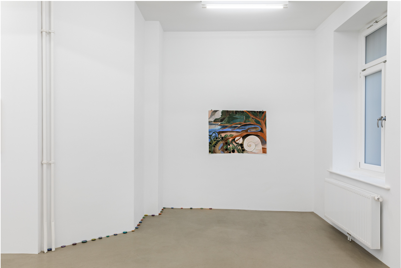
Installation view 14a, Hamburg Aidan Koch, Tides and Trees