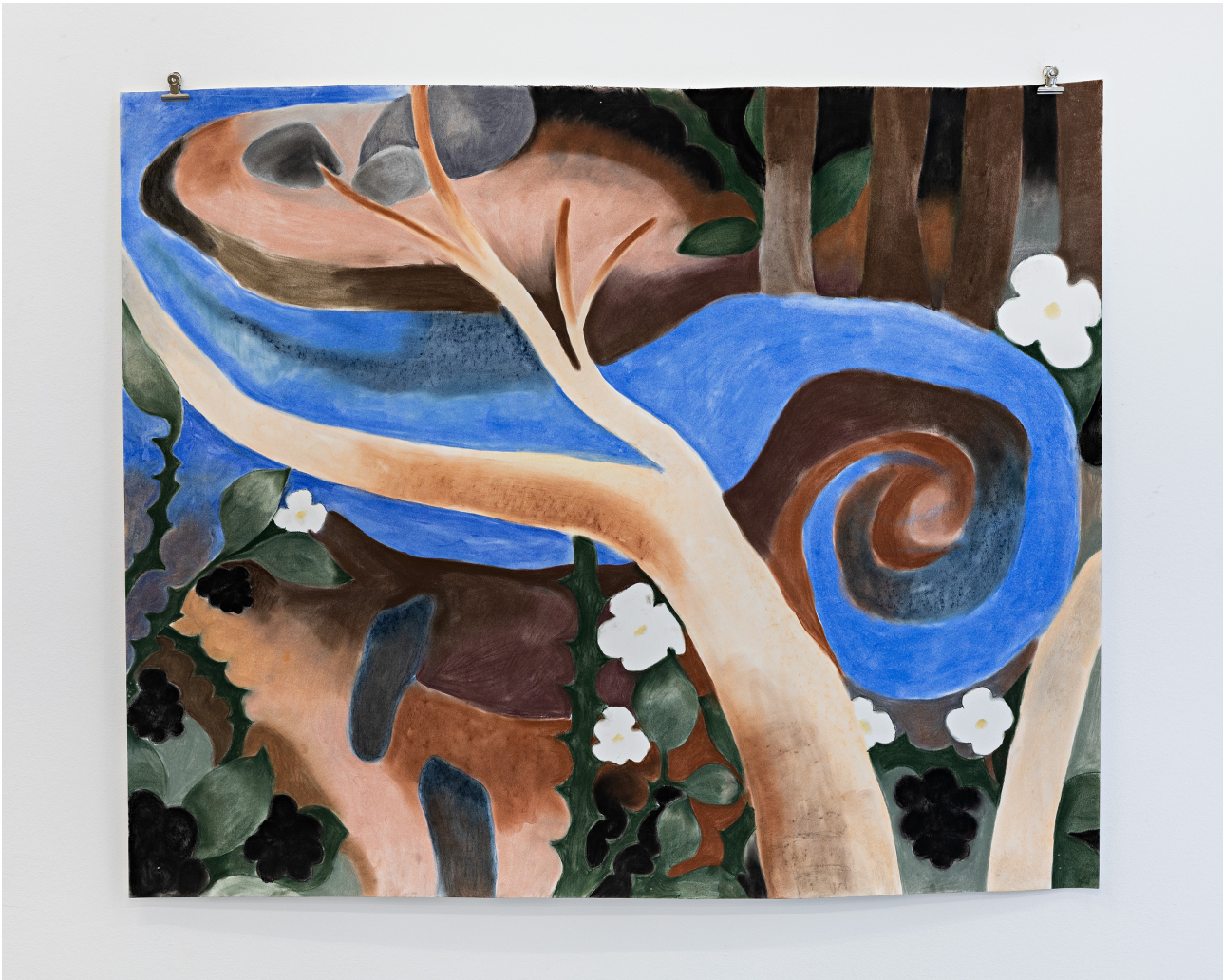
Tides on Earlin II, 2022