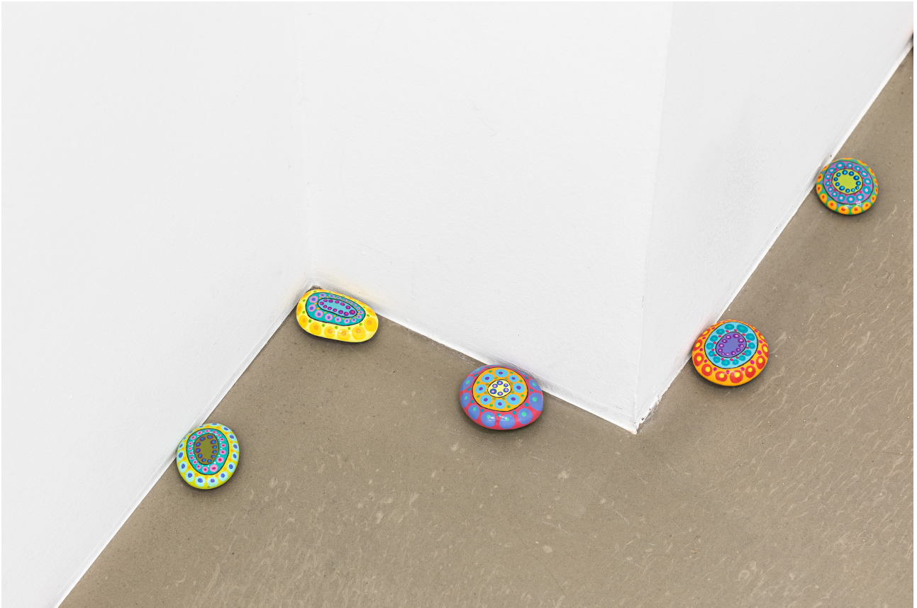
Installation view 14a, Hamburg Aidan Koch, Tides and Trees