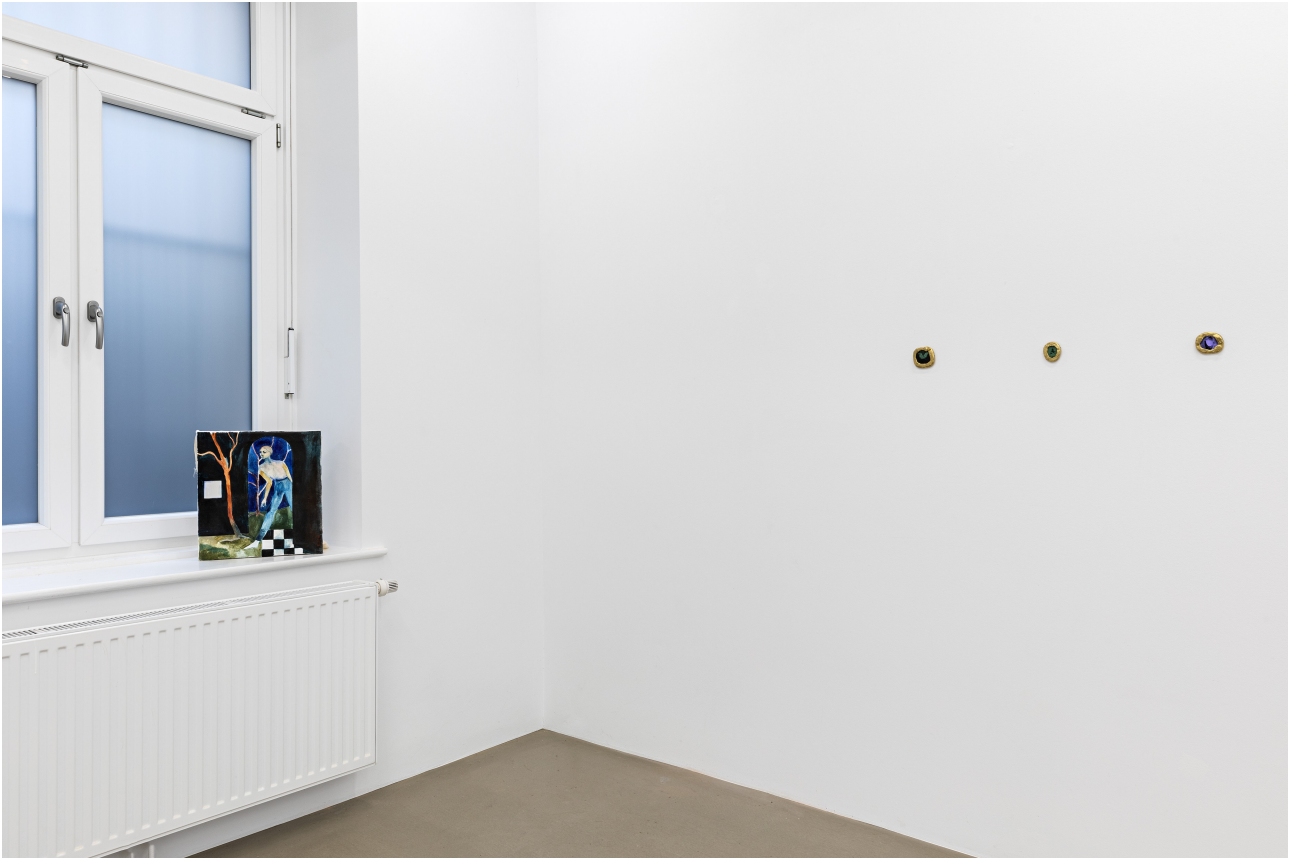
Installation view 14a, Hamburg Aidan Koch, Tides and Trees