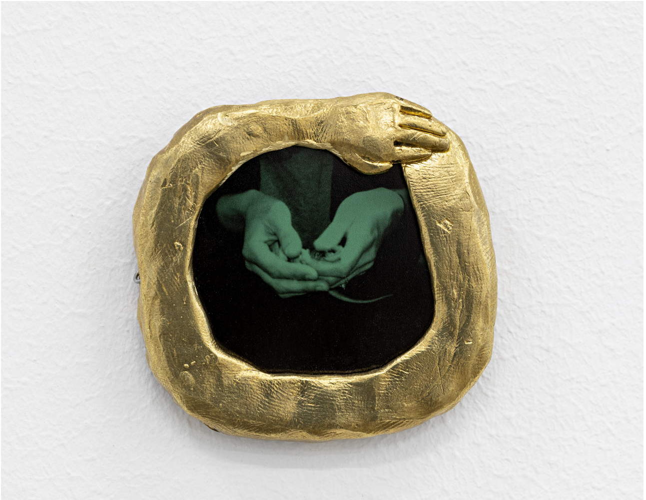
Lizard in the woods, 2022