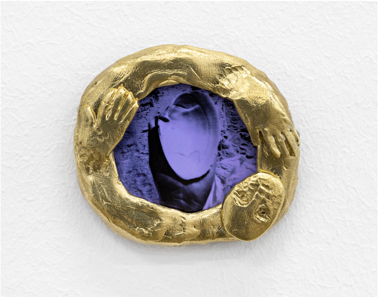
Sea Shell, 2022 Brass and photo print 2.5 × 2 inches 6,3 × 5,1 cm AK026