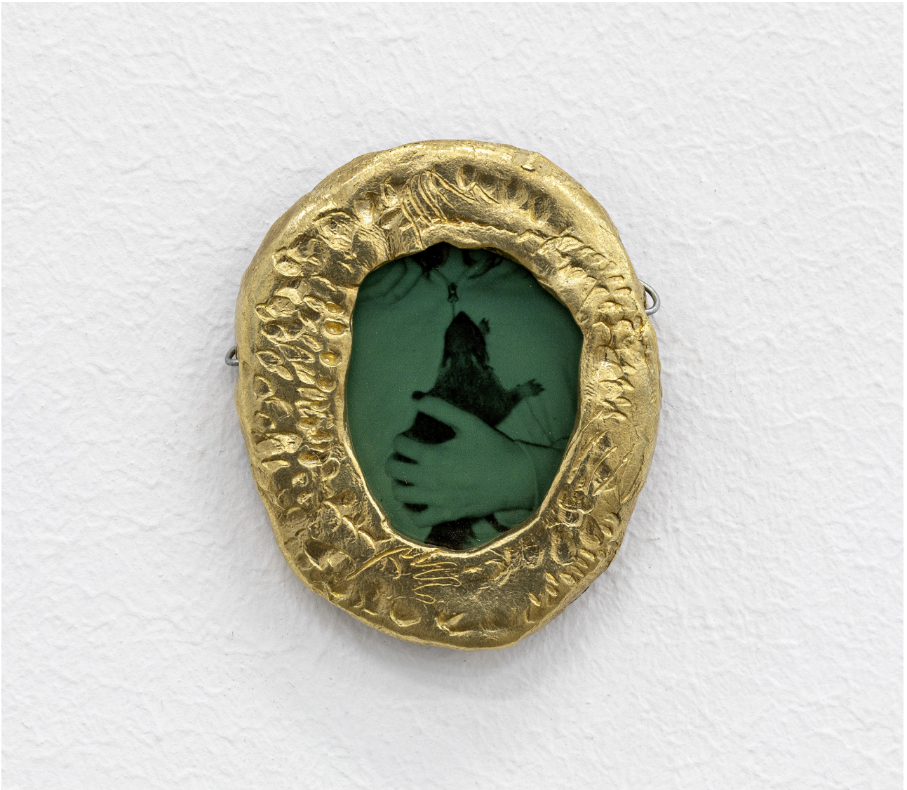
Squirrel Nutkin , 2022 Brass and photo print 2.5 × 1.5 inches 6,3 × 3,8 cm AK025