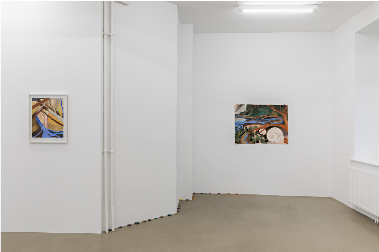
Installation view 14a, Hamburg Aidan Koch, Tides and Trees