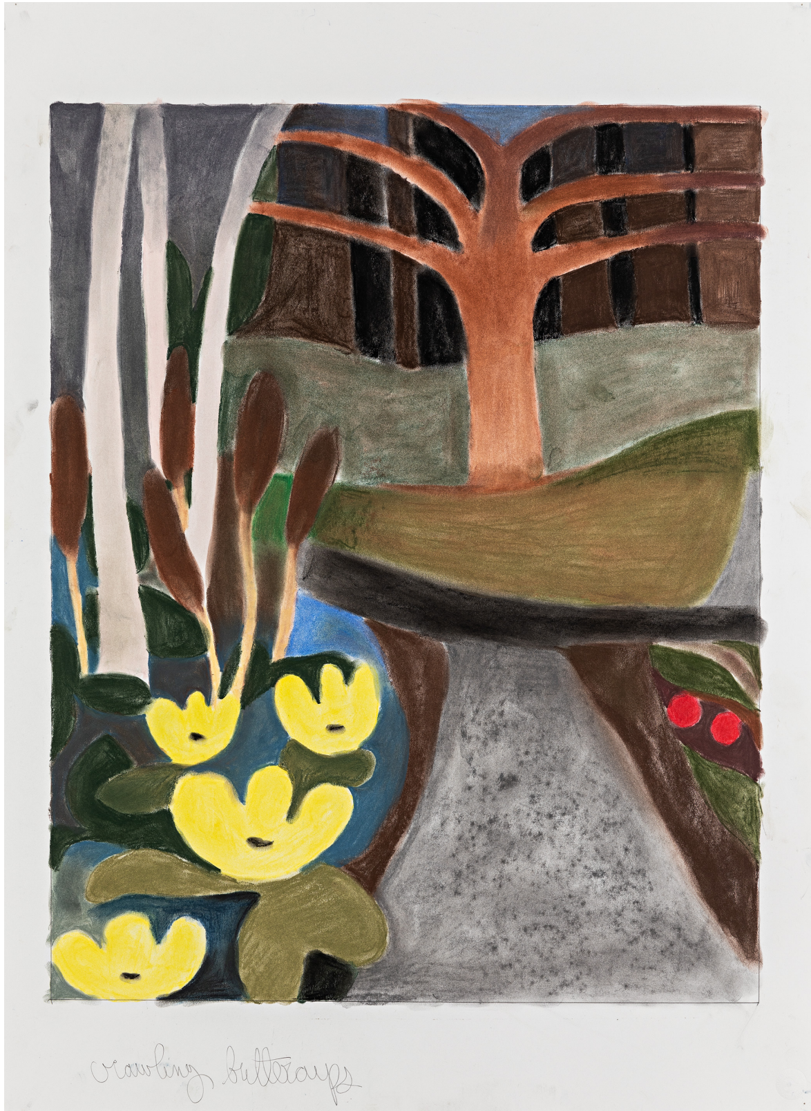
Crawling Buttercups , 2022