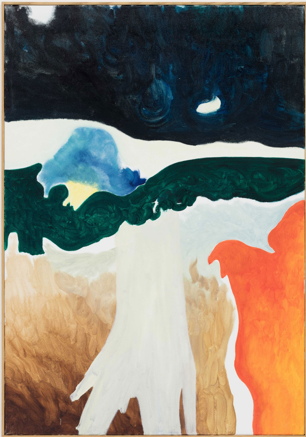
Untitled # 6 2022 Oil on canvas (100 x 70 cm)