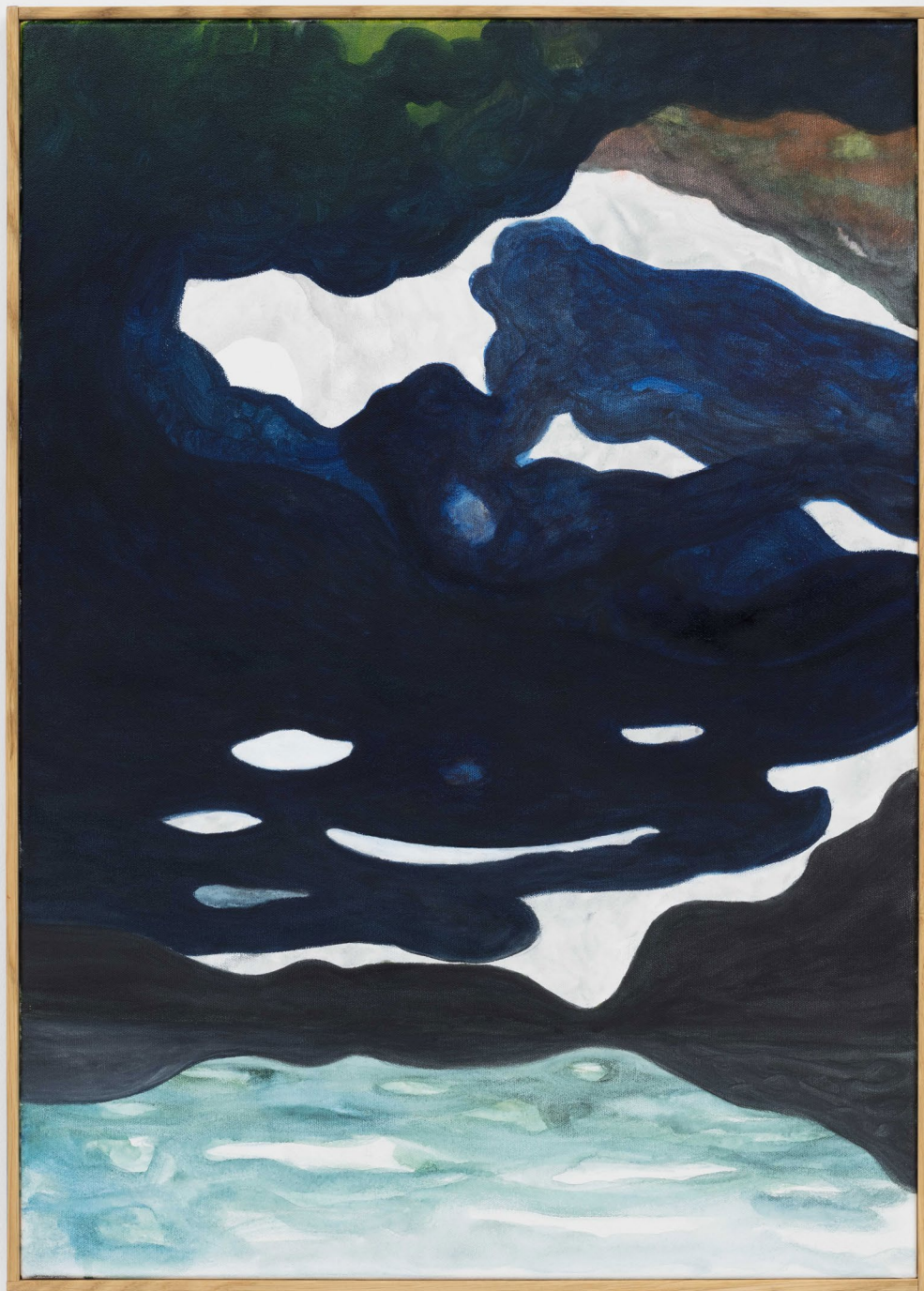
Untitled # 7 2022 Oil on canvas (70 x 50 cm)