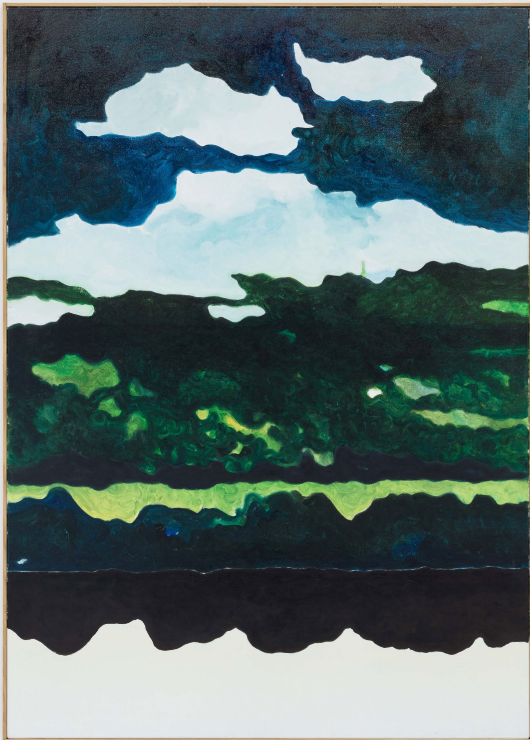
Untitled # 4 2022 Oil on canvas (140 x 100 cm)