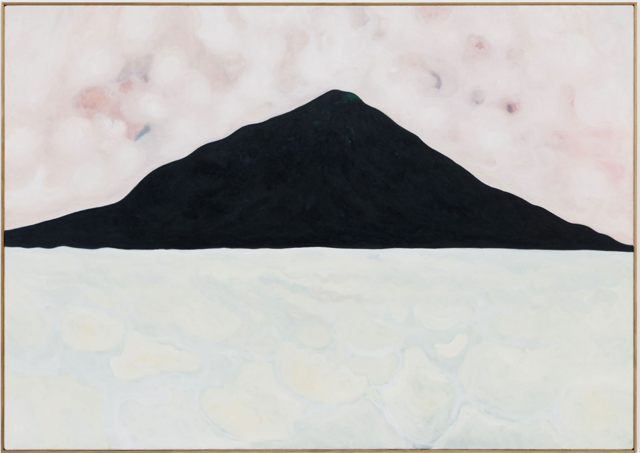
Untitled # 5 2022 Oil on canvas (120 x 170 cm)