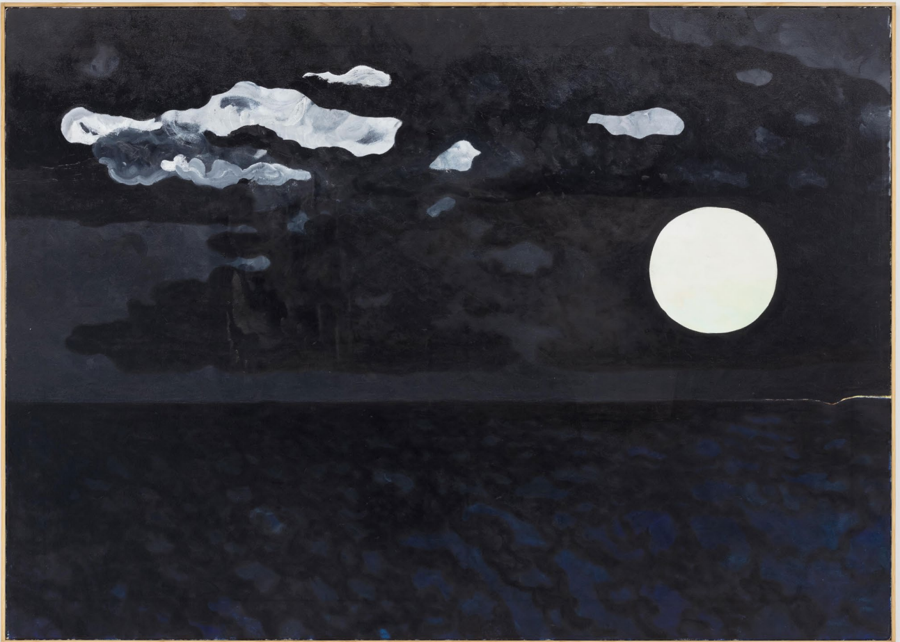
Untitled # 1 2022 Oil on canvas (100 x 140 cm)