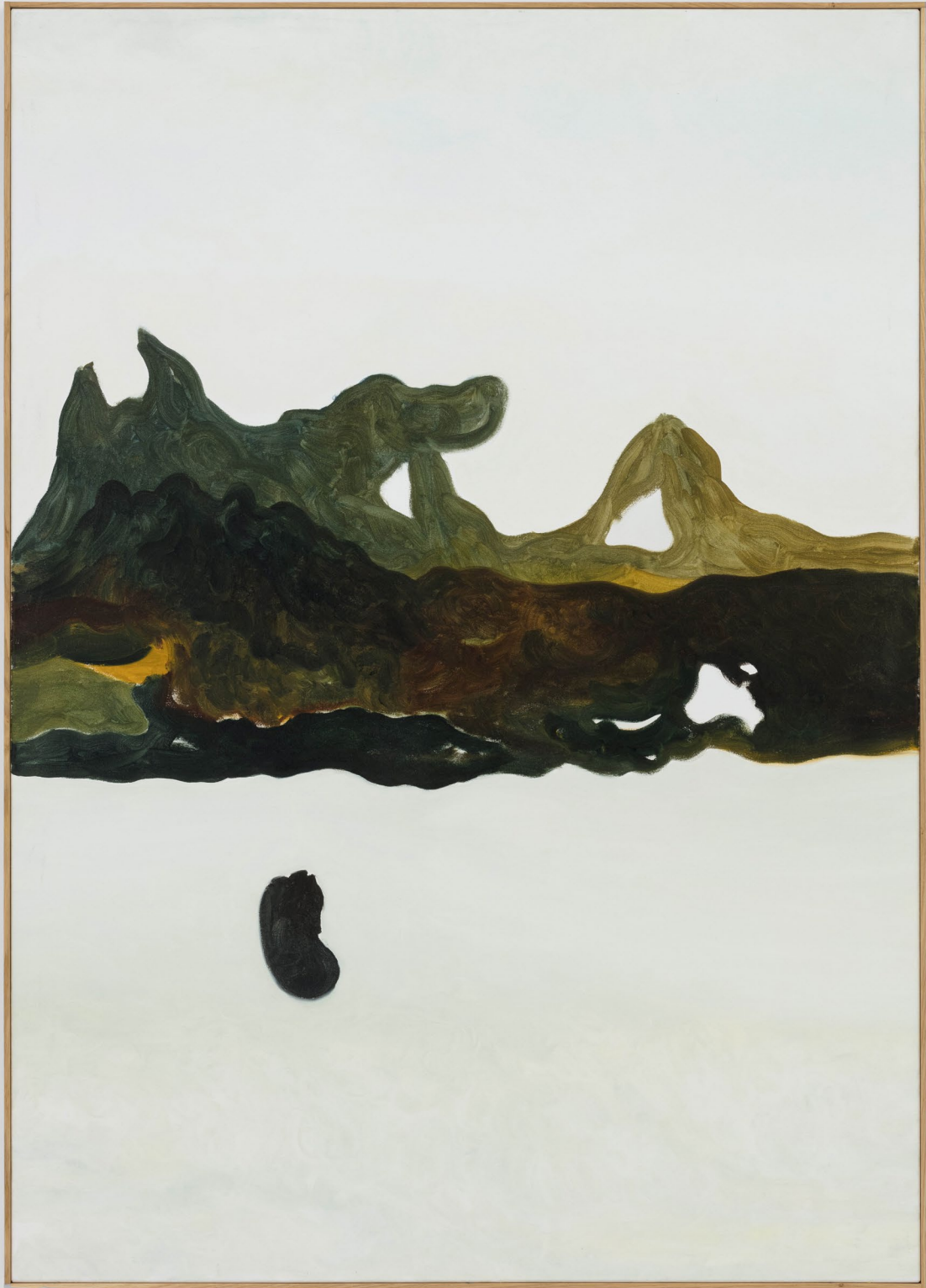
Untitled # 2 2022 Oil on canvas (140 x 100 cm)