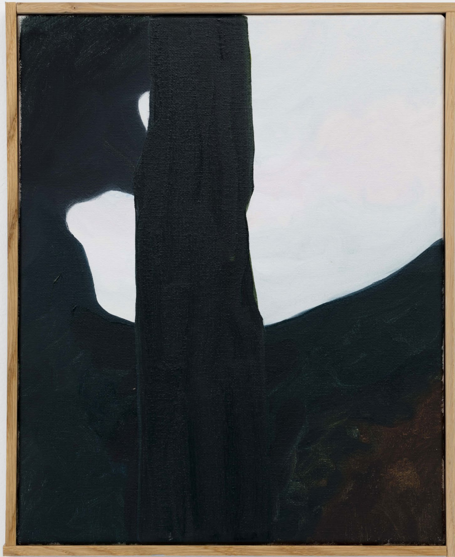
Untitled #3 2022 Oil on canvas (30 x 24 cm)