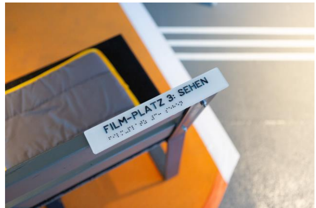
die Blaue Distanz, We Cannot Skip This Part, installation view Kunsthalle Osnabrück, 2021.