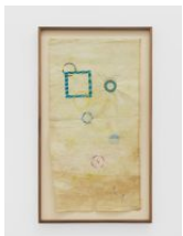
Reto Pulfer Dein Dasein , 2022 Embroidery on plant-dyed fabric 63 x 33.5 cm