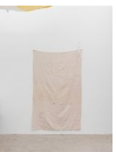
Reto Pulfer ZU2TA , 2022 Embroidery on fabric 200 x 128 cm