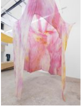
Reto Pulfer Agent Neurolino , 2022 Plant dye on fabric 318 x 342 x 290 cm

1 - 2 WARNER YARD LONDON EC1R 5EY TEL: +44 (0) 207 837 5991 OFFICE@HOLLYBUSHGARDENS.CO.UK