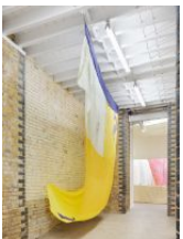
Reto Pulfer Lichtgeist , 2012 Fabric Approx. 340 x 360 x 136 cm Dimensions variable