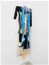
Reto Pulfer Untitled costume , 2022 Mixed media and plant-dye on fabric Dimensions variable. Approximately: 155 x 50 x 15 cm