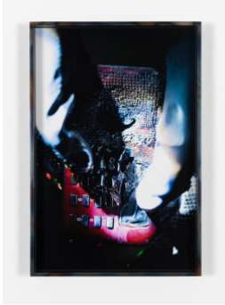
Diane Severin Nguyen Story Control, 2019 LightJet C-print, steel artist's frame 38 x 25 cm 2/3 + 1AP