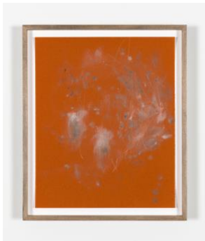
Dora Budor Love Streams (18), 2022 Lexapro (Escitalopram), sandpaper, maple frame, museum glass 31.6 x 26.6 x 3 cm