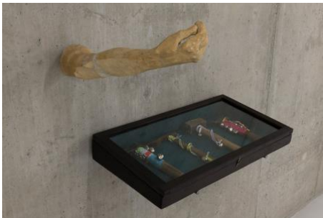
Jesse Darling Deeds II, 2022 Concrete, steel, stoneware, mixed media 40 x 79 x 45 cm