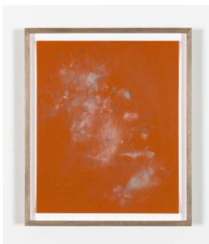
Dora Budor Love Streams (23), 2022 Lexapro (Escitalopram), sandpaper, maple frame, museum glass 31.6 x 26.6 x 3 cm