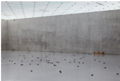
Dora Budor Pucks (Bagarreurs), 2021 Coffee waste, thermoplastic polymer, wax 2.5 x 7.6 cm (each) / 300 pieces total Overall dimensions variable