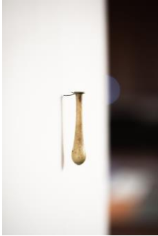
Lydia Ourahmane Tear catcher, circa 400 B.C. Blown glass 12 x 2.5 cm