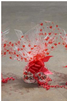
Ghislaine Leung Bosses II, 2019 Two gift wrapped oversized mugs