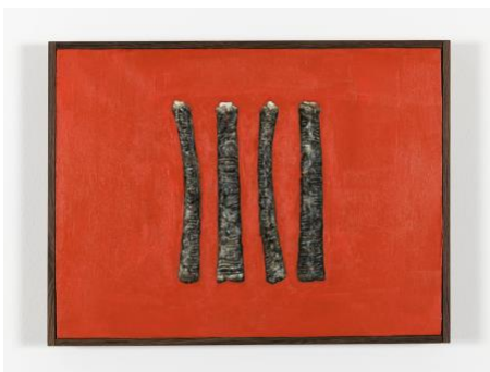
I.N. Cape Untitled, 2019 Oil on canvas 31.5 x 42 cm