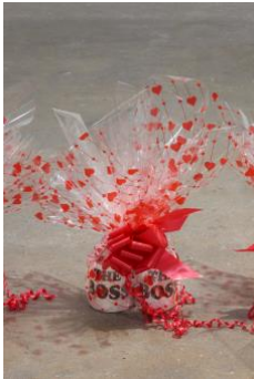
Ghislaine Leung Bosses II, 2019 Two gift wrapped oversized mugs