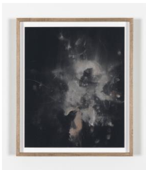
Dora Budor Love Streams (19), 2022 Lexapro (Escitalopram), sandpaper, maple frame, museum glass 31.6 x 26.6 x 3 cm