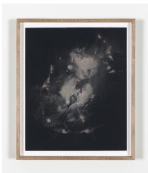
Dora Budor Love Streams (24), 2022 Lexapro (Escitalopram), sandpaper, maple frame, museum glass 31.6 x 26.6 x 3 cm