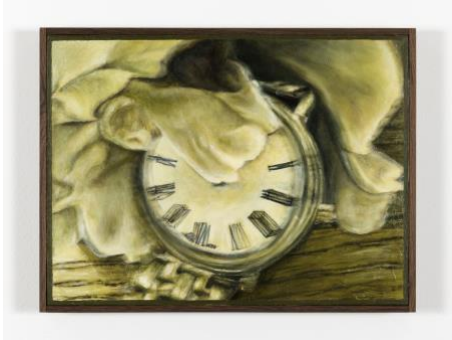
I.N. Cape Untitled, 2019 Oil on canvas 31.5 x 42 cm