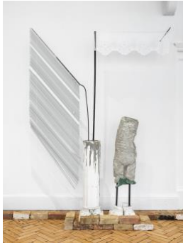
Jesse Darling Inter Alia I, 2022 Concrete, polysterene, steel, plastic, curtain lace, venetian blind 230 x 120 x 54 cm