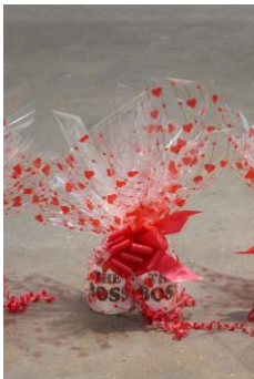
Ghislaine Leung Bosses II, 2019 Two gift wrapped oversized mugs