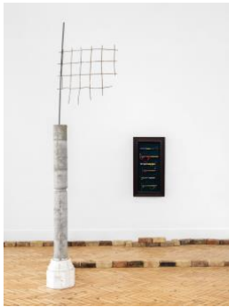
Jesse Darling Corpus (Half-staff), 2022 Concrete, steel, polystyrene 317 x 86 x 33 cm