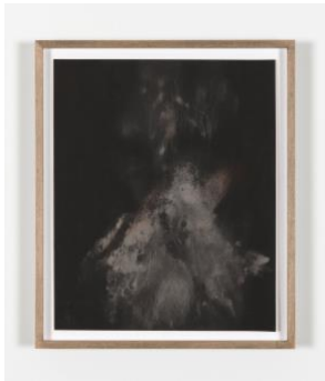
Dora Budor Love Streams (21), 2022 Lexapro (Escitalopram), sandpaper, maple frame, museum glass 31.6 x 26.6 x 3 cm