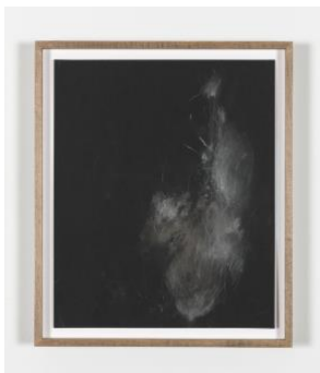
Dora Budor Love Streams (20), 2022 Lexapro (Escitalopram), sandpaper, maple frame, museum glass 31.6 x 26.6 x 3 cm