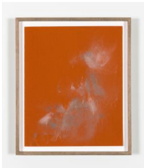
Dora Budor Love Streams (22), 2022 Lexapro (Escitalopram), sandpaper, maple frame, museum glass 31.6 x 26.6 x 3 cm