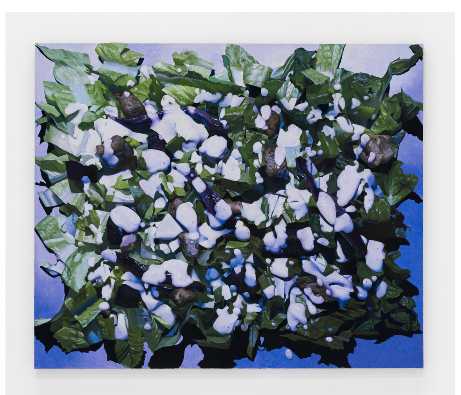
Caesar salad with anchovy filets, 2022. Oil on canvas mounted on panel, 30 x 36 in (76.2 x 91.44 cm)