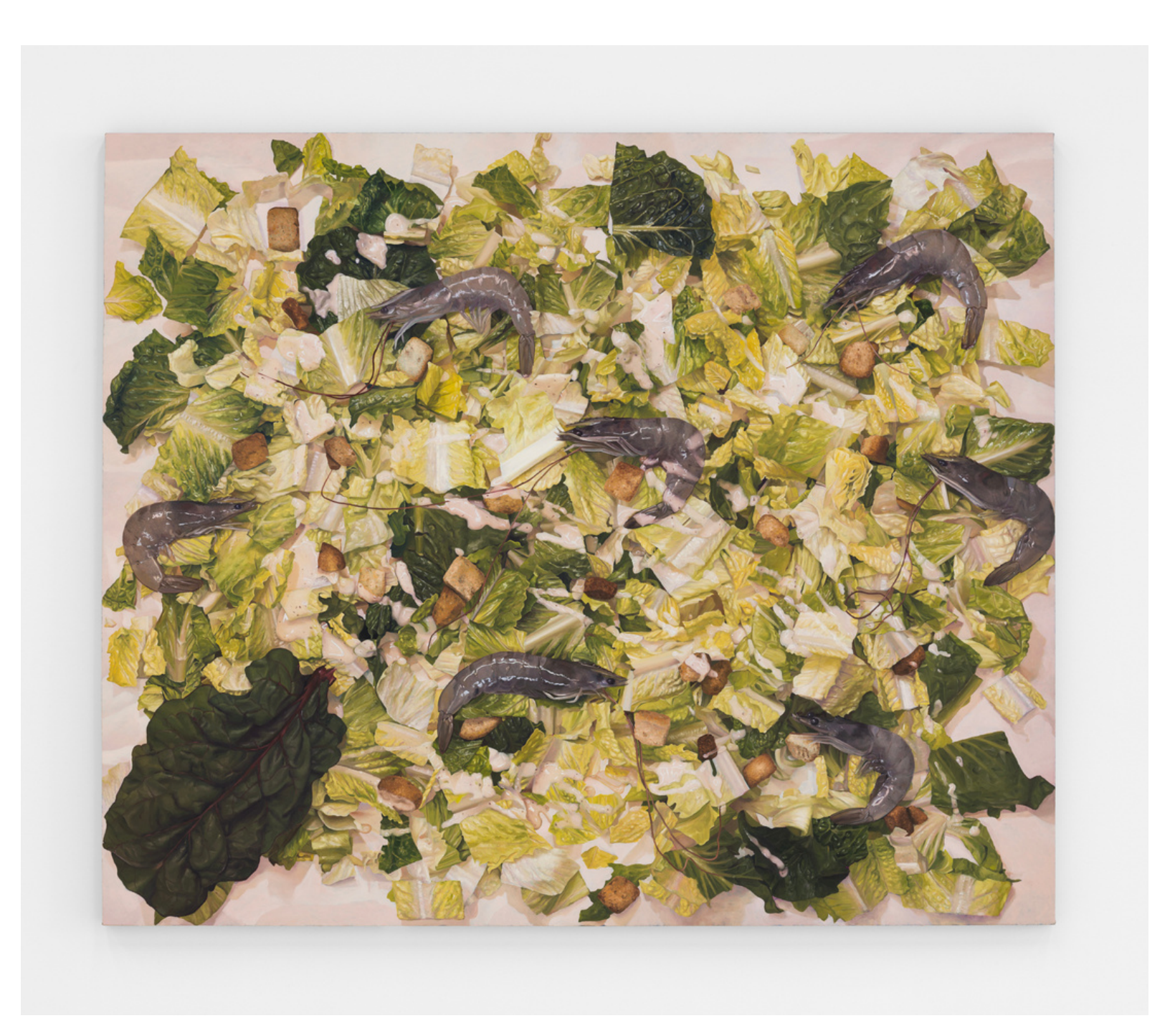
Caesar salad with gulf shrimp and red chard, 2022. Oil on canvas mounted on panel, 60 x 72 in (152.4 x 182.88 cm)