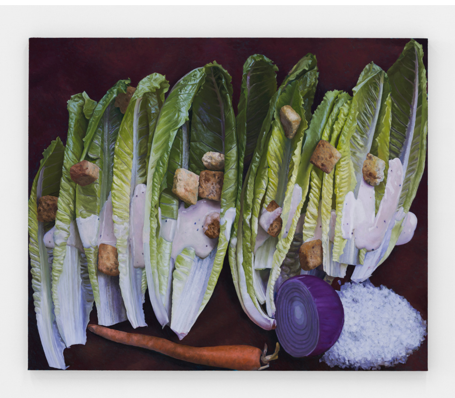
Caesar salad with whole carrot, half an onion, and pile of salt, 2022. Oil on canvas mounted on panel, 30 x 36 in (76.2 x 91.44 cm)