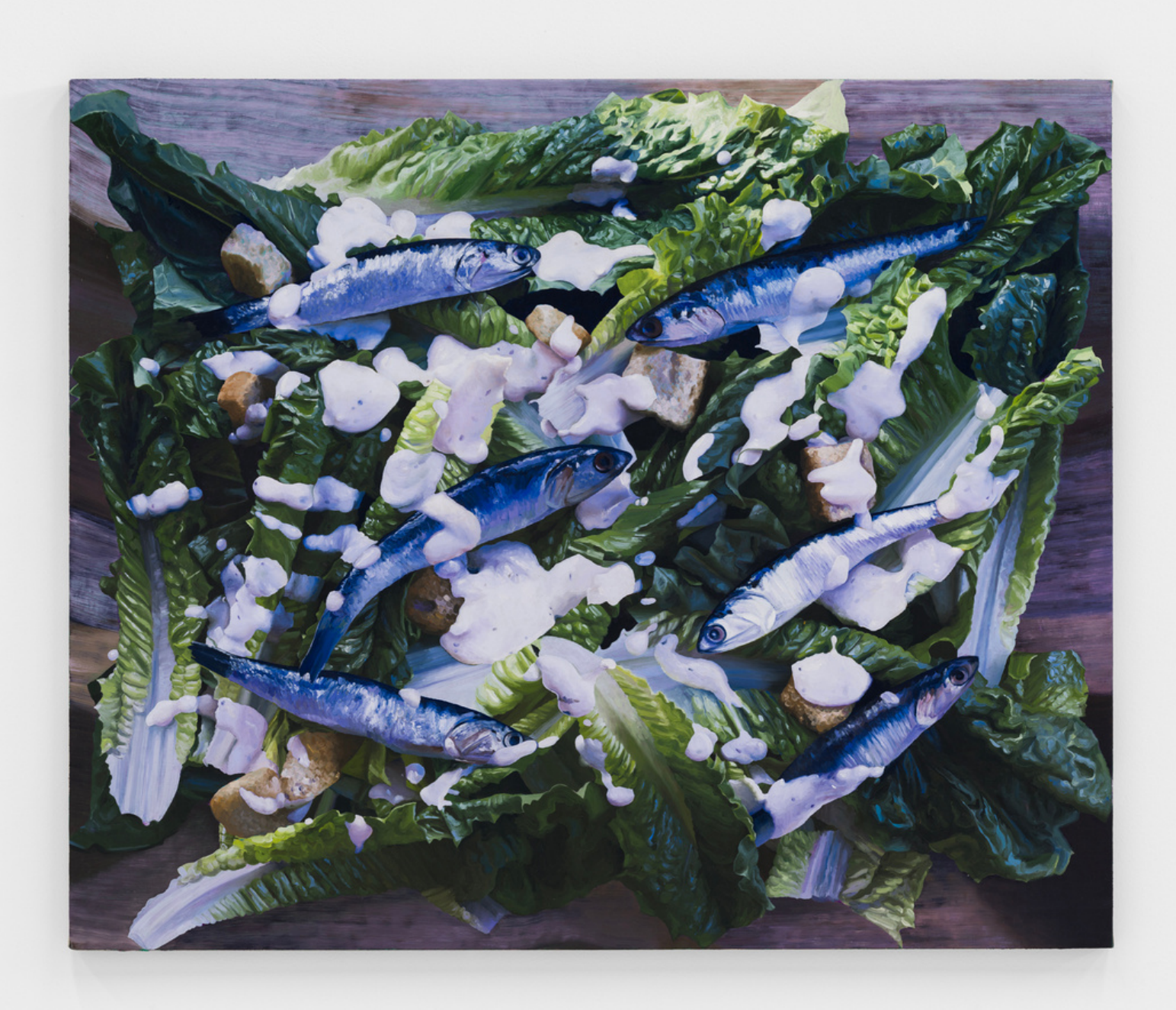
Caesar salad with whole anchovies, 2022. Oil on canvas mounted on panel, 30 x 36 in (76.2 x 91.44 cm)