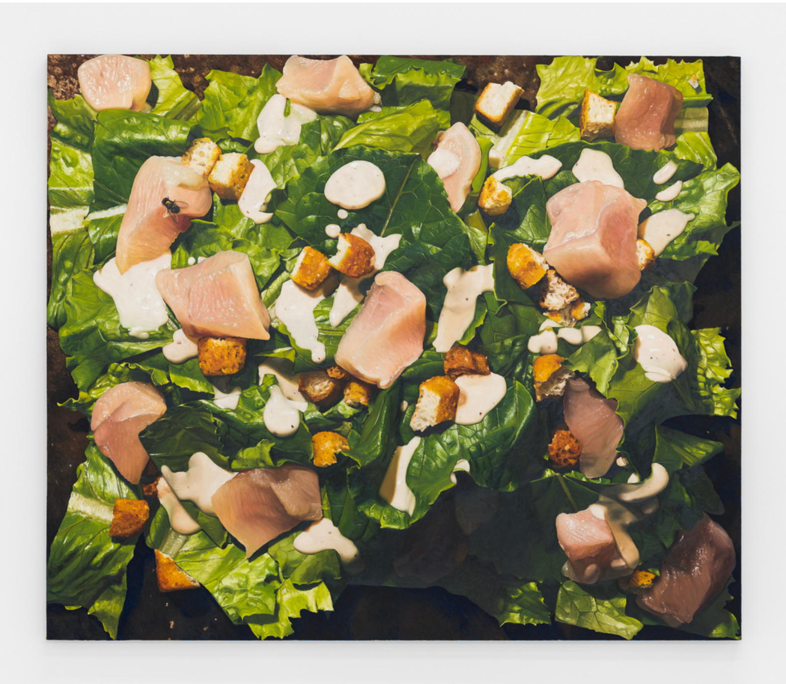
Caesar salad with chicken and housefly, 2022. Oil on canvas mounted on panel, 48 x 57 in (121.92 x 144.78 cm)