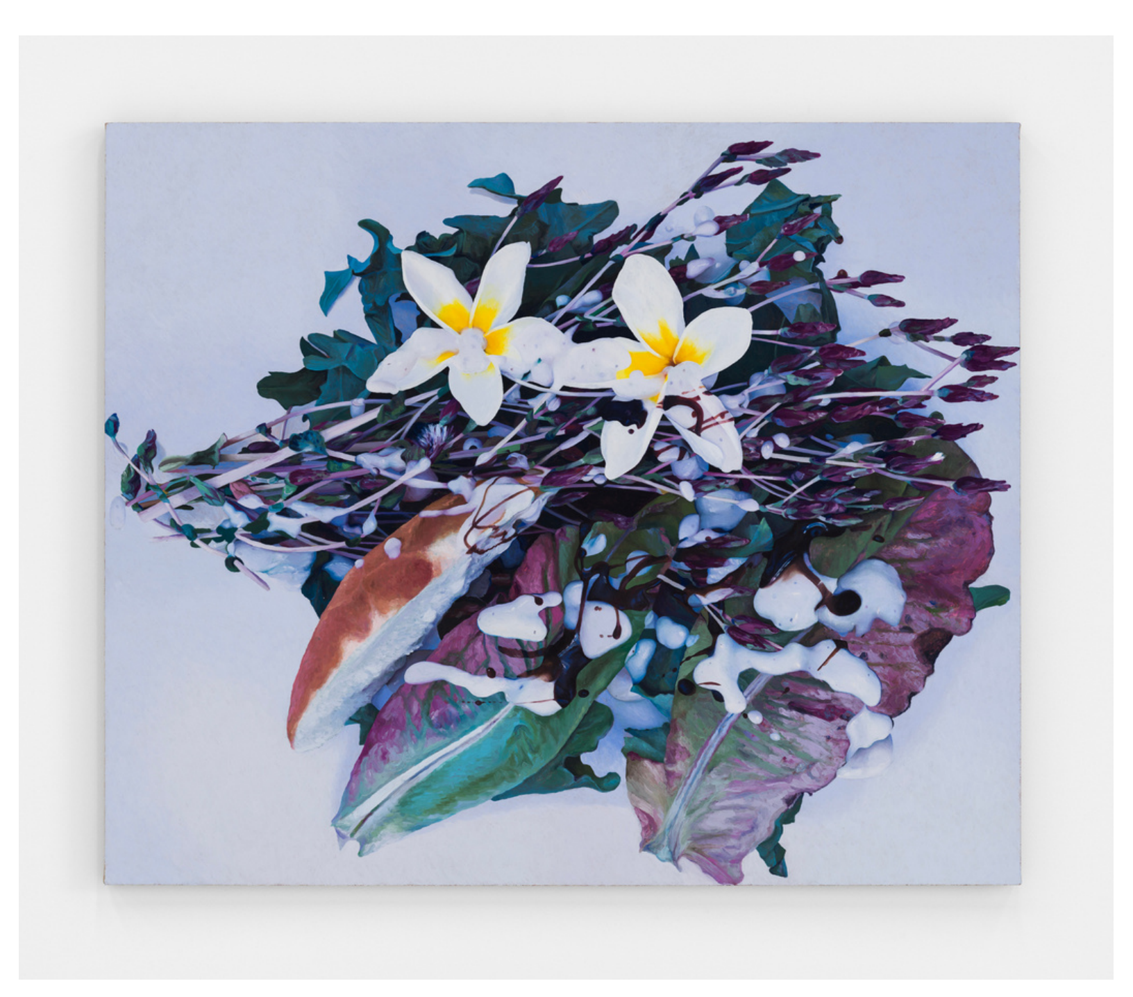
Caesar salad with flowers and crust of bread, 2022. Oil on canvas mounted on panel, 30 x 36 in (76.2 x 91.44 cm)