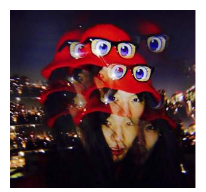
Mahi to the People