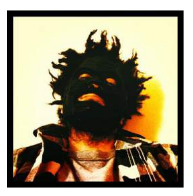
K-BOMB (BLACK SMOKER)