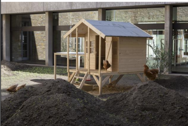
Rosalie Schweiker, Crisis Communication, installation view Kunsthalle Osnabrück, 2020.