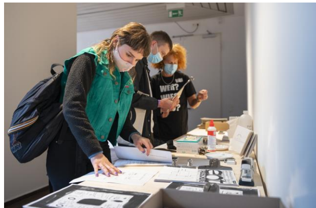
Rosalie Schweiker, Crisis Communication, installation view Kunsthalle Osnabrück, 2020.