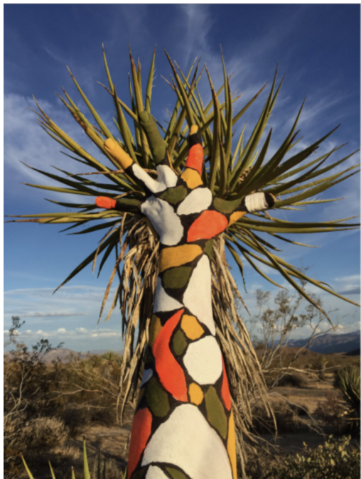
Benny Merris An Other Another 71 , 2016 Archival pigment print on paper, 24 x 18 in.