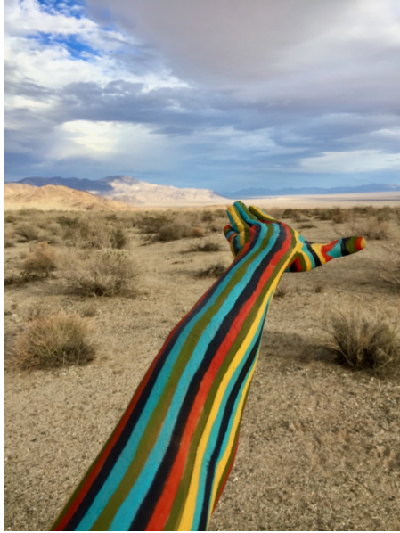
Benny Merris An Other Another 70 , 2016 Archival pigment print on paper, 24 x 18 in.