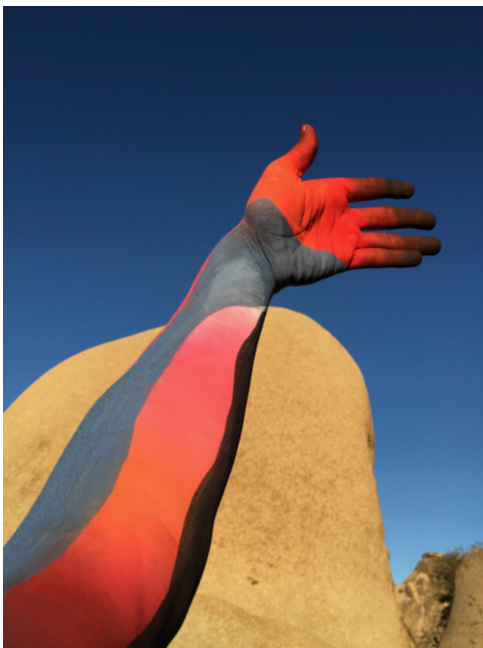
Benny Merris An Other Another 86 , 2016 Archival pigment print on paper, 24 x 18 in.