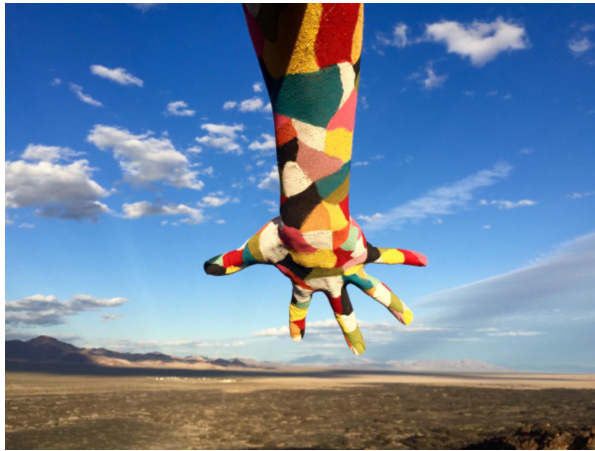
Benny Merris An Other Another 44 , 2015 Archival pigment print on paper, 18 x 24 in.