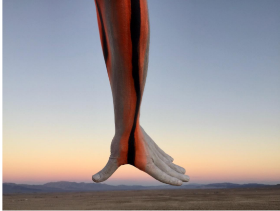
Benny Merris An Other Another 182 , 2015 Archival pigment print on paper, 18 x 24 in.