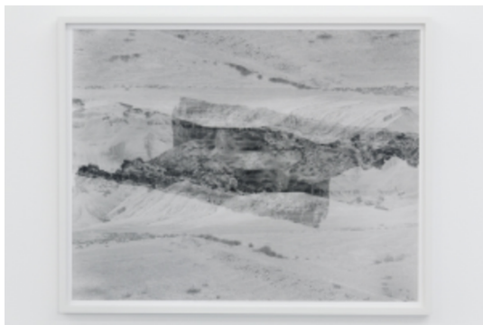
Katherine Hubbard Untitled (same sight invert) , 2014 Silver gelatin print, 20 x 24 in.