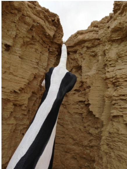
Benny Merris An Other Another 20, 2012 Archival pigment print on paper, 24 x 18 in.