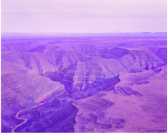
David Benjamin Sherry Muley Point II, Bears Ears National Monument, Utah, 2018 Chromogenic print, 71 x 88.75 in. (image size)