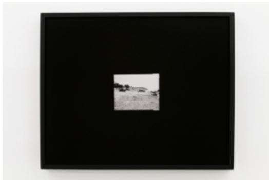
Katherine Hubbard Four shoulders (angle bearing) , 2014 Silver gelatin print, 16 x 20 in.