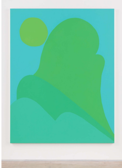
David Benjamin Sherry Ghost, 2022 Acrylic on Canvas, 90 x 70 in.