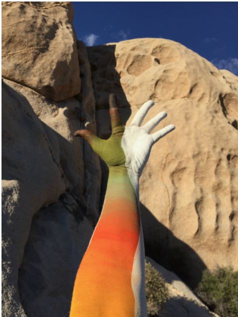
Benny Merris An Other Another 84 , 2015 Archival pigment print on paper, 24 x 18 in.