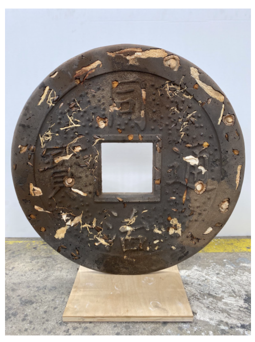
Kenneth Tam Why did you strike me, 2022

Epoxy resin, dirt, sand, dried mushrooms, dried seaweed, dried bamboo shoots, preserved kumquat, pumpkin seeds, preserved apricots, dried roots, steel, 30 x30 x1.5 in.