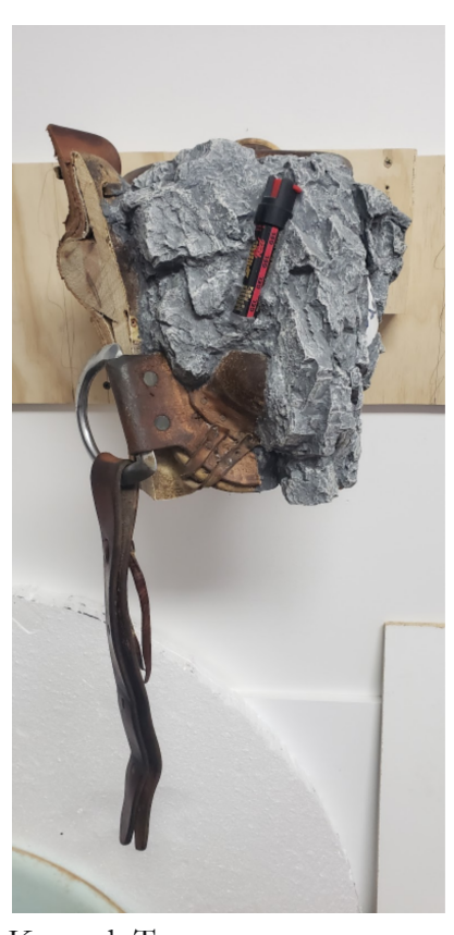
Kenneth Tam At night we talk of home ,2022 Leather saddle, aqua-resin, pepper spray, broken ceramic, paint, steel, 12w x 14h x 10d in. Commissioned by Ballroom Marfa.