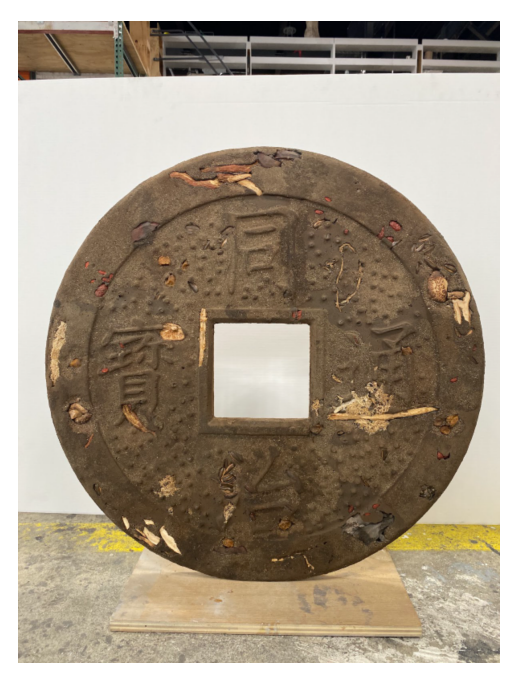
Kenneth Tam Why do you abuse me, 2022

Epoxy resin, dirt, sand, dried mushrooms, dried seaweed, dried bamboo shoots, dried jujube, dried goji berries, preserved apricots, sunflower seeds, dried roots, dried sweet potato, steel, 30 x30 x1.5 in. Commissioned by Ballroom Marfa. Courtesy of the artist and Commonwealth and Council, Los Angeles and Mexico City.