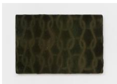
Joseph Yaeger Time Weft, 2022 Watercolour on gessoed cotton 31 x 46.5 x 2 cm 12 1/4 x 18 1/4 x 3/4 in