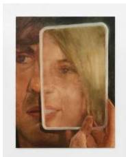
Joseph Yaeger My back pages, 2022 Watercolour on gessoed linen 210 x 160 x 4 cm 82 5/8 x 63 x 1 5/8 in