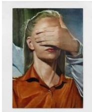
Joseph Yaeger Old long since, 2022 Watercolour on gessoed linen 270 x 190 x 4 cm 106 1/4 x 74 3/4 x 1 5/8 in