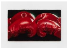
Joseph Yaeger Each one is two, 2022 Watercolour on gessoed linen 56 x 95.5 x 4 cm 22 x 37 5/8 x 1 5/8 in