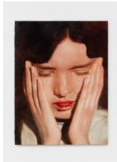
Joseph Yaeger Bug not a feature, 2022 Watercolour on gessoed linen 140 x 105 x 4 cm 55 1/8 x 41 3/8 x 1 5/8 in