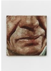
The flame seeking, 2022 Watercolour on gessoed linen 25.5 x 25.5 x 2 cm 10 x 10 x 3/4 in