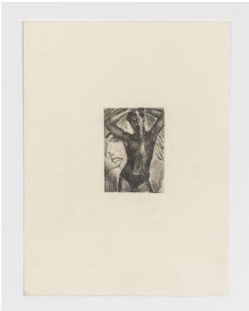
Portrait of a man showering, 2021 Graphite on paper 24.3 x 18.1 cm