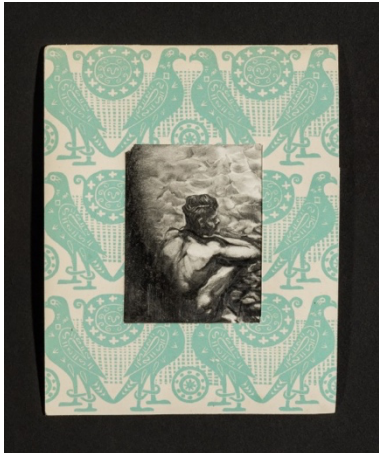
Bodies as Bhoys II, 2022 Graphite on paper, mounted on found paper 15.3 x 12 cm