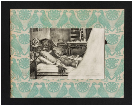
A racialised man reclines (II), 2022 Graphite on paper, mounted on found paper 19 x 24.1 cm