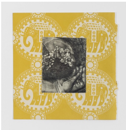
Night blooming Jasmine, 2022 Graphite on paper, mounted on found paper 12.5 x 12.5 cm