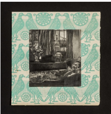
A racialised man reclines (I), 2022 Graphite on paper, mounted on found paper 15.6 x 14.8 cm