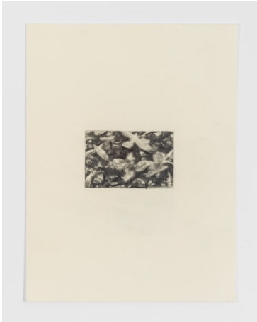
Midnight Horror: Flowers, 2021 Graphite on paper 24 x 18 cm