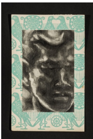
Bodies as Bhoys I, 2022 Graphite on paper, mounted on found paper 15.5 x 9.7 cm