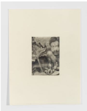
If the finely embroidered backdrop fell, one would still fail to see the beauty of the slum (I), 2022 Graphite on paper 21.7 x 16.4 cm