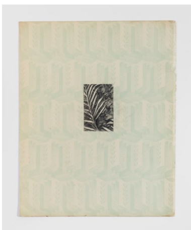
The forest's embrace, 2021 Graphite on paper, mounted on found paper 29 x 20 cm