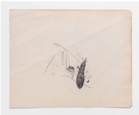
Midnight Horror: Fruit, 2021 Graphite on found paper 31 x 45 cm