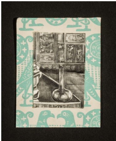
Rich like looted silver or pearls (II), 2022 Graphite on paper, mounted on found paper 7.3 x 5.7 cm