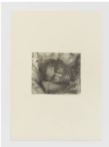
An intimacy so widespread, yet what happens to remain buried and unsaid, 2022 Graphite on paper 21.6 x 15 cm