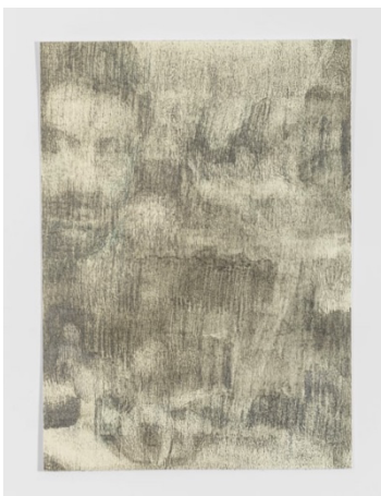
If the finely embroidered backdrop fell, one would still fail to see the beauty of the slum (II), 2022 Solvent transfer on paper 19.2 x 14 cm