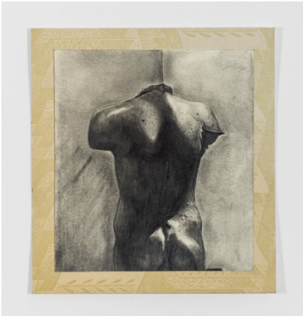
A body excavated, 2022 Graphite on paper, mounted on found paper 13 x 12 cm