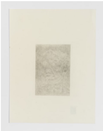
A spectre of empire's extraction, 2021 Graphite on paper 25 x 19 cm