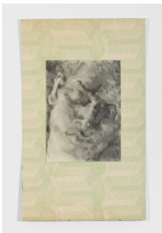
I envision you, caressing me, 2021 Graphite on paper, mounted on found paper 25 x 15.1 cm