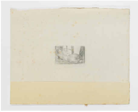
Midnight Horror: A night terror, 2022 Graphite on found paper 30 x 31 cm