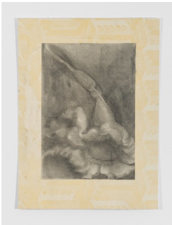
Midnight Horror: Flowers, 2021 Graphite on paper, mounted on found paper 23 x 16.8 cm