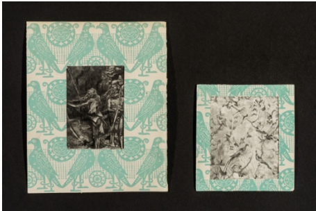
Bodies between wallpaper and trees, 2022 Graphite on paper, mounted on found paper 15.3 x 12.6 and 9.6 x 8.6 cm