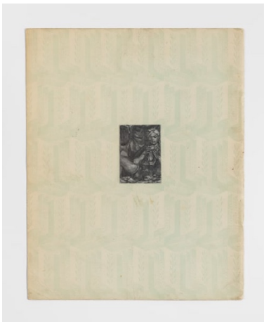
A man in turban holding a sandal, 2021 Graphite on paper, mounted on found paper 31.5 x 24.5 cm