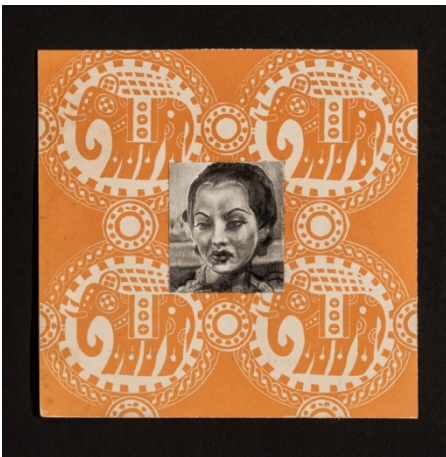
A daughter, a mistress and master, 2022 Graphite on paper, mounted on found paper 12.2 x 11.7 cm