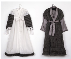
Mimi Smith Biography , 1996 Steel wool, nylon, lace and satin hangers 56 x 72 x 7 in (142.2 x 182.9 x 17.8 cm) MS12257