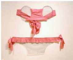
Mimi Smith Bikini , 1965, recreated 1993 Plastic, wire 48 x 48 in (121.9 x 121.9 cm) MS12246