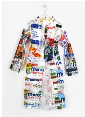
Mimi Smith Recycle Coat , 1965, remade 1993 Plastic, plastic bags, bottle caps, metal hanger 50 x 34 in (127 x 86.4 cm) MS12247