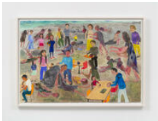
SEAT , 2022 Acrylic on paper 40 × 60 in. (101.60 × 152.40 cm)

A child in potty training was fidgeting, looking like she had to pee, when she suddenly started running.