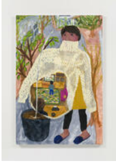
I want to wear a warm sweater. , 2022 Oil on canvas 76 3/8 × 51 1/8 in. (193.99 × 129.86 cm)

My friend tweeted: What do I want to do? When I think about it, I want to wear a warm sweater. I don't have to wear makeup. I didn't want to eat lunch, I just wanted to drink protein, and I wanted to buy a pen to draw with. I can finally move my body normally when I think of what I want to do now.