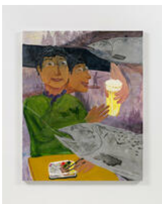
Man's Quest , 2022 Oil on canvas 63 3/4 × 51 1/8 in. (161.93 × 129.86 cm)

I was reminded of the words. I read something about it. In Japanese, care is written as 世話. The kanji 世 I used. I collected and painted many scenes of labor of love.