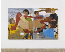
That Humor, 2021 Oil on canvas Diptych, each panel:: 63 3/4 × 51 1/8 in. (161.93 × 129.86 cm) Overall dimension:: 63 3/4 × 102 1/4 in. (161.93 × 259.72 cm)

News that he buried his mother's body in his yard because he had no money for the funeral.