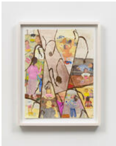
Dying plants , 2017 Acrylic on paper paper size: 25 5/8 × 19 5/8 in. (65.09 × 49.85 cm)