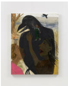
Park Security, 2022 Oil on canvas 46 1/8 × 35 7/8 in. (117.16 × 91.12 cm)

I was reading an account of the childhood of a great writer. I am now witnessing the childhoods of children close to me.