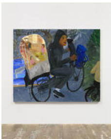
To Mexico , 2022 Oil on canvas 63 3/4 × 73 3/8 in. (161.93 × 186.37 cm)

She is the mother of an 8 year old son and 3 year old twin daughters. The last time I saw her, she was picking up her son from swimming by herself; the 3-year-old twins were sitting at home for a little while. She had been taking care of the children on her own for the past few months because their father had gone on a business trip to Mexico. For the past few months, she had been debating whether to follow her husband to Mexico or return to her parents' home in Kyushu, but yesterday she decided to return to Kyushu.