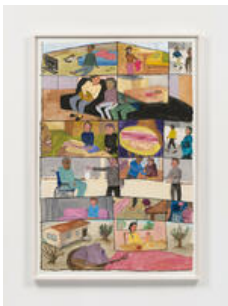
世 , 2021 Acrylic on paper Paper size: 60 × 40 in. (152.40 × 101.60 cm)

This painting is the scene right after the atomic bombing, when people gather on the riverbank in search of water. I was very impressed by this scene, described from a very detached perspective, even though she herself was exposed to radiation. It reminded me of a crowded food court in a shopping mall.