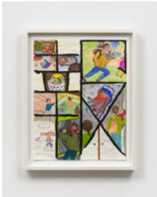
Reward (報酬) , 2017 Acrylic on paper Paper size: 25 5/8 × 19 5/8 in. (65.09 × 49.85 cm)