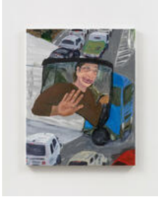
Truck Driver, 2022