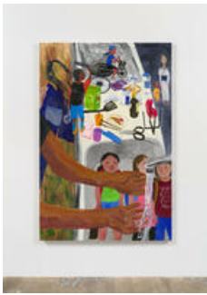
Childhood, 2022 Oil on canvas 76 3/8 × 51 1/8 in. (193.99 × 129.86 cm)

I was reading a novel about Minamata disease by Michiko Ishimure. I loved the scene where she entertained her guests with kindness and humor, turning the obstacles and hardships caused by Minamata disease into laughter. It reminded me of the communication among the grandmothers around me.