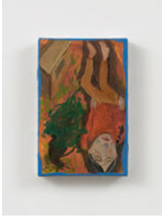
Bury in the garden, 2022 Oil on canvas 13 × 7 1/2 in. (33.02 × 19.05 cm)

News that he buried his mother's body in his yard because he had no money for the funeral.