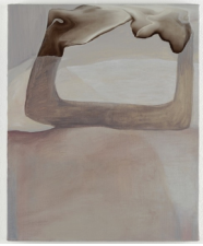
Rezi van Lankveld b. 1973 View , 2022 Oil on canvas 55 x 44 cm 21 5/8 x 17 5/16 in. (AP-LANKR-00335)