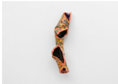
Lynda Benglis b. 1941 Bird's Nest #12, 2016 Glazed ceramic 92.7 x 21.6 x 21.6 cm approx. 36.5 x 8.5 x 8.5 in approx. (AP-BENGL-00001)