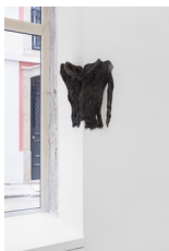
Enzo Cucchi b. 1949 BUCO DI CULO, 2017 Bronze 40 x 29 x 24 cm 15 3/4 x 11 7/16 x 9 7/16 in. (AP-CUCCE-00002)