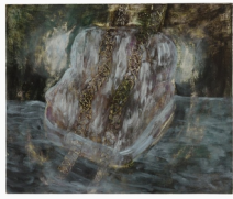
Rinella Alfonso b. 1995 Two corn in a row, 2022 Egg tempera on wood 50 x 60 cm 19 11/16 x 23 5/8 in. (AP-ALFOR-00001)