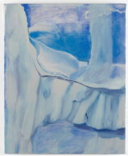
Rezi van Lankveld b. 1973 The colour of my room , 2022 Oil on canvas 58 x 46 cm 22 13/16 x 18 1/8 in. (AP-LANKR-00336)