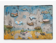
Erika Verzutti b. 1971 Diorama of Fish , 2021 Oil on papier mâché, bronze, aluminium 82 x 117 x 5 cm 32 1/4 x 46 1/8 x 2 in (AP-VERZE-00002)