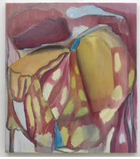
Rezi van Lankveld b. 1973 Pink Cloud , 2020 Oil on canvas 55 x 48 cm (21 5/8 x 18 7/8 in) (AP-LANKR-00329)