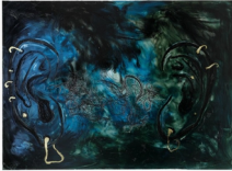
Rinella Alfonso b. 1995 We are here, we are pierced, 2022 Oil, hair on wood 89 x 122 cm 35 1/16 x 48 in. (AP-ALFOR-00003)