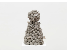
Erika Verzutti b. 1971 Poodle with News , 2022 Papier-mâché, polymer clay and acrylic paint 52 x 38 x 38 cm 20 1/2 x 14 15/16 x 14 15/16 in. (AP-VERZE-00003)