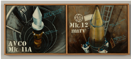
AVCO Mk.11A/Mk.12 mirv, 1983, acrylic on canvas, 8 x 20"