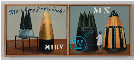
MIRV/MX, 1983, acrylic on canvas, 8 x 20"