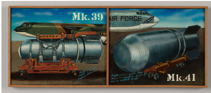
Mk.39/Mk.41, 1983, acrylic on canvas, 8 x 20"