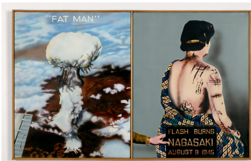
"Fat Man"/Flash Burns, Nagasaki, August 9 1945 , 1983, acrylic on canvas, 20 x 32"