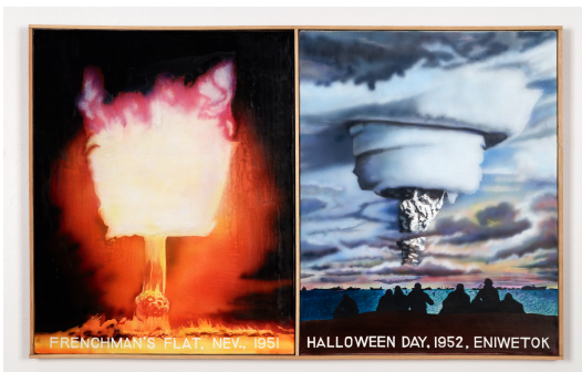
Frenchman's Flat, Nev., 1951/Halloween Day, 1952, Eniwetok, 1983, acrylic on canvas, 20 x 32"