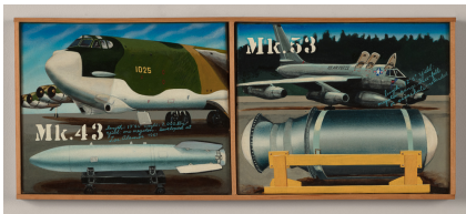
Mk.43/Mk.53, 1983, acrylic on canvas, 8 x 20"