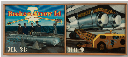
Broken Arrow 14 Mk.28/MD-9, 1983, acrylic on canvas, 8 x 20"