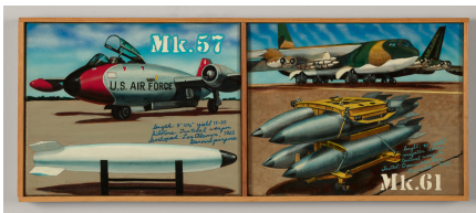
Mk.57/Mk.61, 1983, acrylic on canvas, 8 x 20"