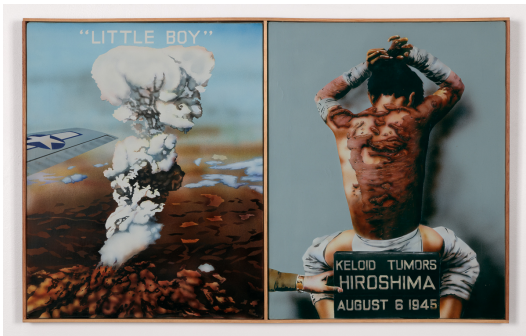
"Little Boy"/Keloid Tumors, Hiroshima, August 6 1945 , 1983, acrylic on canvas, 20 x 32"