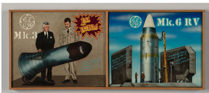
Mk.3/Mk.6 RV, 1983, acrylic on canvas, 8 x 20"