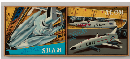
SRAM/ALCM, 1983, acrylic on canvas, 8 x 20"