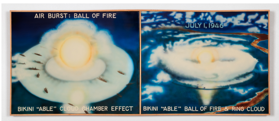
Bikini "Able" Cloud Chamber Effect/Bikini "Able" Ball of Fire & Ring Cloud , 1983, acrylic on canvas, 16 x 40"