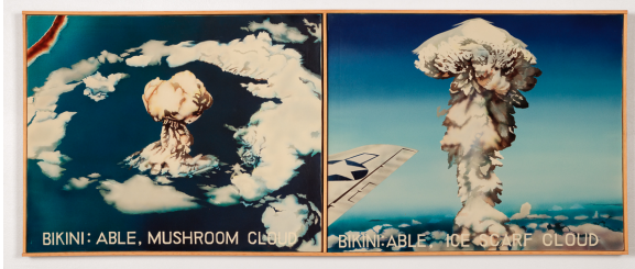
Bikini: Able, Mushroom Cloud/Bikini: Able, Ice Scarf Cloud, 1983, acrylic on canvas, 16 x 40"