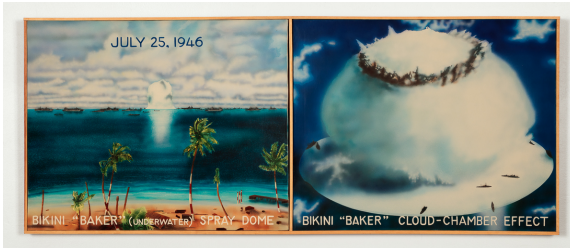
Bikini "Baker (Underwater) Spray Dome/Bikini "Baker" Cloud-Chamber Effect, 1983, acrylic on canvas, 16 x 40"