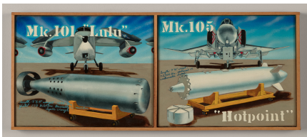
Mk. 101 "Lulu"/Mk.105 "Hotpoint", 1983, acrylic on canvas, 8 x 20"