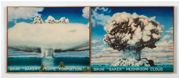
Bikini "Baker" Plume Formation/Bikini "Baker" Mushroom Cloud, 1983, acrylic on canvas, 16 x 40"