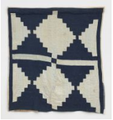
Delia Bennett Bricklayer , c. 1967 Cotton 80h x 74w in dbennett001