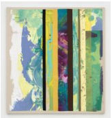
Rachel Eulena Williams Fall Scrap Flag , 2022 Acrylic on canvas, dye canvas and polyester 68h x 73w in rewilliams002