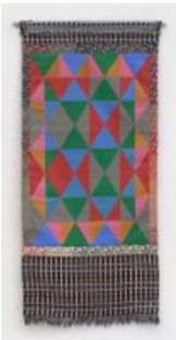
Faith Ringgold Windows of the Wedding #6: Patience and Understanding , 1974 Acrylic on canvas 80h x 35 1/2w in fringgold001