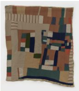
Susie Mae Ponds Crazy Quilt , c. 1974-75 Cotton and polyester 73h x 63w in smponds003