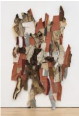
Tau Lewis look how long I've been crying to get to you! , 2018 Hand sewn recycled fabrics, furs, and leathers Approx. 124 x 65 inches tlewis001