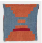
Sarah Young Housetop , c. late 1970s Corduroy and cotton 81h x 75w in syong002