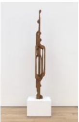
Mildred Thompson Untitled, from the Vespers Series , c. mid-1990s Wood 71h x 9 1/2w x 8 1/2d in mthompson002