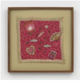
Betye Saar Designs of Destiny , 1981 Mixed media collage on silk scarf in artist's frame 25 1/2h x 25 3/4w in bsaar001