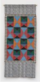
Faith Ringgold Windows of the Wedding #14: Fathers , 1974 Acrylic on canvas 83 1/2h x 36 1/4w in fringgold002