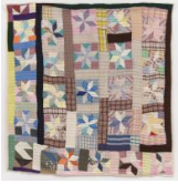
Essie Bendolph Pettway Star Rows , 1970 Cotton 86h x 88w in ebpettway001