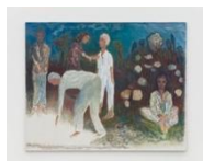
Behrang Karimi awakening in a dream , 2021 oil on linen 120 x 150 cm – 47 1/4 x 59 inches