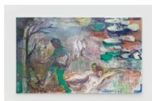
Behrang Karimi search of a bird , 2022 oil on canvas 120 x 200 cm – 47 1/4 x 78 3/4 inches © Behrang Karimi, courtesy Maureen Paley, London Photo: Mark Blower