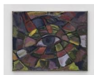
Behrang Karimi caleidos , 2022 oil on canvas 24 x 30 cm – 9 1/2 x 11 3/4 inches © Behrang Karimi, courtesy Maureen Paley, London Photo: Mark Blower