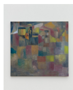
Behrang Karimi o. T. , 2020 oil on linen 115 x 120 cm – 45 1/4 x 47 1/4 inches © Behrang Karimi