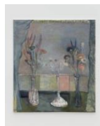
Behrang Karimi denken, reden, handeln , 2022 oil on canvas 130 x 115 cm – 51 1/8 x 45 1/4 inches © Behrang Karimi, courtesy Maureen Paley, London Photo: Mark Blower

STUDIO M Rochelle School 7 Playground Gardens London E2 7FA