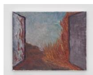
Behrang Karimi Porta Katharsis , 2022 oil on canvas 24 x 30 cm – 9 1/2 x 11 3/4 inches © Behrang Karimi, courtesy Maureen Paley, London Photo: Mark Blower