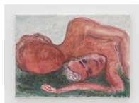
Behrang Karimi protectere , 2022 oil on linen 33 x 45 cm – 13 x 17 3/4 inches © Behrang Karimi, courtesy Maureen Paley, London Photo: Mark Blower