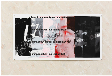
sorry for being not chill (Puppy Fear) silkscreen monograph on 300g paper, 62 x 32.5 cm, 2022