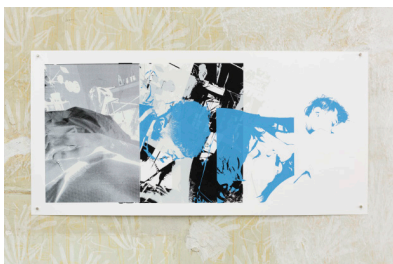
sorry for being not chill (spend.it.on.me) silkscreen monograph on 300g paper, 70 x 34 cm, 2022