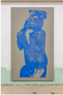
silly me still clings to the promise held in my memory of his glistening shell IV silkscreen on textile, 240 x 140 cm, 2022