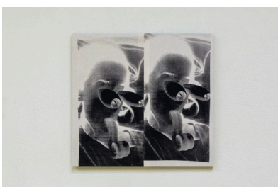
Ok let's chill - but I'm not chill silkscreen on canvas, 41 x 43 cm, 2022