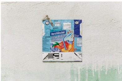
we could have been satiated strangers found Durstlöscher, 15.5 x 16 cm, 2022