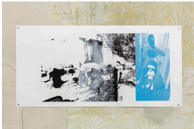
sorry for being not chill (too much fun II) silkscreen monograph on 300g paper, 70 x 35 cm, 2022