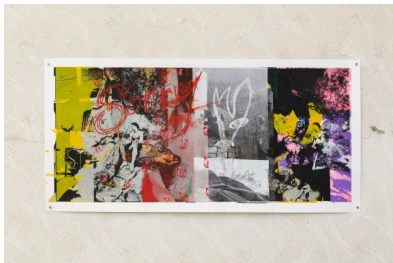
sorry for being not chill (deux Pastis II) silkscreen monograph on 300g paper, 68 x 33 cm, 2022