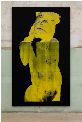
silly me still clings to the promise held in my memory of his glistening shell V silkscreen on textile, 240 x 140 cm, 2022