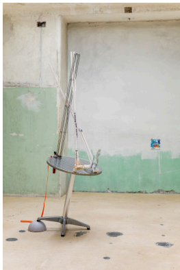
I may be sick? I made u sick! bistro table, wood, found objects, silkscreen on textile, resin, 195 x 120 x 65 cm, 2022