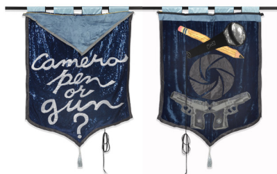
Cauleen Smith Camera, Pen, or Gun? , 2017 recto/verso

Satin, poly-satin, silk-rayon velvet, indigo-dyed silk rayon velvet, indigo-dyed silk satin, rayon-polyester ribbon, acrylic fabric paint, satin cord, poly-silk tassel, and sequins 73 x 47 inches The Mohn Family Trust