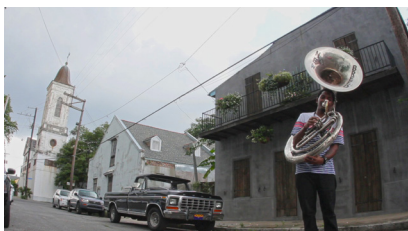
Cauleen Smith H-E-L-L-O , 2014 (video still) Digital video, with sound, 11:06 minutes

Satin, poly-satin, silk-rayon velvet, indigo-dyed silk rayon velvet, indigo-dyed silk satin, rayon-polyester ribbon, acrylic fabric paint, satin cord, poly-silk tassel, and sequins 73 x 47 inches The Mohn Family Trust