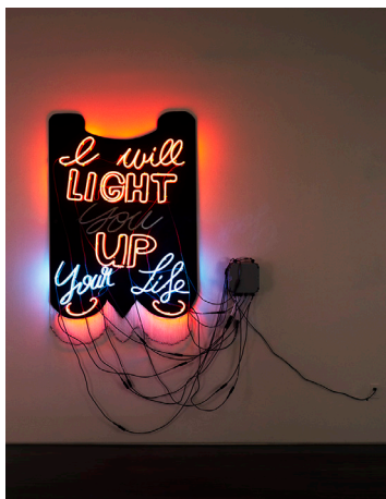
Cauleen Smith Light Up Your Life (For Sandra Bland) , 2019 Neon, Plexiglas, faceted hematite, and aluminum chain 106 3/4 x 68 x 5 inches Blanton Museum of Art, The University of Texas at Austin. Commissioned and produced by Artpace San Antonio. Purchase through the generosity of an anonymous donor, 2020

The title of the exhibition—and the expansive video installation at its center—suggests that, in fact, “We Already Have What We Need.”