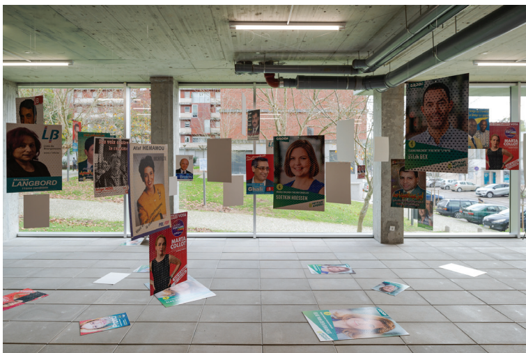
Willem Oorebeek, Obstakles , 2022 Willem Oorebeek-7.tiff