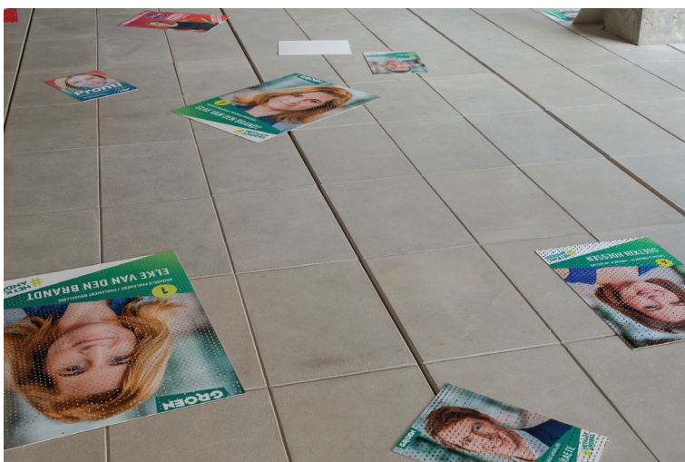
Willem Oorebeek, Obstakles, 2022 Willem Oorebeek-10.tiff