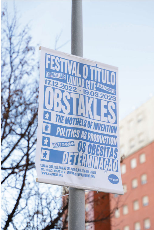
Willem Oorebeek, Obstakles, 2022 Willem Oorebeek-14.tiff