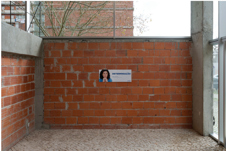
Willem Oorebeek, Obstakles, 2022 Willem Oorebeek-4.tiff