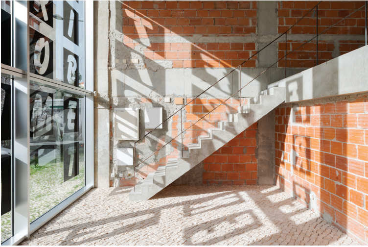
Willem Oorebeek, Obstakles , 2022 Willem Oorebeek-2.tiff