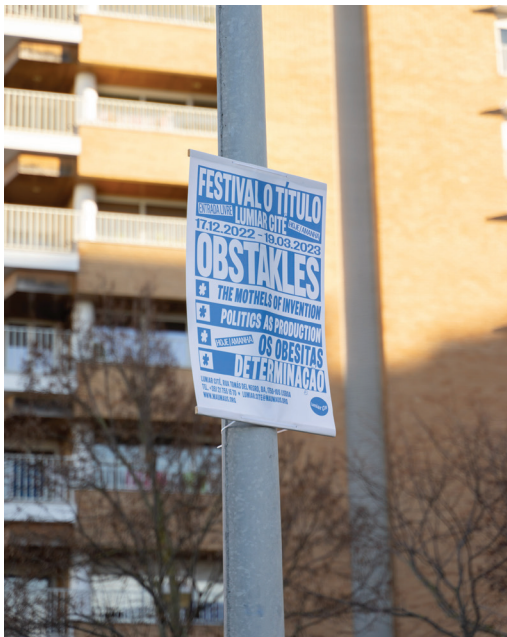
Willem Oorebeek, Obstakles, 2022 Willem Oorebeek-15.tiff