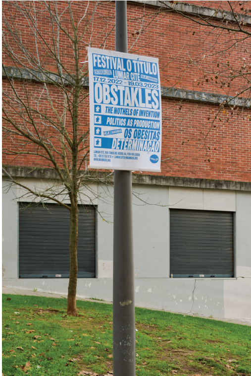
Willem Oorebeek, Obstakles , 2022 Willem Oorebeek-13.tiff