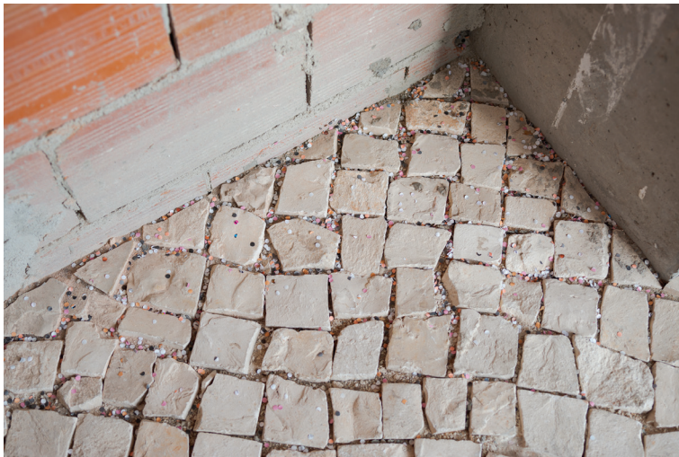
Willem Oorebeek, Obstakles , 2022 Willem Oorebeek-5.tiff