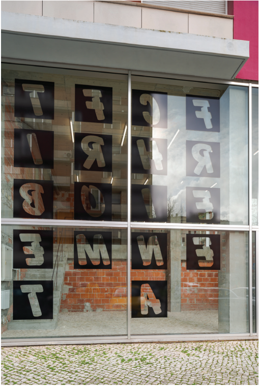
Willem Oorebeek, Obstakles , 2022 Willem Oorebeek-1.tiff