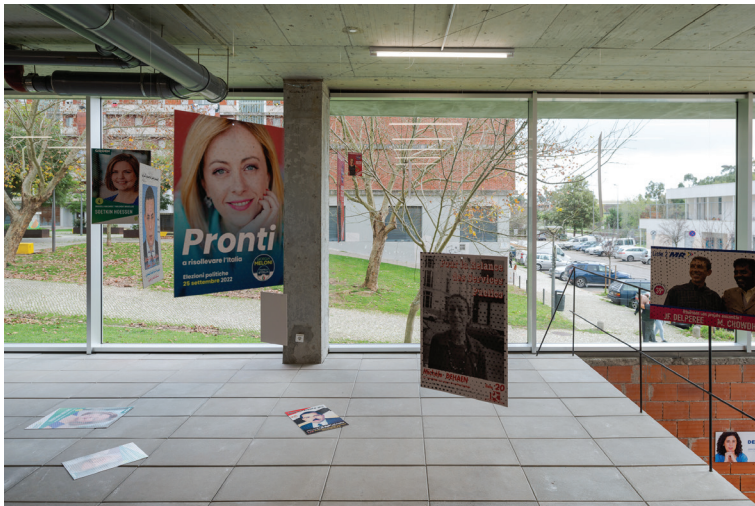
Willem Oorebeek, Obstakles , 2022 Willem Oorebeek-6.tiff