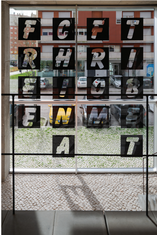
Willem Oorebeek, Obstakles, 2022 Willem Oorebeek-3.tiff