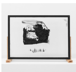
Nora Schultz Niche 2022 glass, wax, wood 44,5 x 63 x 18 cm 17,52 x 24,80 x 7,09 in DEP-NS-0051