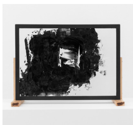
Nora Schultz Niche 2022 glass, wax, wood 39,5 x 53,5 x 18 cm 15,55 x 21,06 x 7,09 in DEP-NS-0049