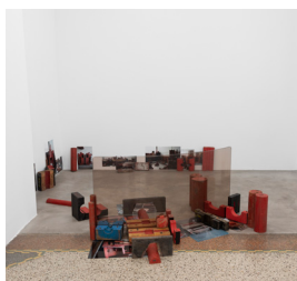
Nora Schultz Lens-Eating-Glass-Making-Machine 2023 plexiglass wooden molds from Durobor glass factory, photographs 63,5 x 230 x 255 cm 25 x 90,55 x 100,39 in DEP-NS-0054