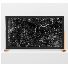
Nora Schultz Fish 2022 glass, wax, wood 41 x 71 x 18 cm 16,14 x 27,95 x 7,09 in DEP-NS-0052