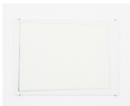
Nora Schultz Draft Proposal for Yellow Glass 2023 crayon and watercolor on paper 29,5 x 42 cm 11,61 x 16,54 in DEP-NS-0050