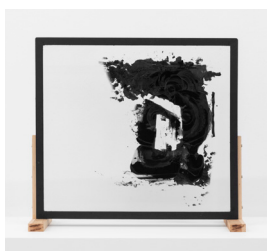
Nora Schultz Niche 2022 glass, wax, wood 48,5 x 54 x 18 cm 19,09 x 21,26 x 7,09 in DEP-NS-0047