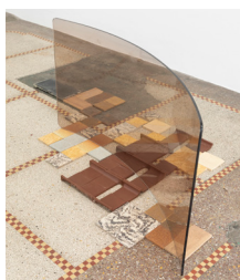
Nora Schultz Contact Lens with Tile Relief 2023 plexiglass, tiles 65,5 x 88 x 100 cm 25,79 x 34,65 x 39,37 in DEP-NS-0048