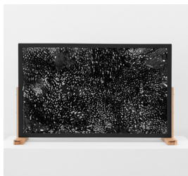
Nora Schultz Fished 2022 glass, wax, wood 43 x 69 x 18 cm 16,93 x 21,17 x 7,09 in DEP-NS-0053